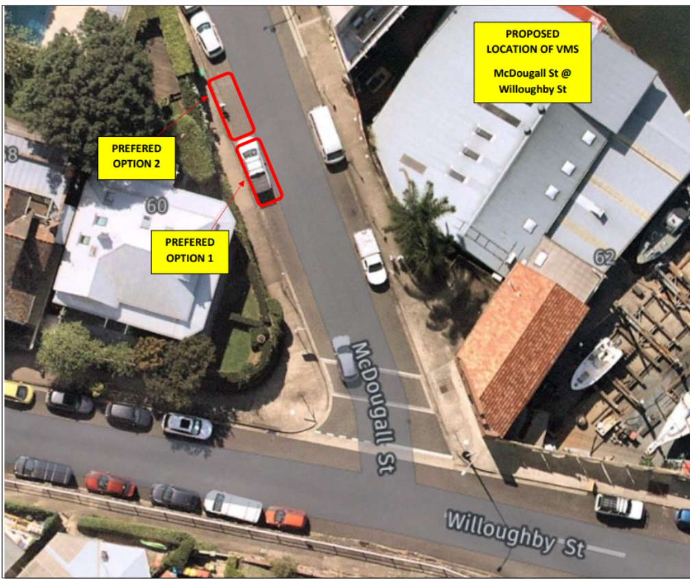
Image 2 and 3: Preferred locations map on McDougall Street sent with notification letter