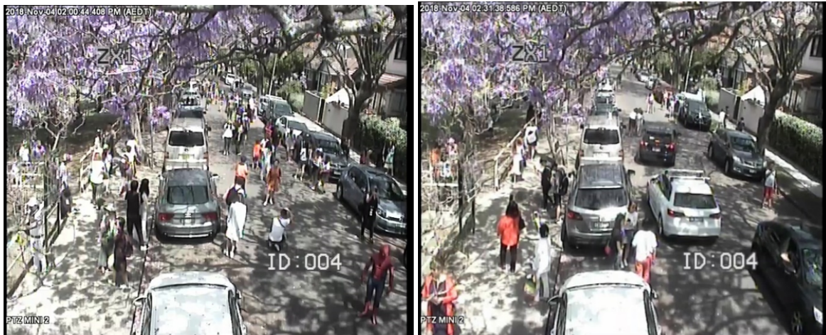
Figure 2 typical observations from CCTV footage during jacaranda blooming (November 2018)