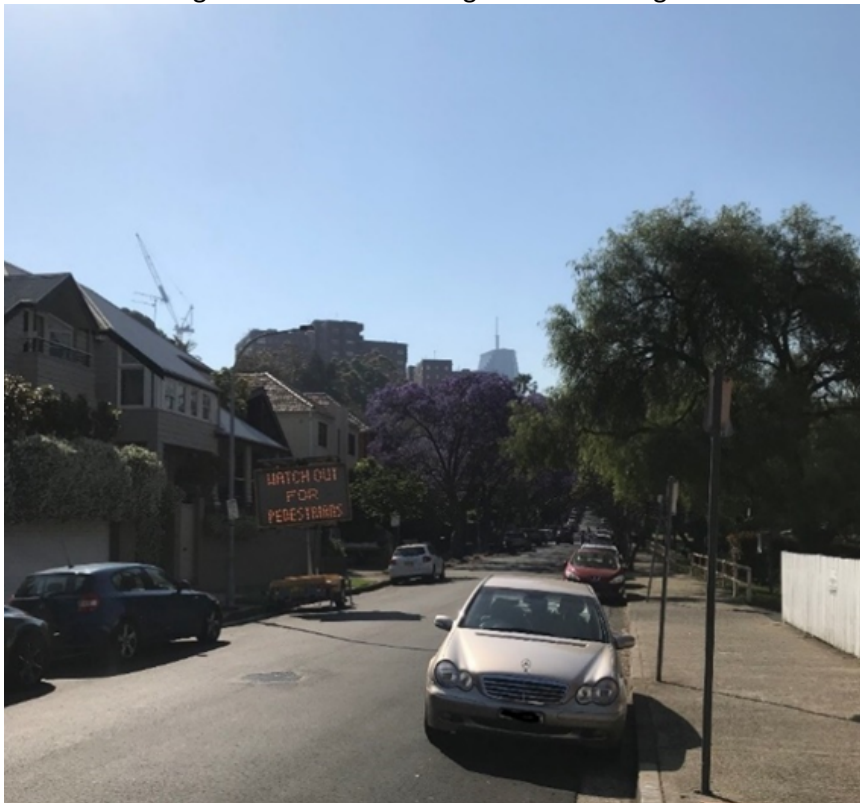
Photo 4. VMS Signs installed in McDougall Street during the 2019 Season