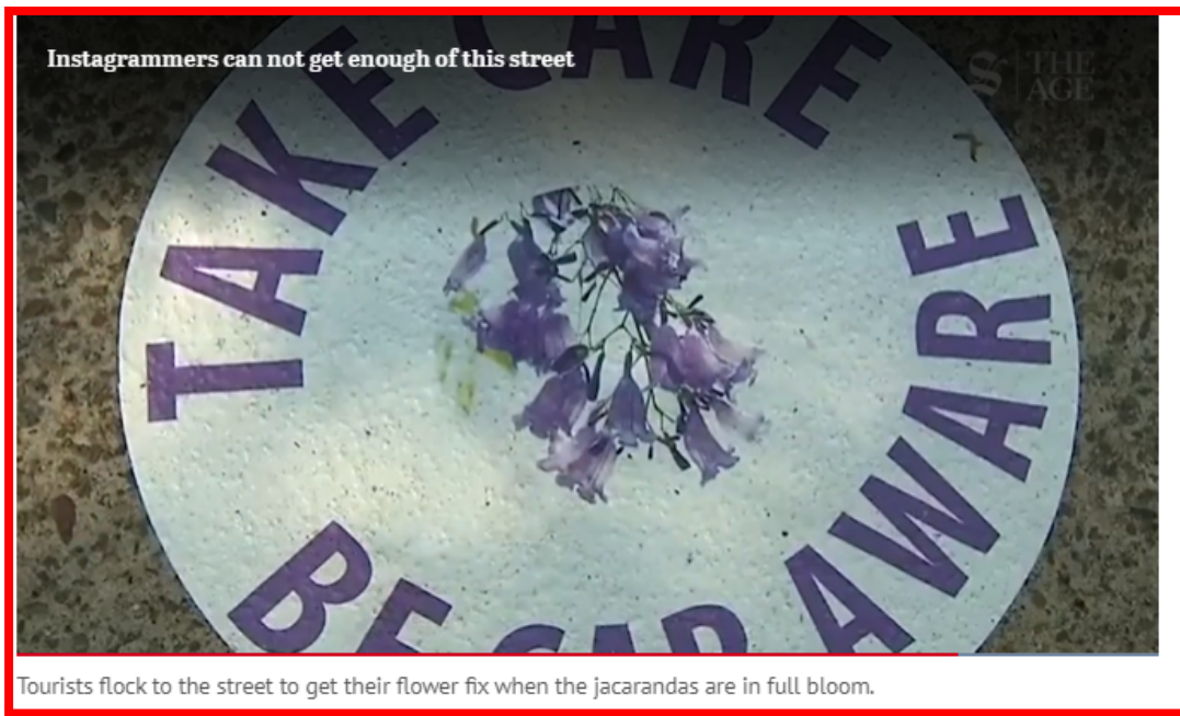
Photo 2. Temporary footpath signage used in 2019.