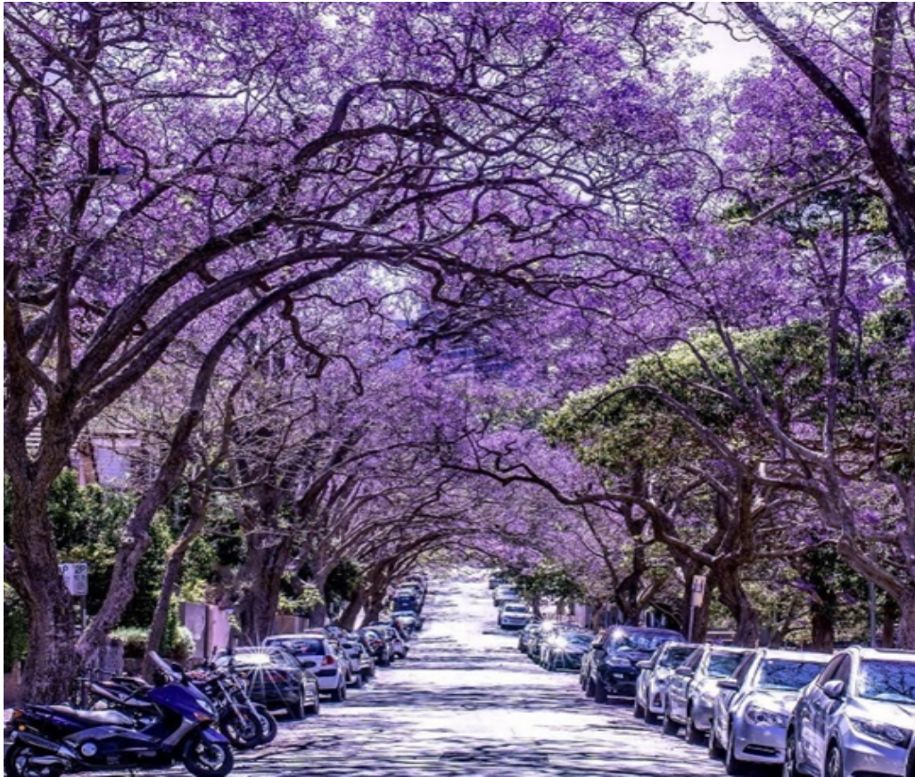
Photo 1. McDougall Street during Jacaranda Season 2018.