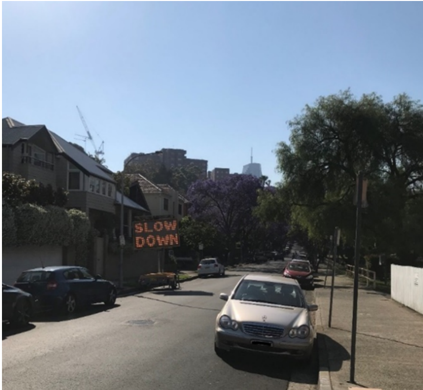
Photo 3. VMS Signs installed in McDougall Street during the 2019 Season