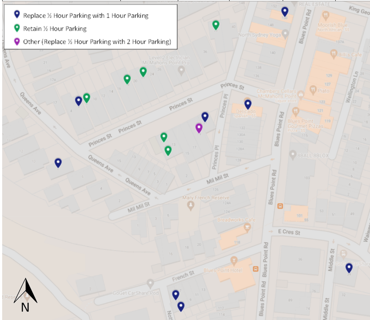
Figure 1 Plot of survey response to Question 1 – preference for restriction time limit

Q3. The current parking restrictions operate Monday to Friday. I would like them to operate (choose one):