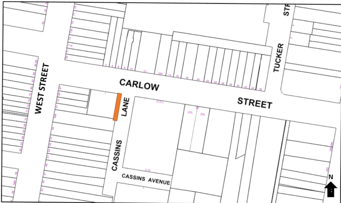
Area 21 – Cassins Lane – Approximate location of proposed change (orange)

Diagram of Cassins Lane and approximate location of the proposed changes: