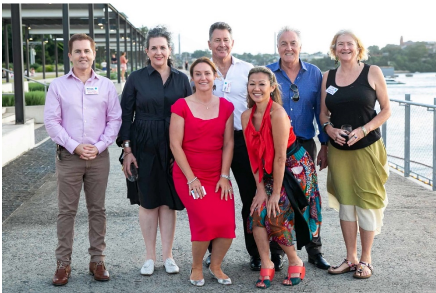
Above photos: Better Business Partnership networking event – The Coal Loader

The program has recently embarked on a new partnership with Green Caffein ( https://greencaffein.com.au/ ) a swap cup program providing an alternative to single use coffee cups. Recent reports from Best Bagel Co located in Cremorne suggest that in just the first two days of the initiative running they have reported a diversion of over 100 single use coffee cups which would otherwise have been destined for landfill. Averaging this out over a year, this is a saving of 368.44kg of carbon dioxide (CO 2 e), 33kgs of plastic and A$2,000 saving to the business for not having to purchase single use cups.