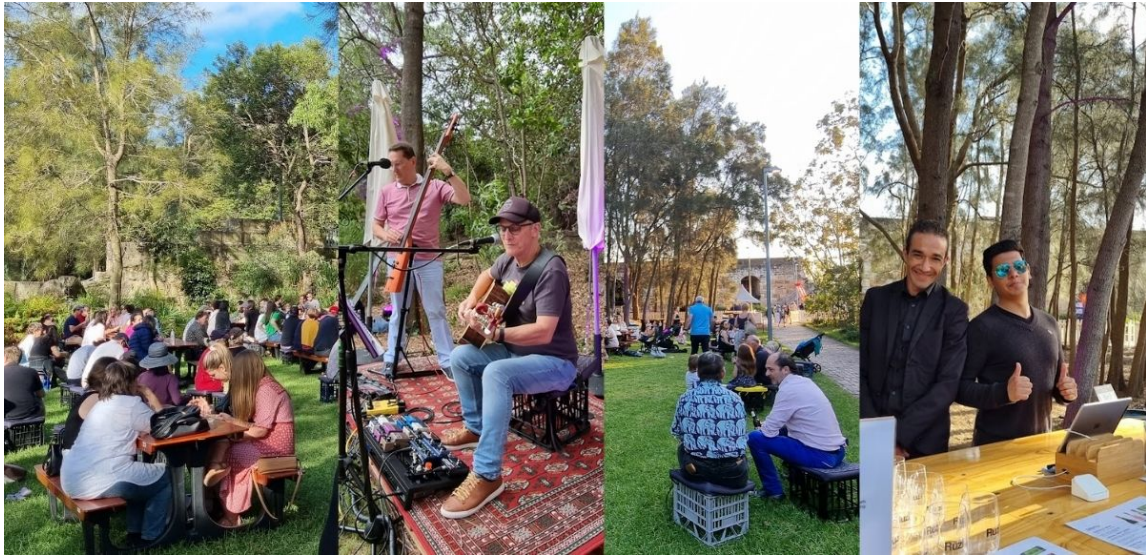
Pop-up bar with live music on the Lower Lawn, December 2021