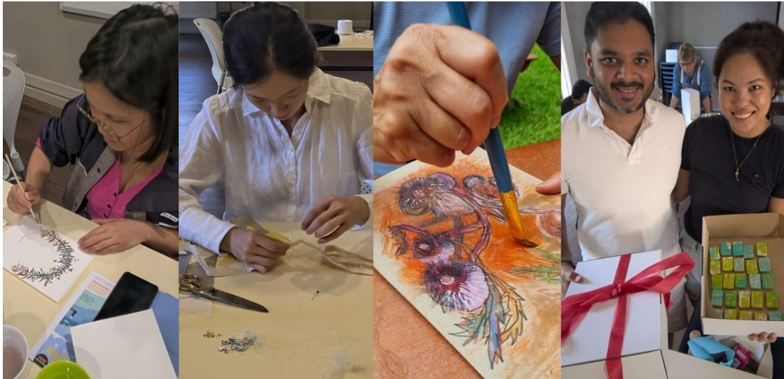
This Thursday's Theme sustainable crafting classes, various 2021