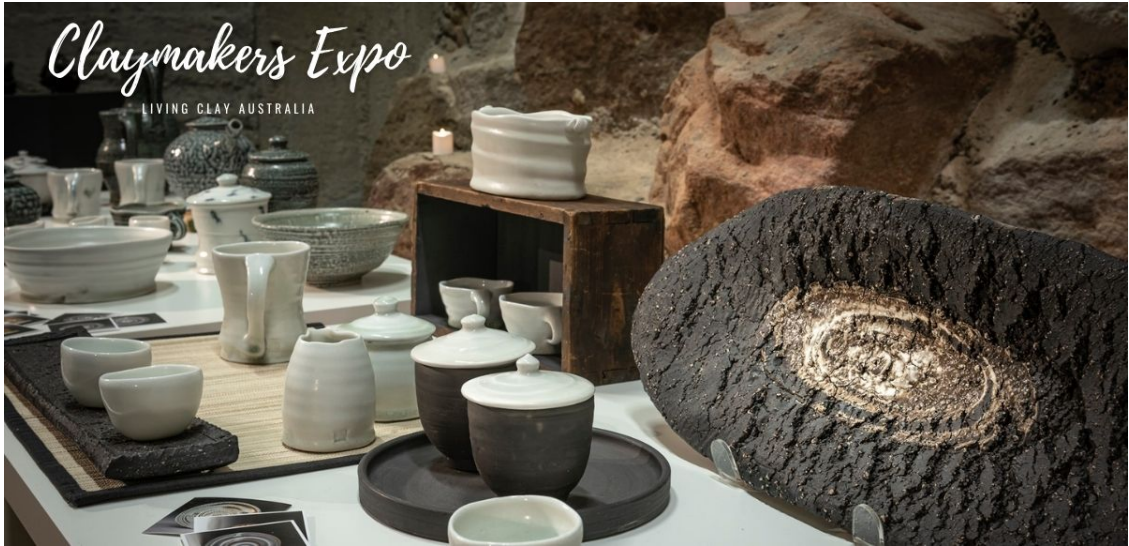
Sydney Claymakers Expo 2021