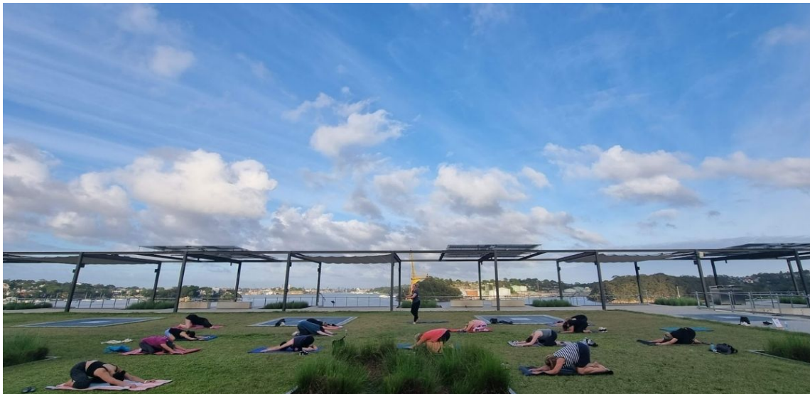
Wednesday Wellness weekly classes, 2021 and 2022