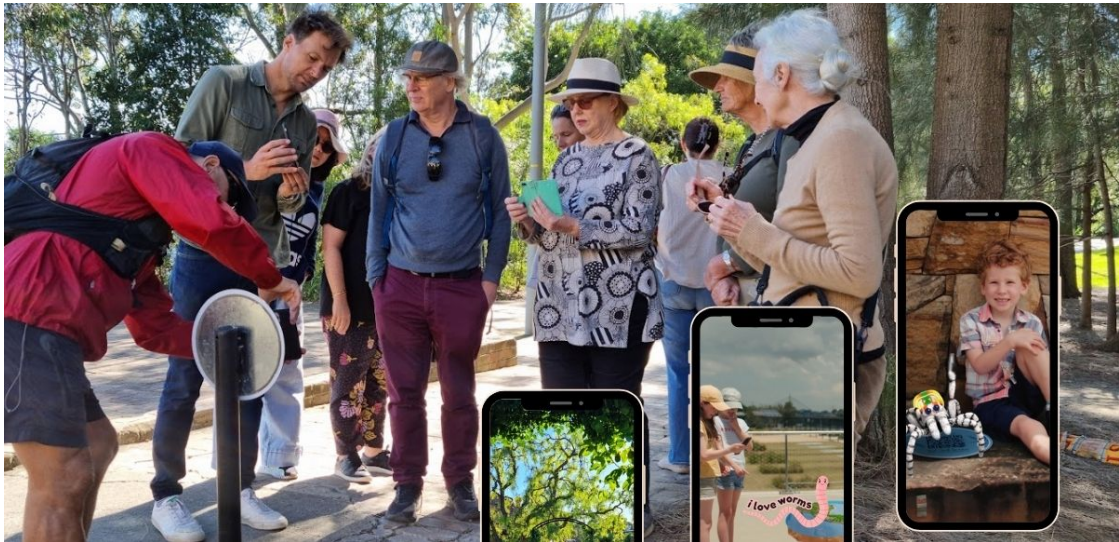
The Coal Loader Augmented Reality App