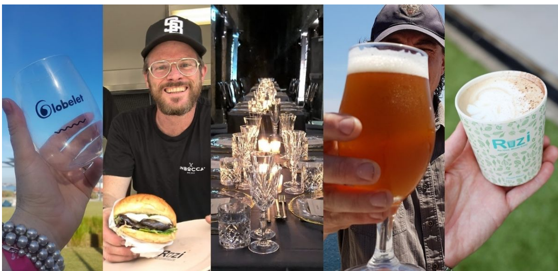
Working with 3 rd party events to deliver single-use-plastic free events