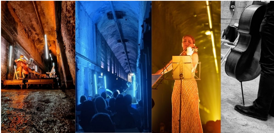
Music in the Sky concert series in Tunnel One, February and March 2022