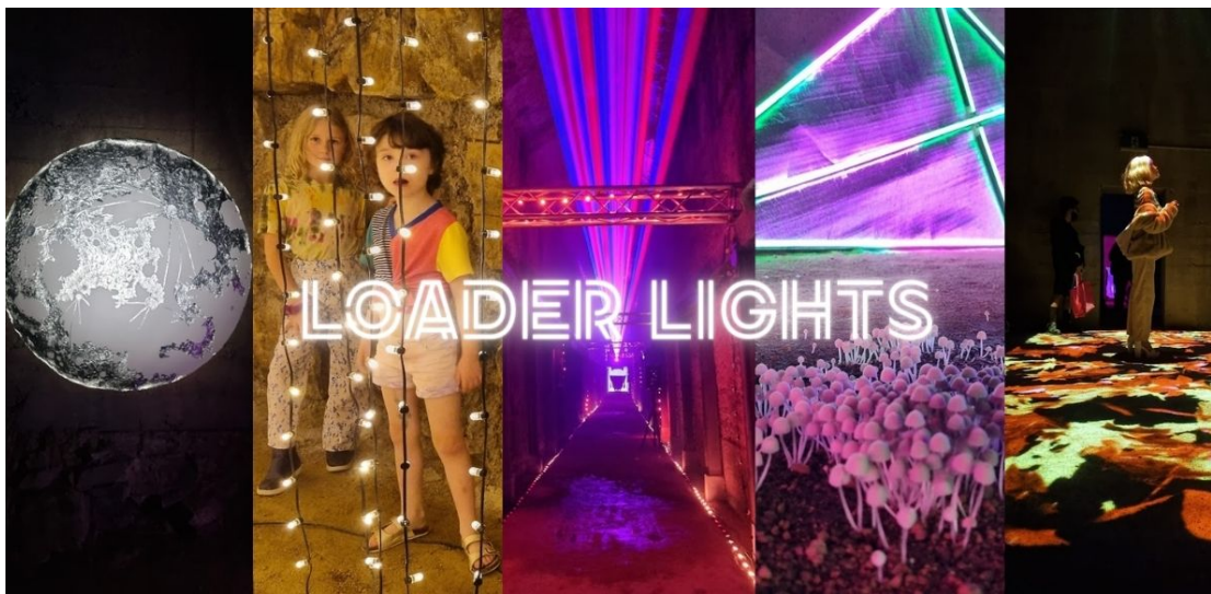
Loader Lights, December 2021