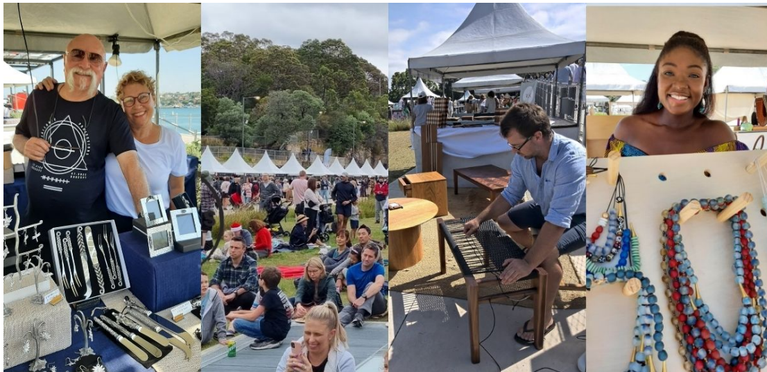
The Coal Loader Artisans Market, December 2021

The volunteer run, not for profit library opened briefly in May 2021 before being affected by the NSW shutdown, and then re-launching in time for The Coal Loader Christmas Artisans Market 2021.