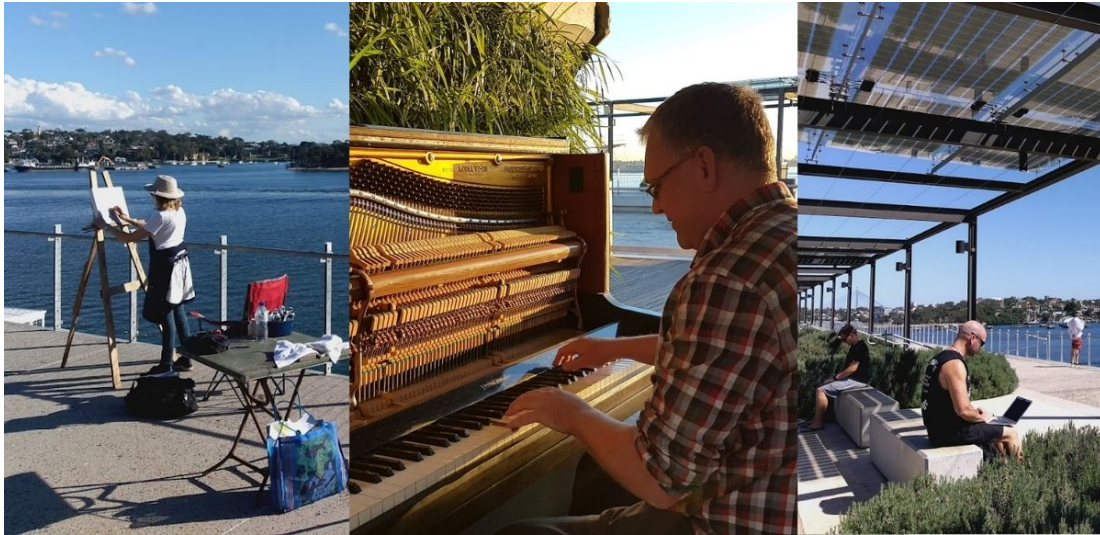
Popular self-timed activities during Covid: painting, the pop-up piano, the new outdoor office