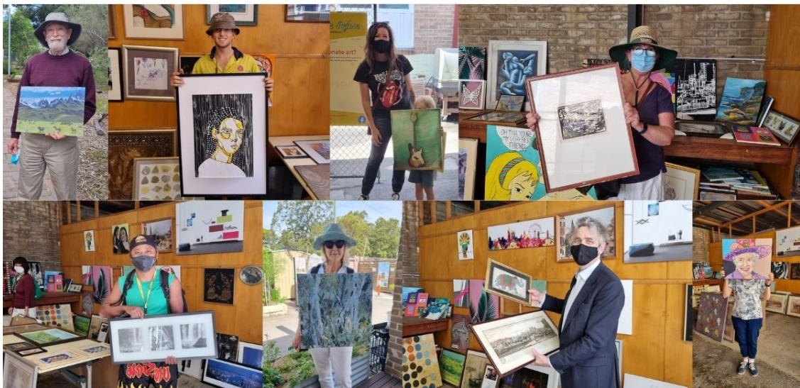
Salon de Refuse, 2021