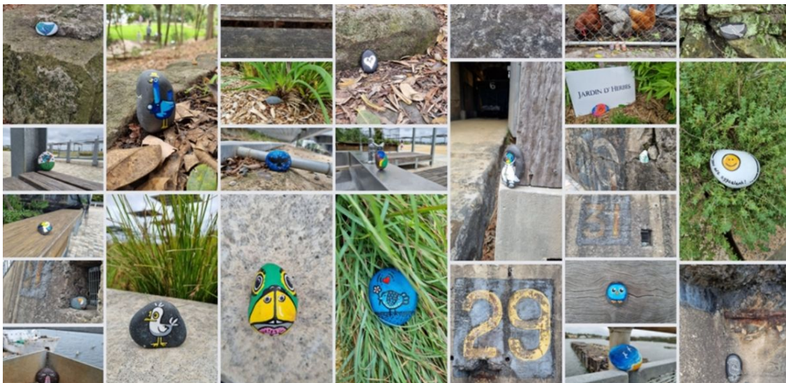
Lost Bird Found Mental Health Project, 2021. Rock drops shown from various artists.