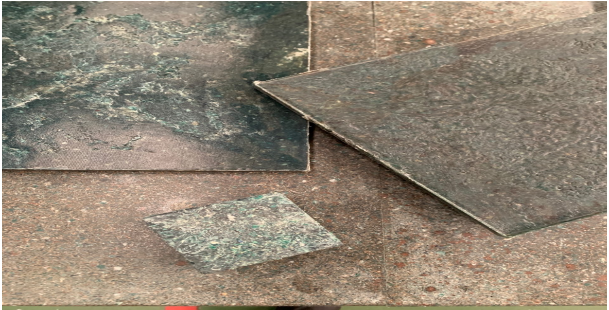
Floor tiles that are currently in commercial production. Made from 100% unwearable school uniforms.