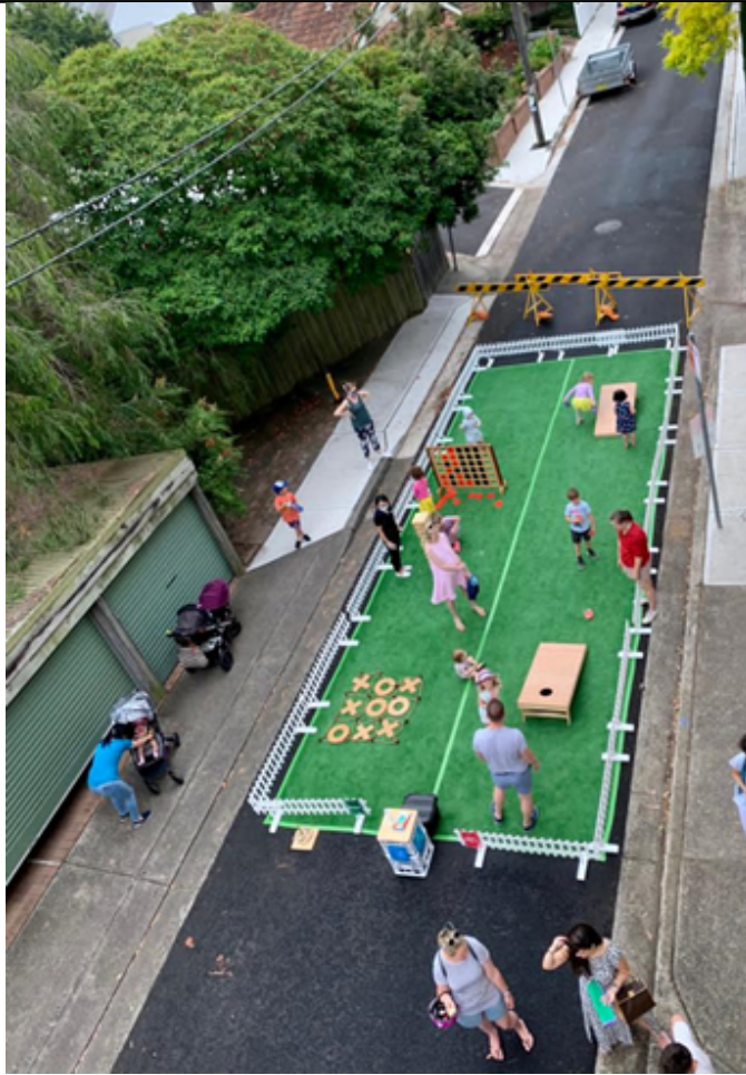
Image 1. Street Play on Burlington Street

Young Street Cycling, Walking and Streetscape Upgrades