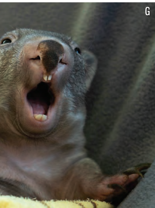
Captions: A. Fire damaged wombat enclosure. B-E. enlarged wombat compound rebuild works, 25 & 26 July 2020