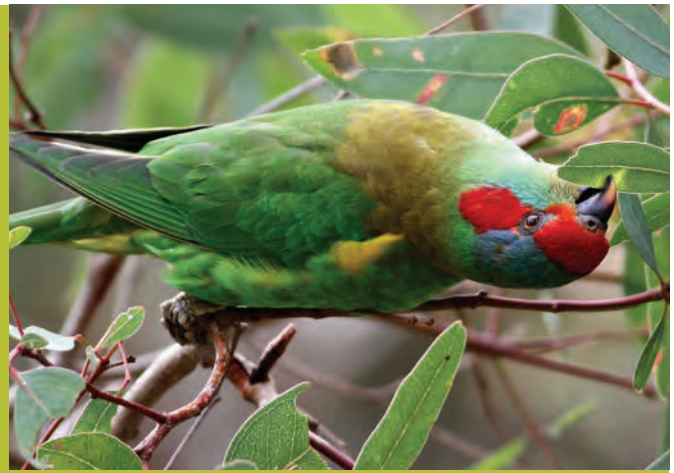
Caption: Musk Lorikeet at Belair Reserve by Vicki Stokes, courtesy of Birdlife Australia

Reserve, Primrose Park, Balls Head Reserve, Berry Island Reserve, Gore Cove Reserve)