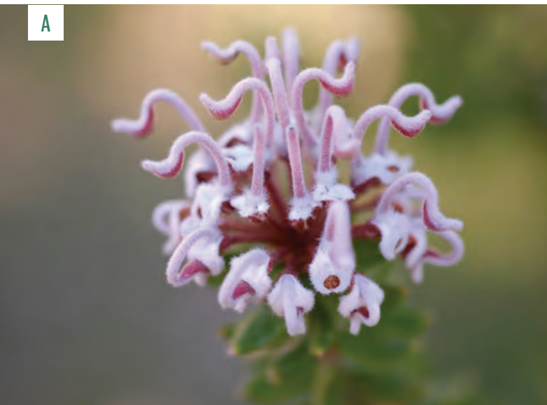
Caption: A. Grey Spider Flower Grevillea buxifolia B. White Spider Flower Grevillea linearifolia C. Red Spider Flower Grevillea speciosa D. Pink Spider Flower Grevillea sericea.