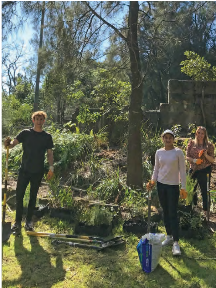
Caption: Tree Day Volunteers at the Coal Loader, 2 August 2020

Despite this being our smallest ever Tree Day, we managed to get 101 native plants in the ground with the aid of five enthusiastic participants and two Bushland staff. Physical distancing was easy