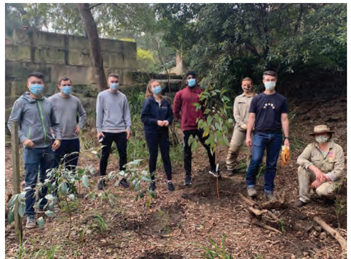
Caption: Salesforce Strategy Team Corporate Volunteers at the Coal Loader, 13 August 2020