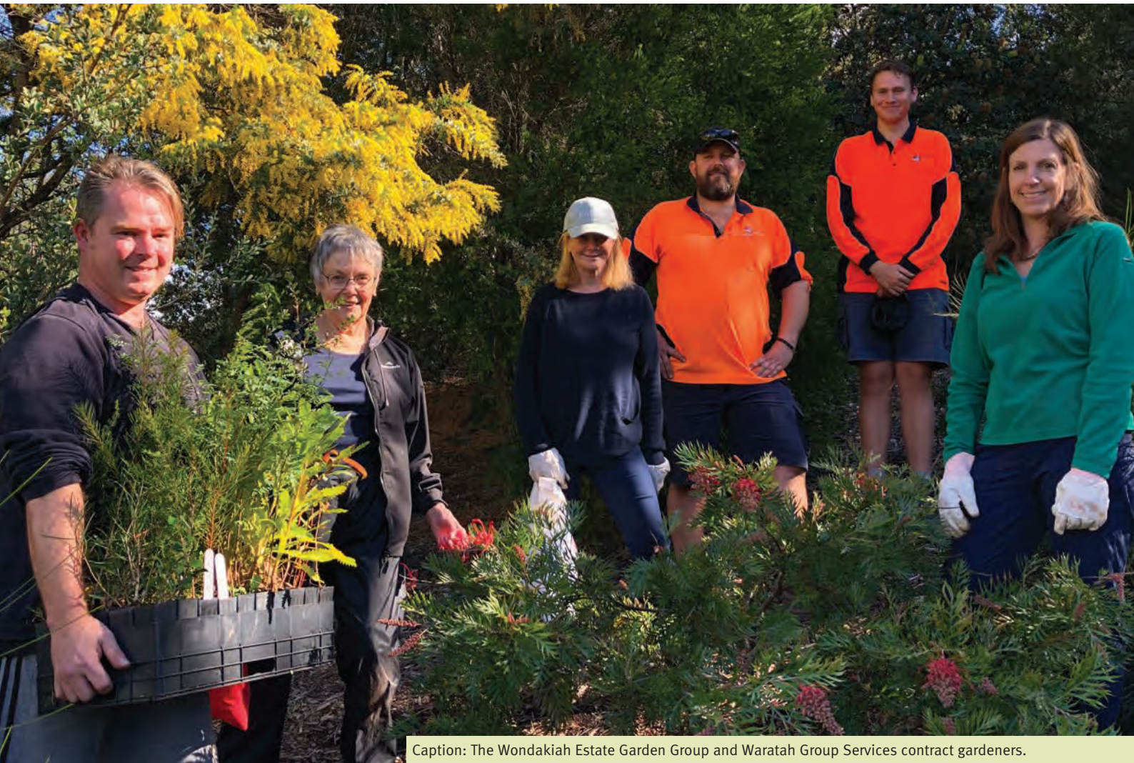
Caption: The Wondakiah Estate Garden Group and Waratah Group Services contract gardeners.

The Wondakiah Estate Gardening Group, with the assistance of Council's Native Havens Program, have been working to improve a large garden bed (about half a hectare in area) along the cutting at the end of Gas Works Road for the past 12 months.