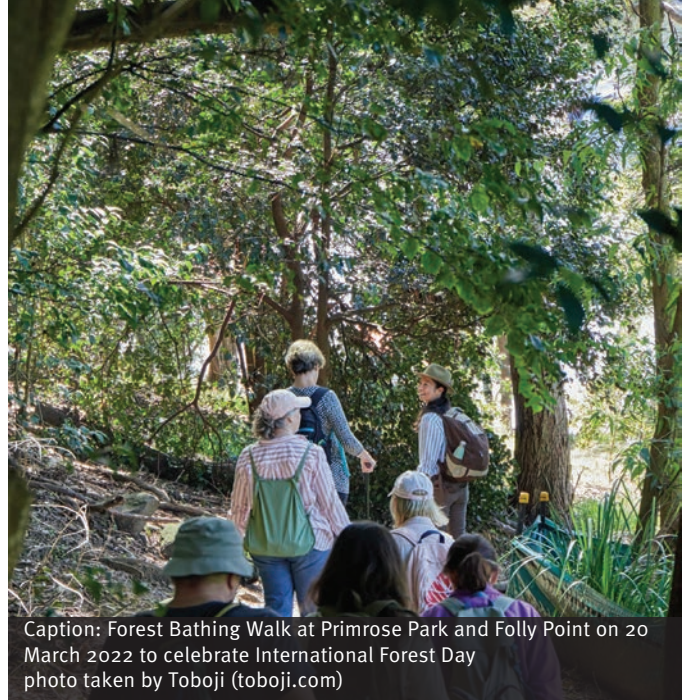
Caption: Forest Bathing Walk at Primrose Park and Folly Point on 20 March 2022 to celebrate International Forest Day

By David Bell – Tunks West Bushcare Group