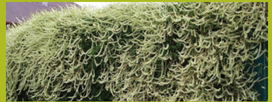
Caption: (above) Madeira Vine leaves at Primrose Park ; (top right) Madeira Vine tuber at Primrose Park ; (bottom right) Madeira Vine flower spikes