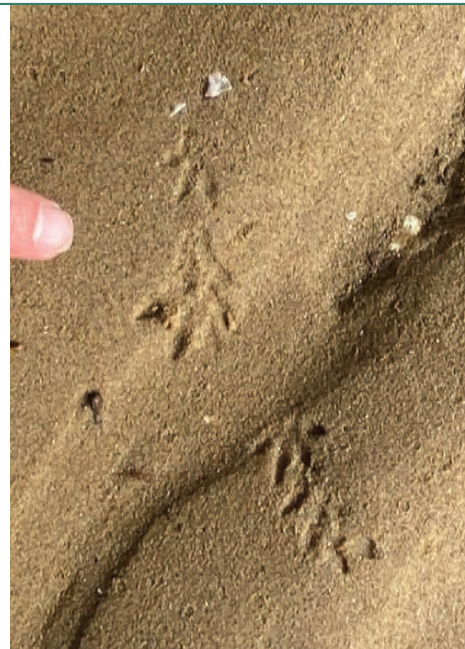
Caption: Left: Rakali ( Hydromys chrysogaster ) tracks observed on the western side of Berry Island, 21 February 2022.