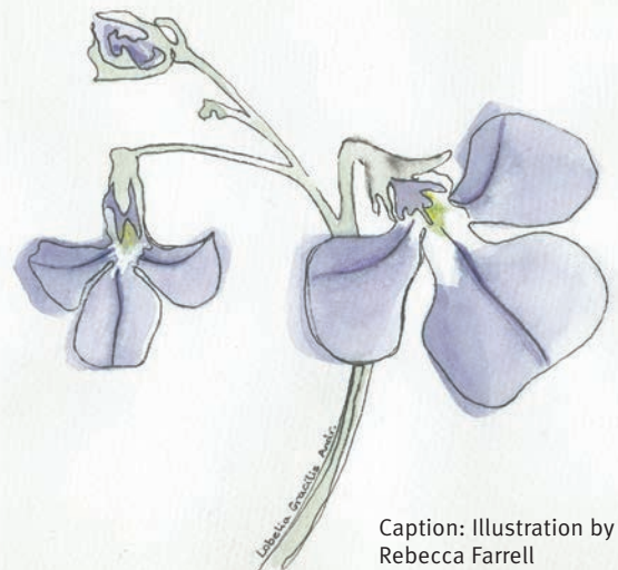
Caption