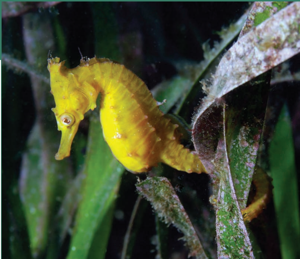
Caption: White's Seahorse in Posidonia australis seagrass habitat

With the resumption of volunteer activities, the Bushland Team are (tentatively) planning our return to Boorowa for the first time since 2019. This year's tree planting weekend will be held from 27 to 29 of May, Coordinators Report continued overleaf