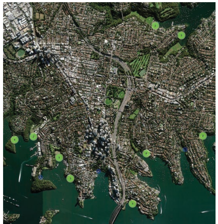
Below: Map of Rakali track records clustered together by area for North Sydney LGA hosted by ALA BioCollect.