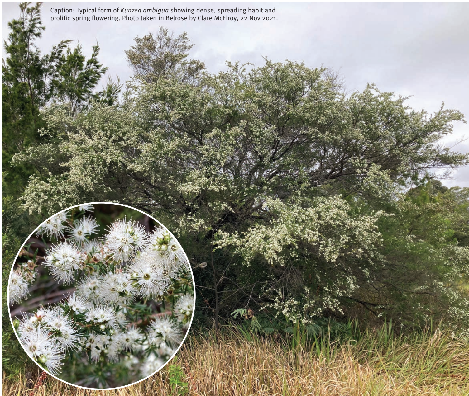
Caption: Typical form of Kunzea ambigua showing dense, spreading habit and prolific spring flowering. Photo taken in Belrose by Clare McElroy, 22 Nov 2021.

Clare McElroy Bushcare Nursery Supervisor