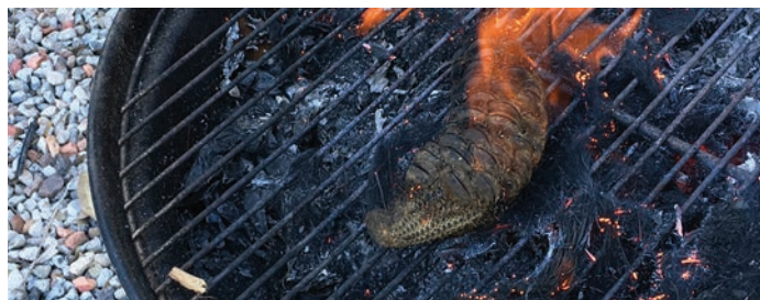
Caption: Barbequing Banksia ericifolia cones at the Bushcare Nursery by C. McElroy, April 2021.