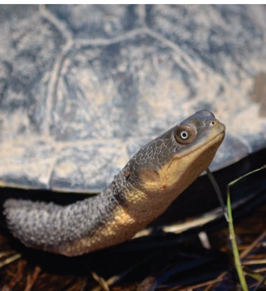
Caption: Eastern Long-necked Turtle by Karen H Black (native)

To report a sighting of these species, or if you would like more information, please visit www.feralscan.org.au/newpests/ or email feralscan@feralscan.org.au