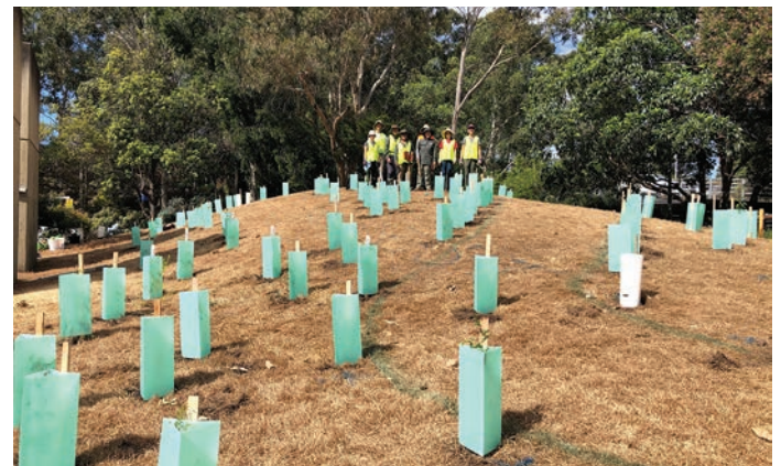
Caption: Plantings with tree guards in the ‘Helicopter Hill’ garden bed opposite the main entrance to Westmead Hospital, Wednesday 14 April.

A big thanks to our hosts at GSLN - Suzie, Matt, and Elisha - we look forward to participating in further Greening Our City Projects.