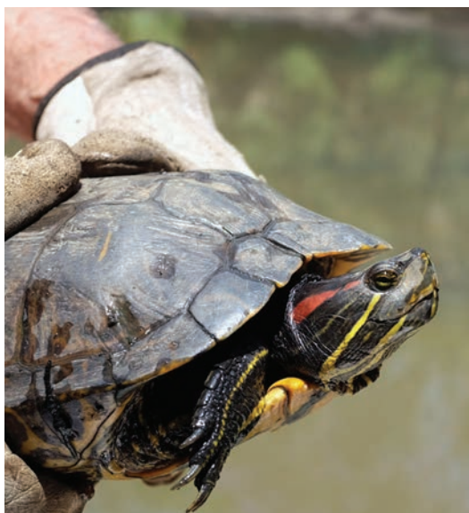
Caption: Red-eared Slider Turtle by David Mercer