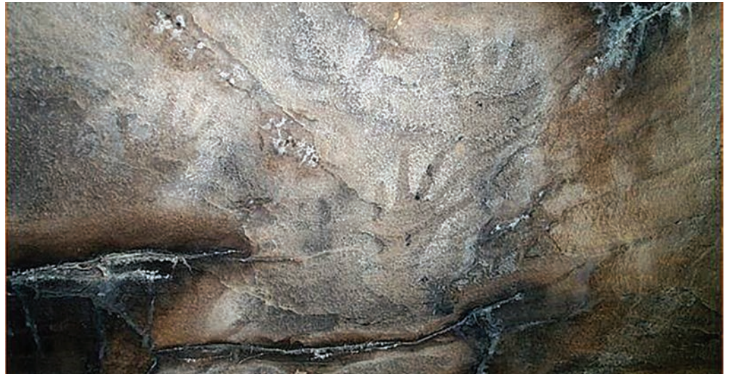
Caption: Right. Aboriginal Hand Stencil, Northern Beaches Council LGA.