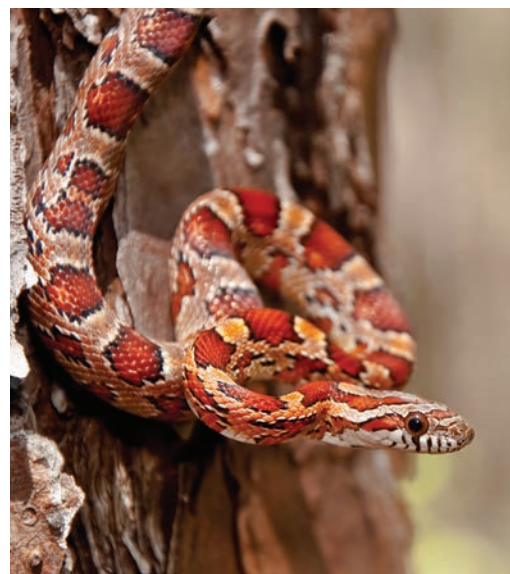
Caption: Corn Snake by Jay Ondreicka