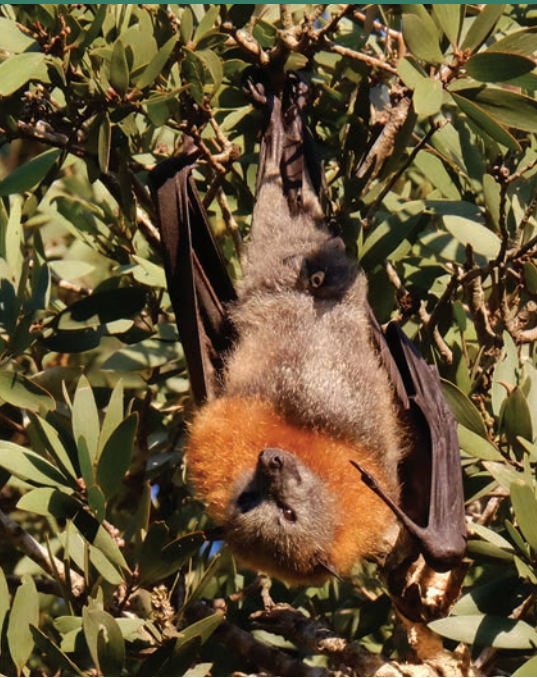
Caption: Grey-headed Fly-fox at Lachlan swamp in Centennial Park, 27 March