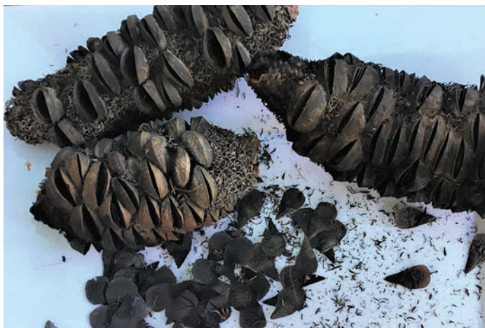
Caption: Seed released from toasted Banksia ericifolia cones by C. McElroy, April 2021.

Next time we might bring some marshmallows to go with our toasted banksias.