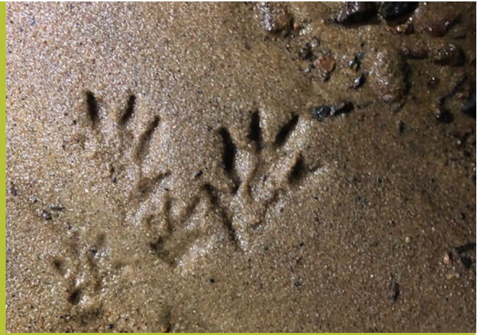
Caption: Rakali tracks, Badangi Reserve, Wollstonecraft, 27 April 2021.