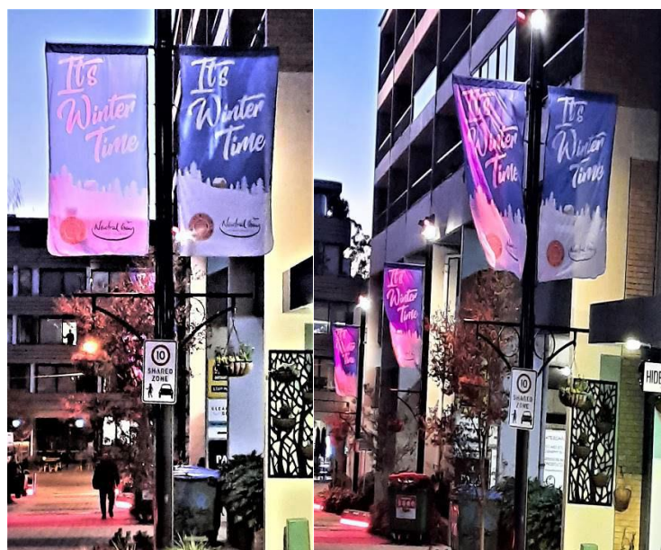
Shop local banners will be installed in the next few weeks.

Council will look into why they are the shorter banners.