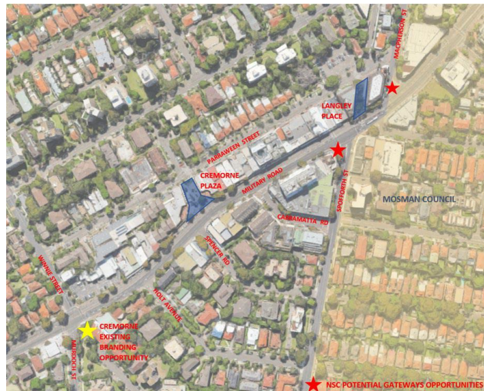
Project Locality Plan

Additionally, Council is currently trialling 30 minutes parking in Parraween Street. As far as the parking meters as a general help indicator, Council still has 2017/18 street parking utilisation levels across the whole LGA, this indicates there isn't as many people returning to the village centres as well as the North Sydney Centre as a lot more people are working from home this being a permanent change in the culture. Council are looking at the parking meters as to what we were doing in 2017/18, and it seems we have gone back five years. Parking meters are a good indicator to measure people coming in the area to our village centres and North Sydney CBD.