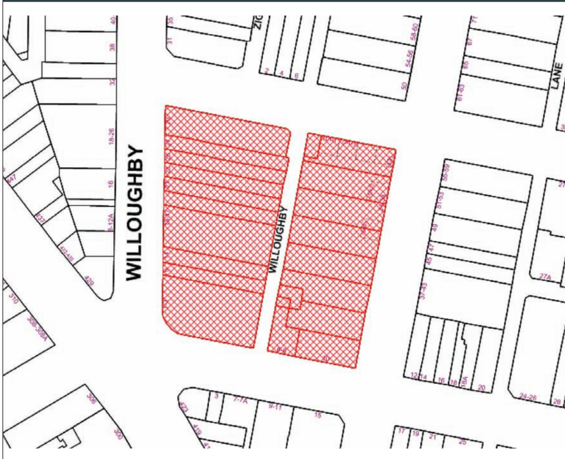
Figure 10 – Location Proposed Rezoning in Crows Nest

Despite these losses, the remaining planned residential capacity in St Leonards and Crows Nest is estimated at 1,453 additional dwellings.