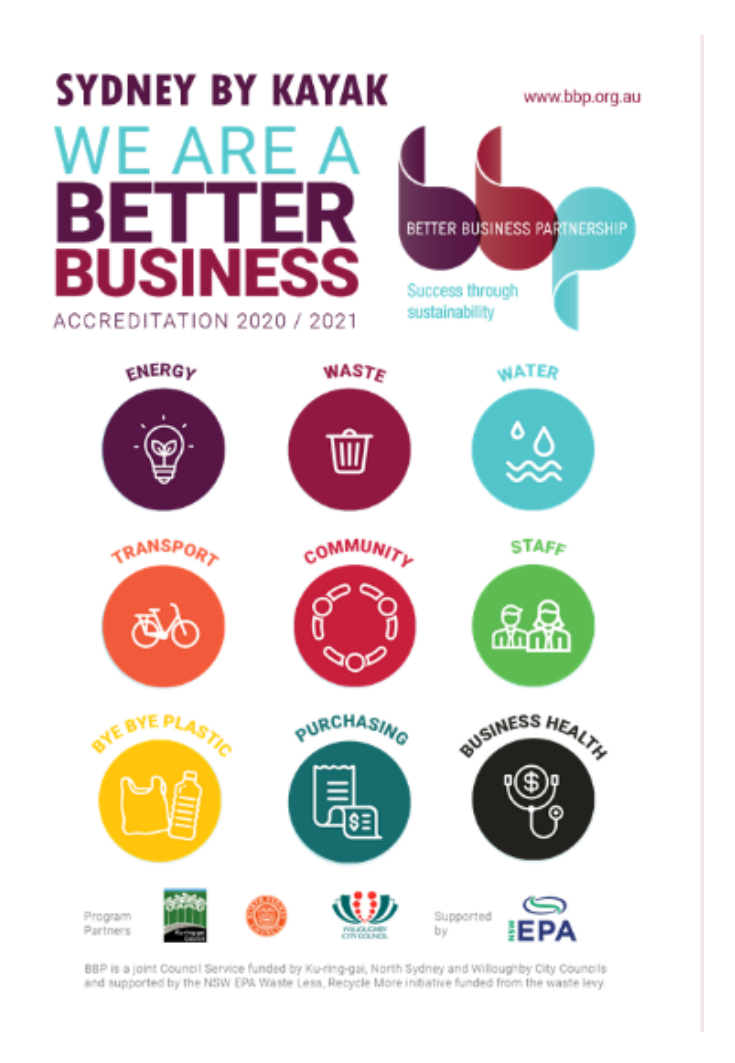
Figure 3. Better Business Partnership Certificate

Out of the 156 accredited active businesses within the three partner Councils, North Sydney currently has 54 accredited businesses, Willoughby City Council has 46 accredited businesses and Ku-ring-gai Council has 56 accredited businesses.