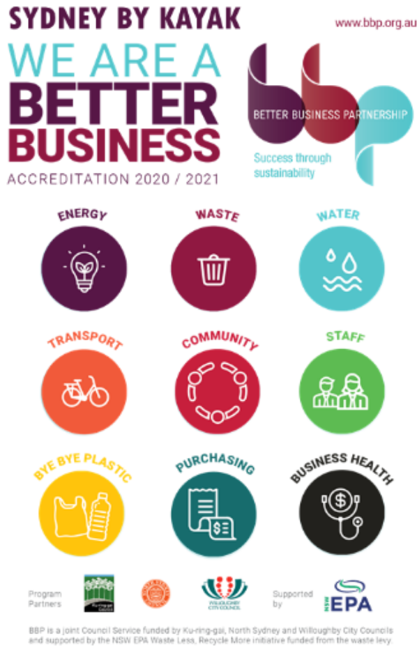
Figure 3. Better Business Partnership Certificate

Out of the 156 accredited active businesses within the three partner Councils, North Sydney currently has 54 accredited businesses, Willoughby City Council has 46 accredited businesses and Ku-ring-gai Council has 56 accredited businesses.