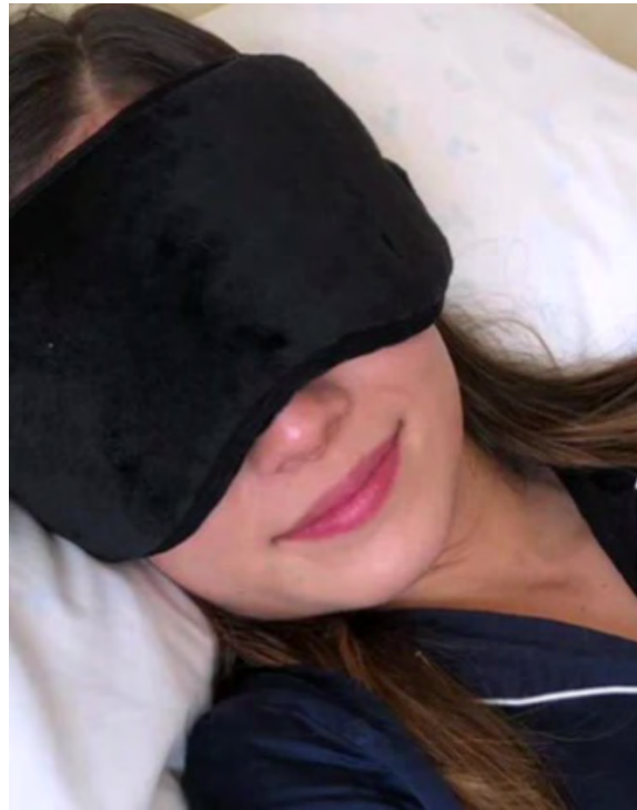
Audio sleep mask