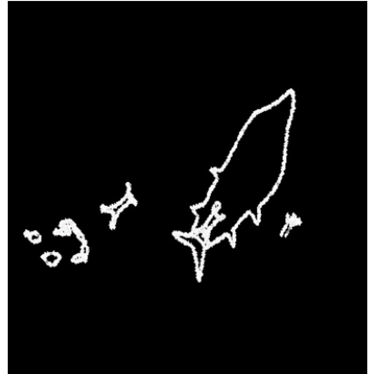
Cammeraygal rock engraving at Balls Head. Atlas Obscura, Stanbury & Clegg p.22 & Campbell Plate IV, Fig