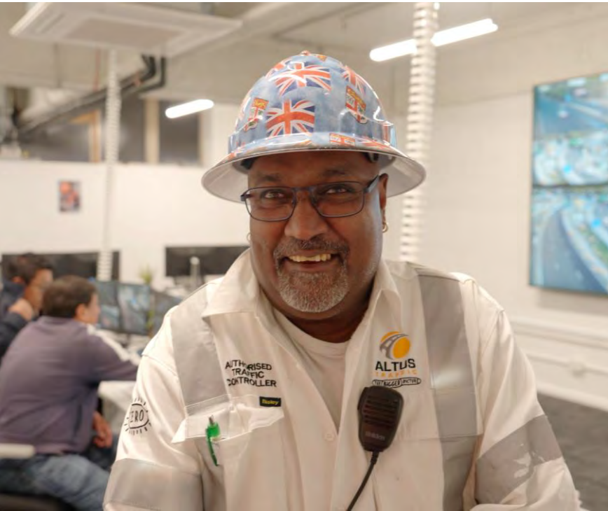
Frederick Street, St Leonards project office