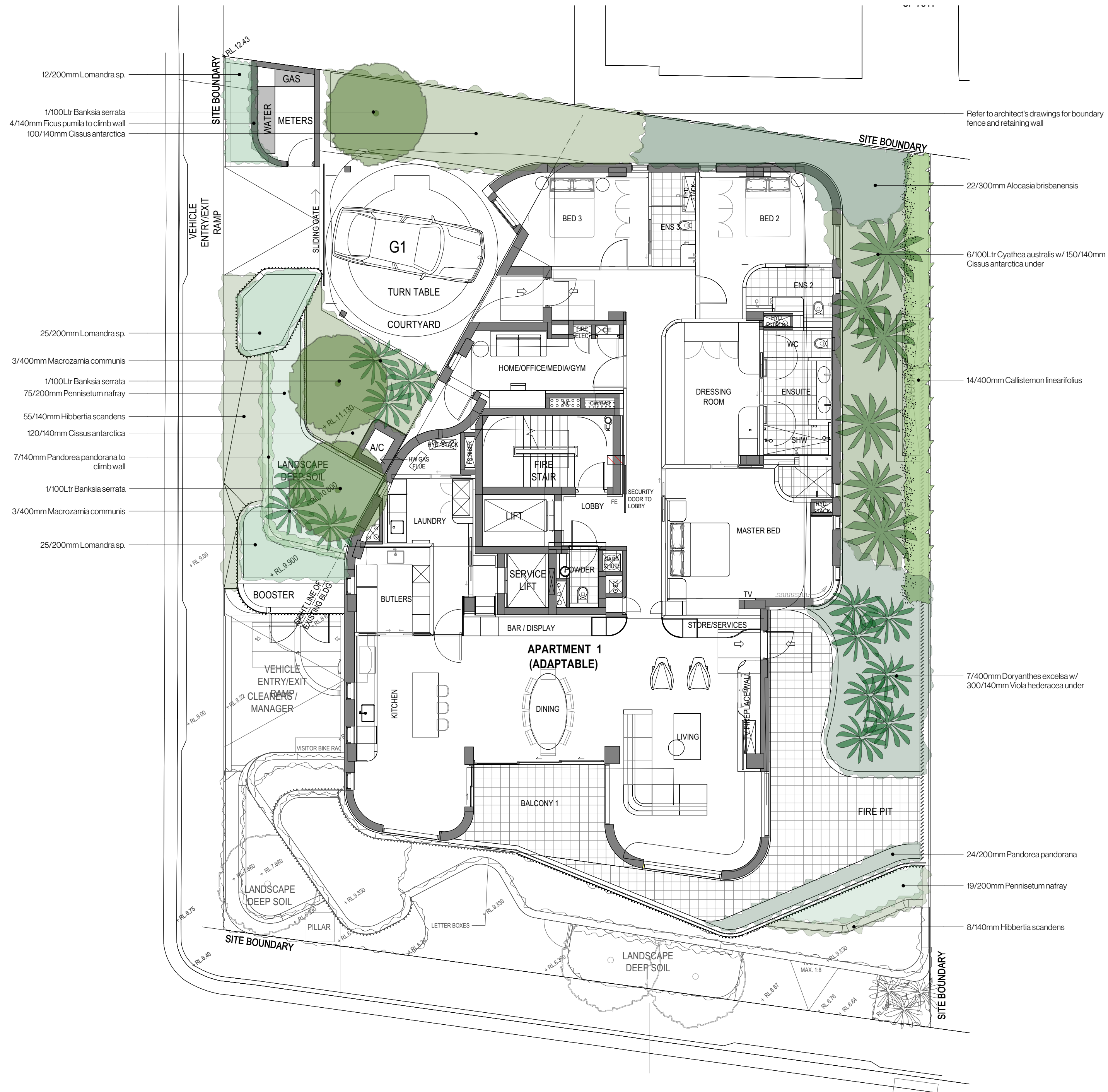
Level 1 Landscape Plan

Figure dimensions shall take precedence over scale. Contractors must verify all dimensions on job before commencing any work or making shop drawings. This drawing is protected by copyright.