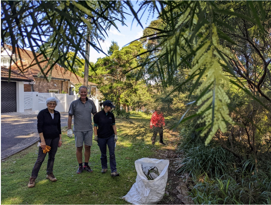
Balfour St, Wollstonecraft - Native plants are used to attract wildlife and the working bees give opportunities for residents to come together.