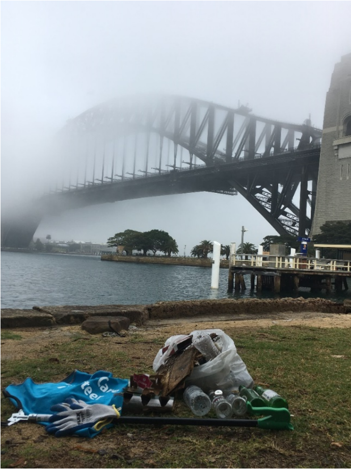
A morning collection from a Harbour Care volunteer.