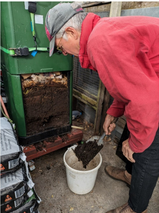
Community Garden volunteers harvest compost, converting organic waste into nutrient-rich soil which is used on the gardens.