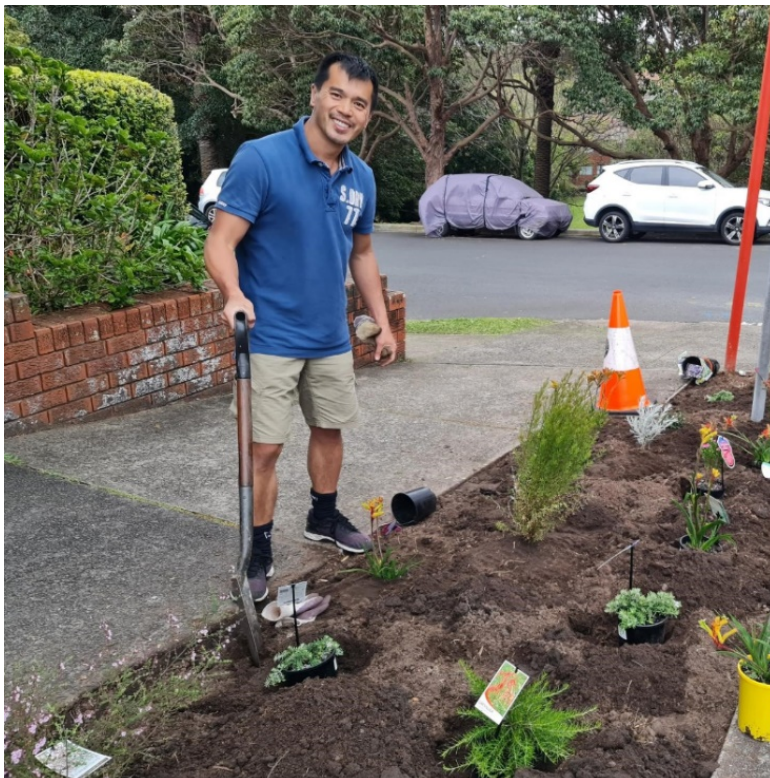
Carr St, Waverton