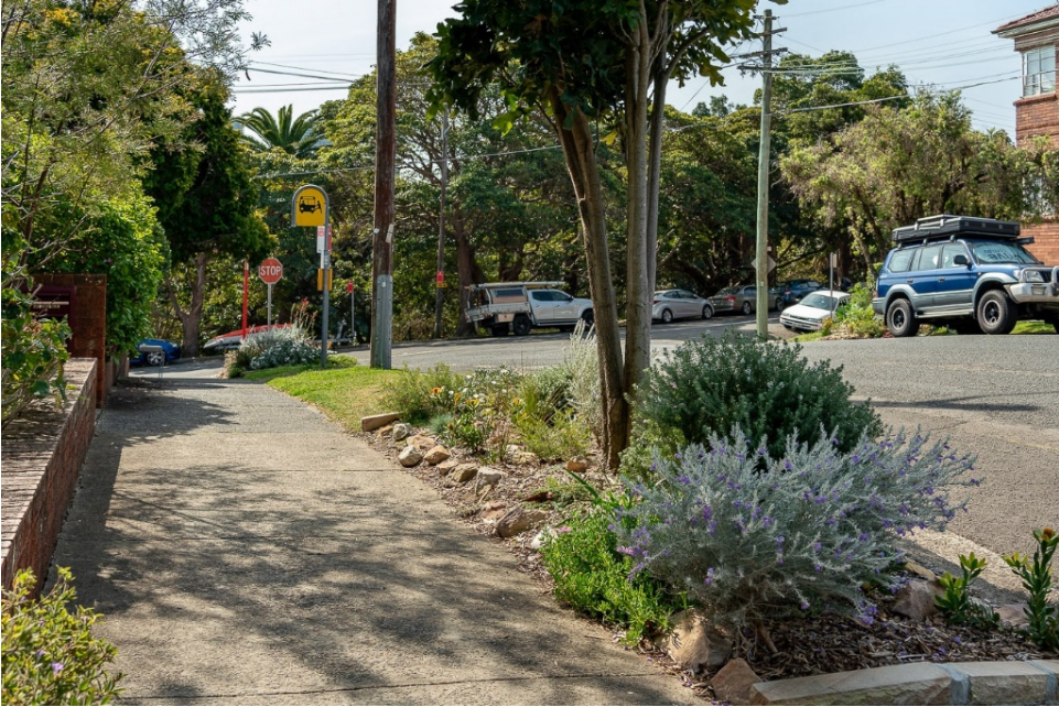
Carr St, Waverton - Volunteers have transformed Carr St into a vibrant native greenspace.