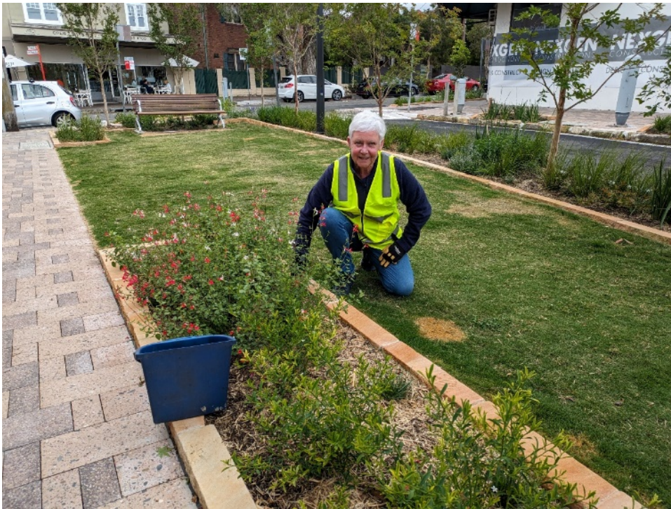
East Crescent St, McMahons Point

Recently, Streets Alive worked in conjunction with Council's engineers on the installation of a new pocket park in East Crescent St, McMahons Point. The new green space improves the streetscape whilst providing residents the opportunity to garden and meet other neighbours.