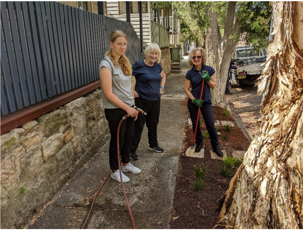
Euroka St, Waverton - Residents plant out a disused grass verge.