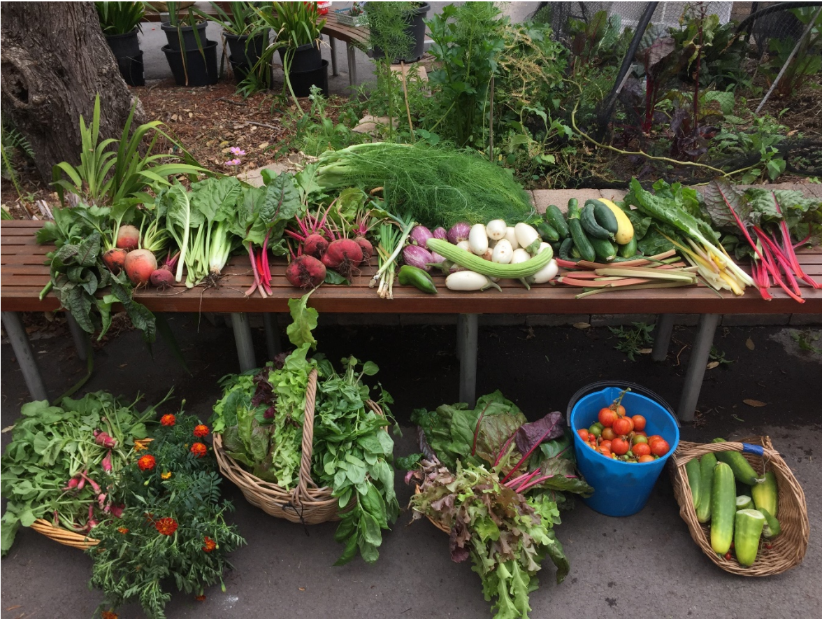
Coal Loader Cottage Community Garden – harvest which is distributed among the volunteers.