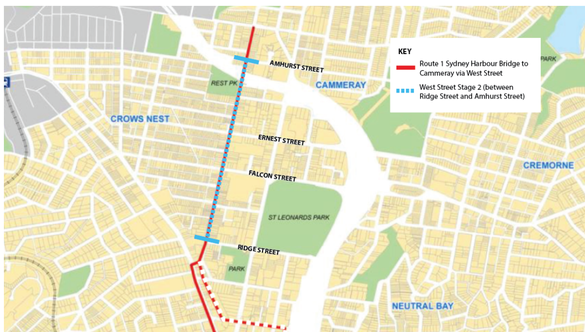
Image 1. Context map West Street Cycling, Walking and Streetscape Upgrades Stage 2

The West Street Cycleway is a part of a key cycling connection identified in both Council and State strategies.