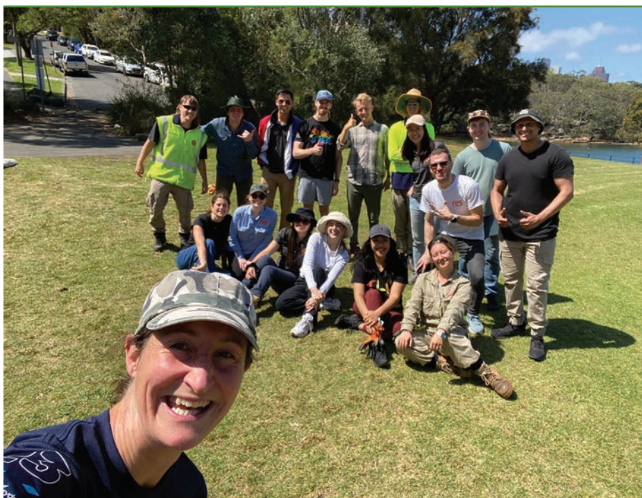
Caption: Selfie of the RES – Global Renewable Energy Solutions Team with the Bushland Team at Berry Island Reserve, 10 October 2023

The Bushland Team welcomes corporate groups throughout the year to help with jobs in North Sydney bushland and to educate the community about our local environment.