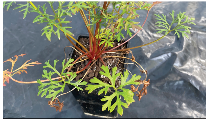
Caption: Native Parsnip basal leaves by Andrew Scott, 11 November 2020