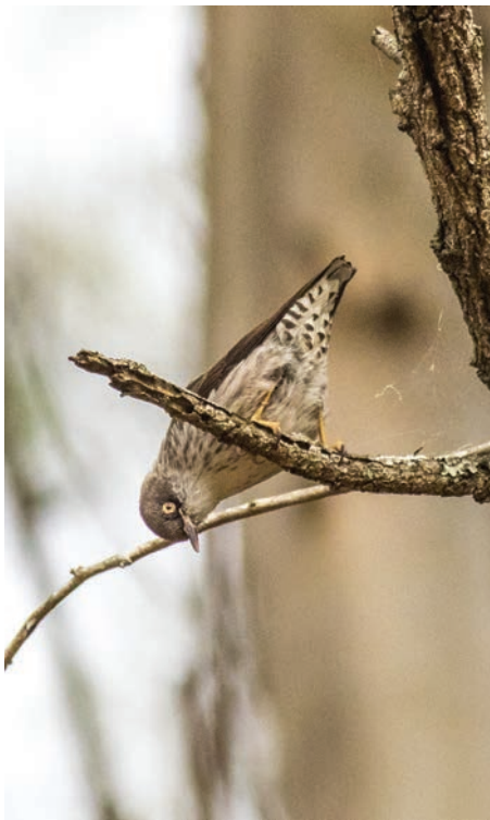
Caption: Varied Sittella ( Daphoenositta chrysoptera) at Scheyville National Park, 28 October 2023