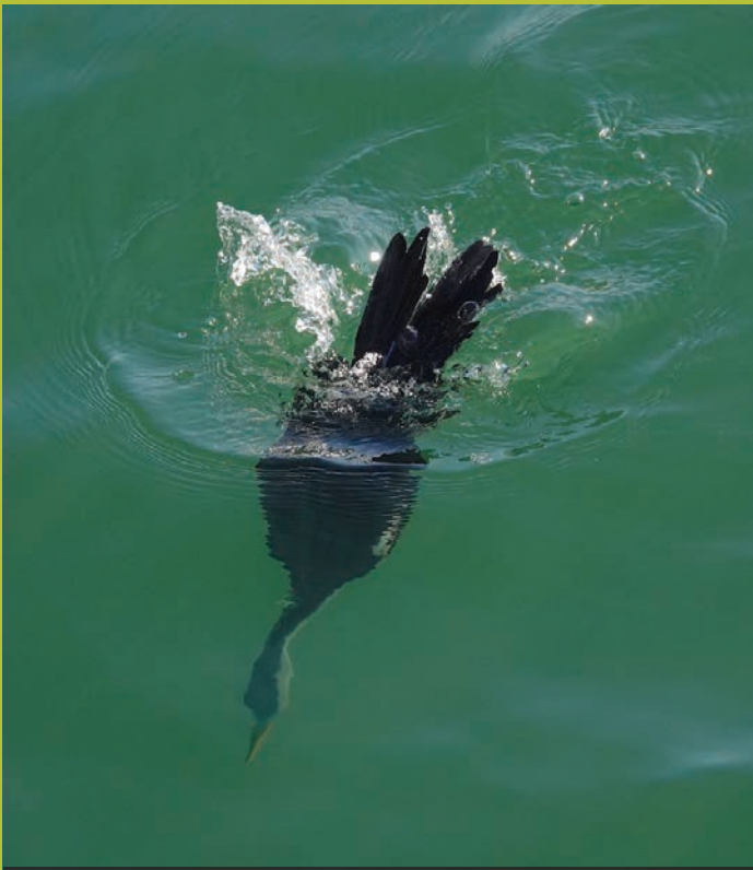
Caption: Pied Cormorant

Spring was in the air! Insects abounded, pollinating plants and providing a food source for many birds (including Noisy Miners, several of whom had hungry mouths to feed)! The sighting of a Powerful Owl chick sheltering from day birds in dense understorey, under the watchful eyes of its parents and the sounds of Channel-billed Cuckoos calling while being chased by Noisy Miners were all part of this year's spring happenings. Unfortunately, several Ringtail Possums were found hit/squashed on the roads and a heron entangled in fishing line – a reminder to keep an eye out for diving birds when fishing and ensure any loose material is not left on the foreshore. Wildlife rescue organisations can also be contacted 24 hours a day when in need.