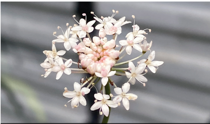
Caption: Native Parsnip inflorescence

Trachymene incisa occurs along the NSW coast, northern tablelands, western plains and Queensland, preferring sandy soils and rock crevices in sheltered forest and woodland. Although not common in Sydney, North Sydney is fortunate to have a remnant Trachymene incisa population.