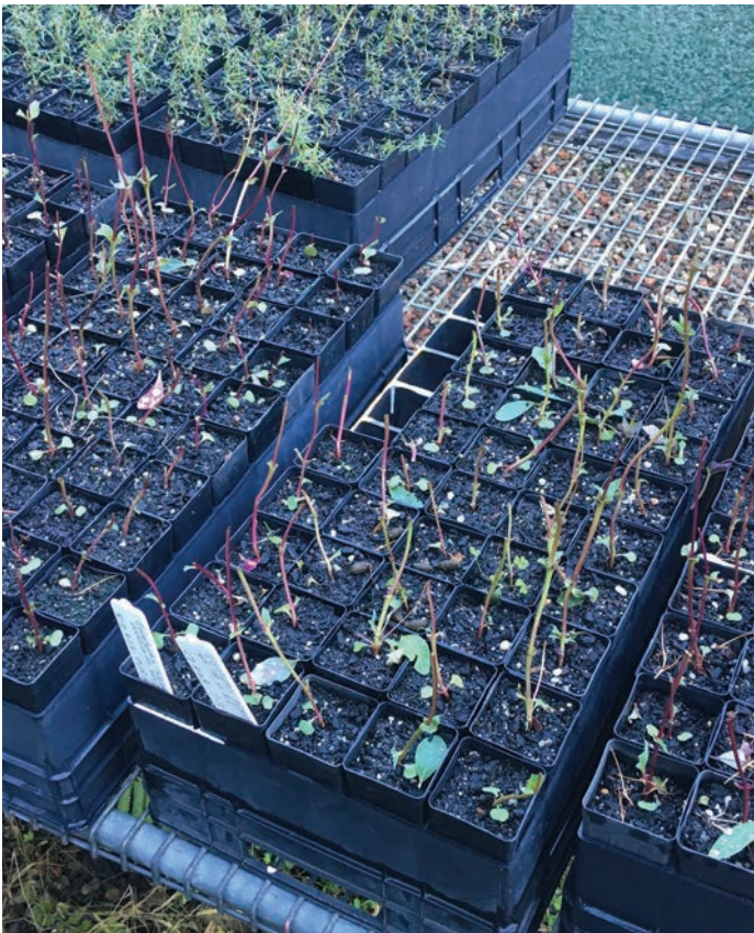
Caption: Half-eaten trays of eucalypt seedlings after the hungry possum's visit