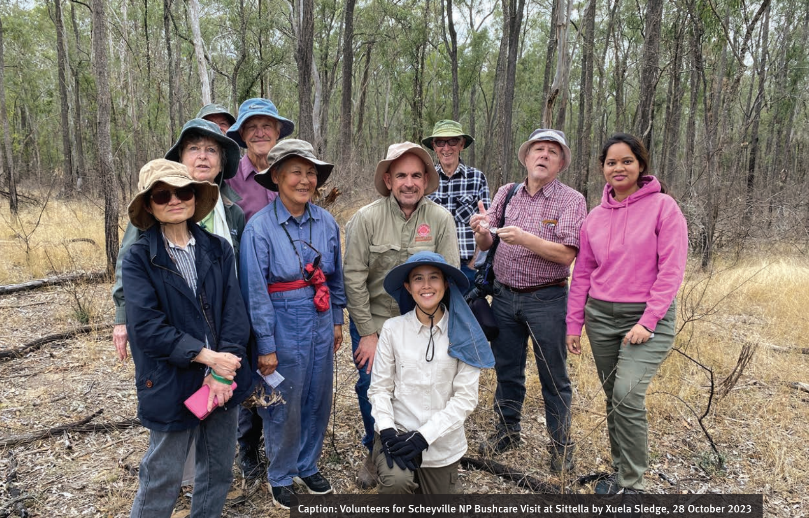
Caption: Volunteers for Scheyville NP Bushcare Visit at Sittella by Xuela Sledge, 28 October 2023