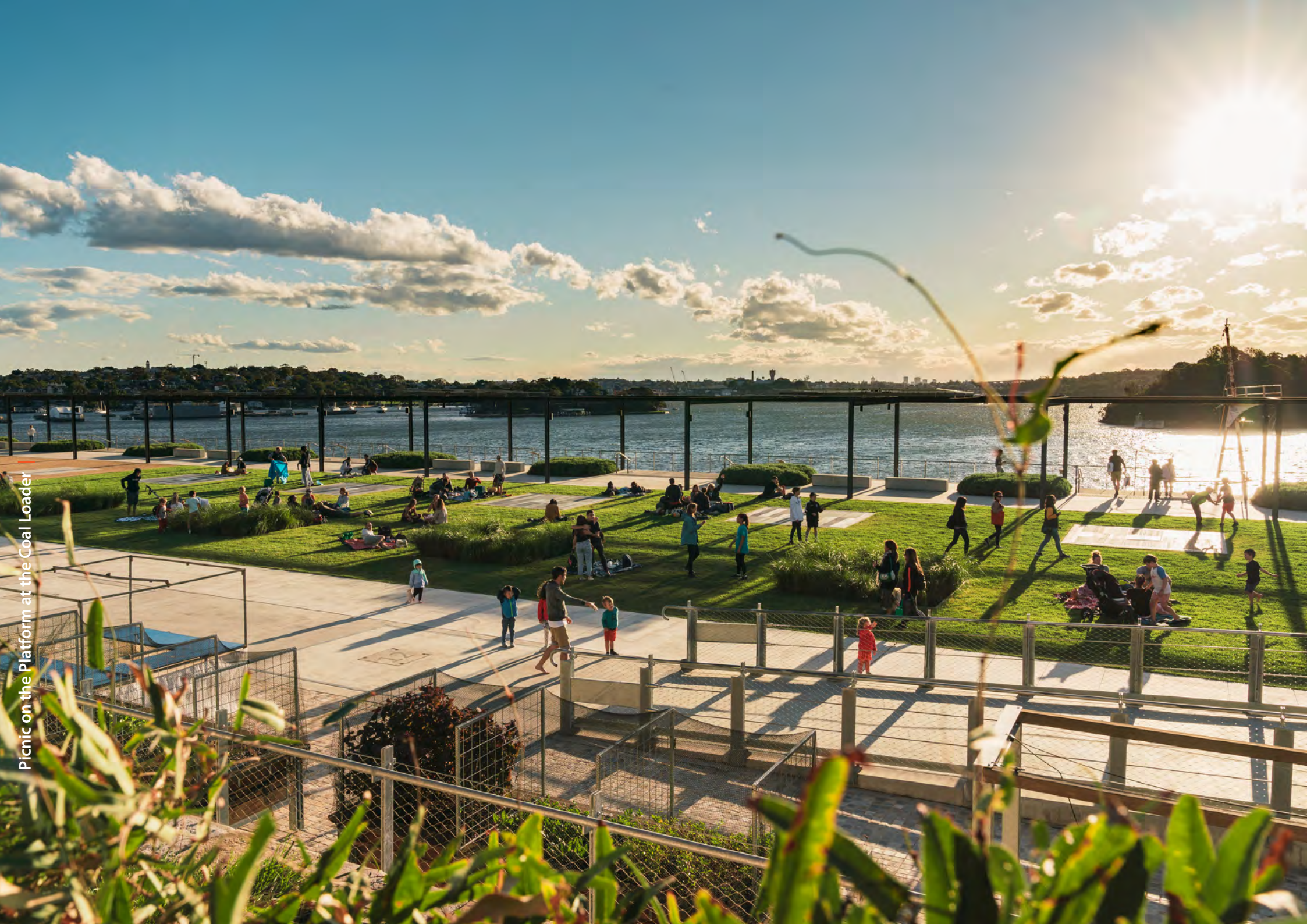
Picnic on the Platform at the Coal Loader