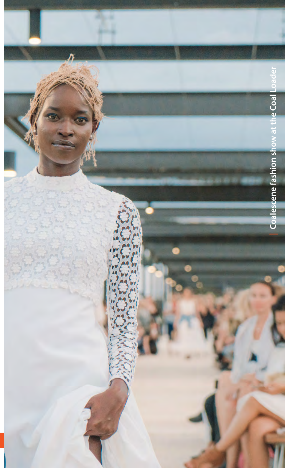
Coalescence fashion show at the Coal Loader