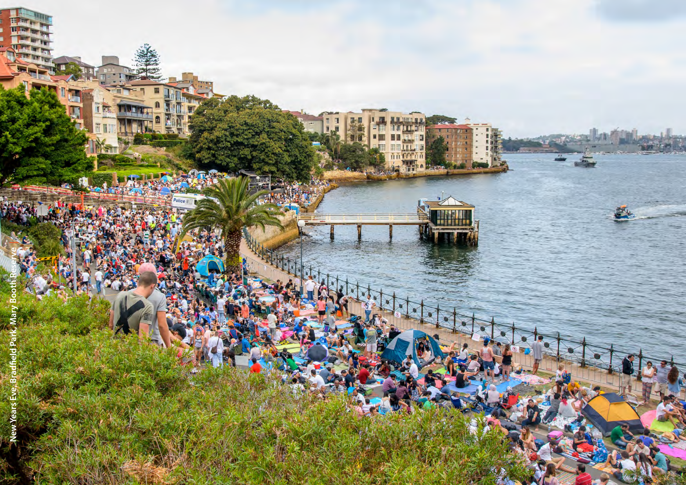
New Years Eve, Bradfield Park, Mary Booth Reserve