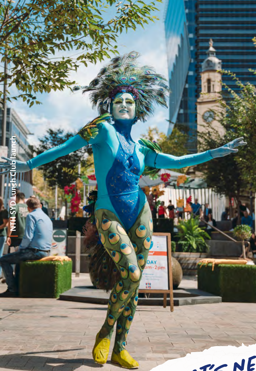
NTH SYD Lunch Club launch

WHAT'S NEW ● A FOCUS ON TOURISM ● ADVOCACY FOR THE SYDNEY HARBOUR HIGH LINE PROJECT