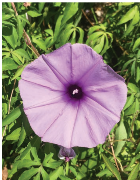
Caption: Coastal Morning Glory ( Ipomoea cairica) Willoughby Falls Primrose Park