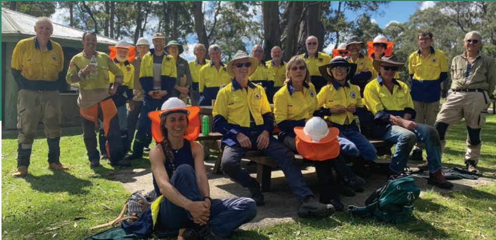
Caption: Volunteers for Barrington Tops Scotch Broom Control at Polblue Campground by Andrew Scott, 24 February 2024