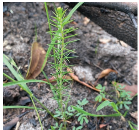
Caption: Above - Photo of Prickly Moses ( Acacia ulicifolia ) seedling geminating postburn at Brightmore Reserve.