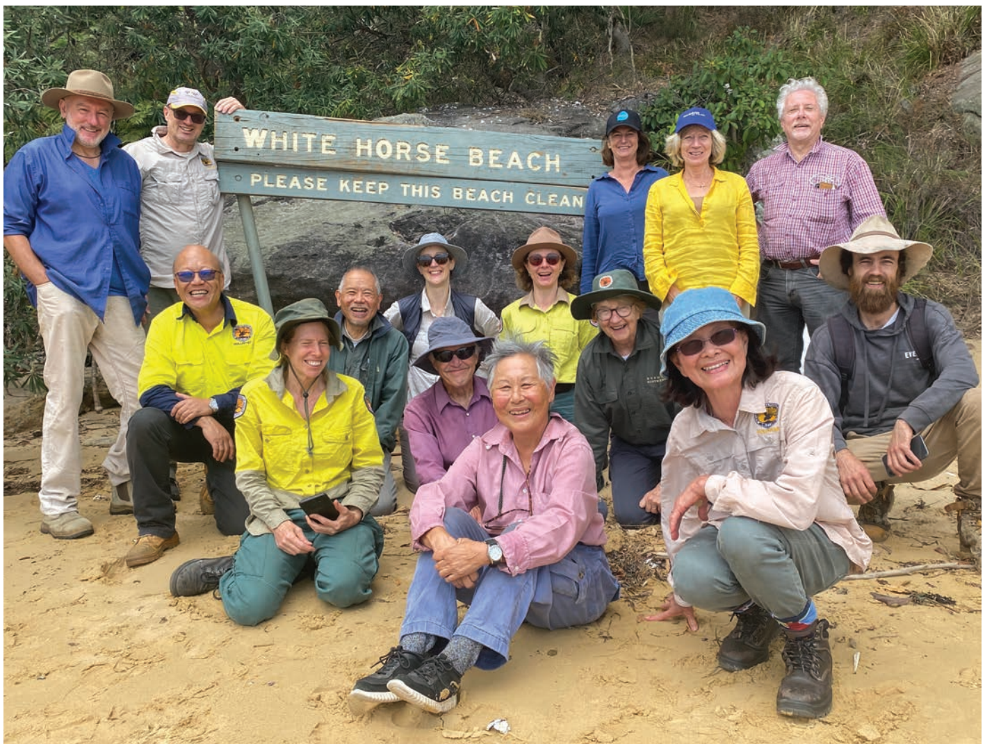
Caption: Floating Landcare Volunteers at White Horse Beach - Sunday 12 November 2023.

North Sydney Council Bushcare will visit Hungry Beach next on 1 December 2024 (date change from the Bushcare calendar), contact the Bushcare Officer on 9936 8258 for further information.