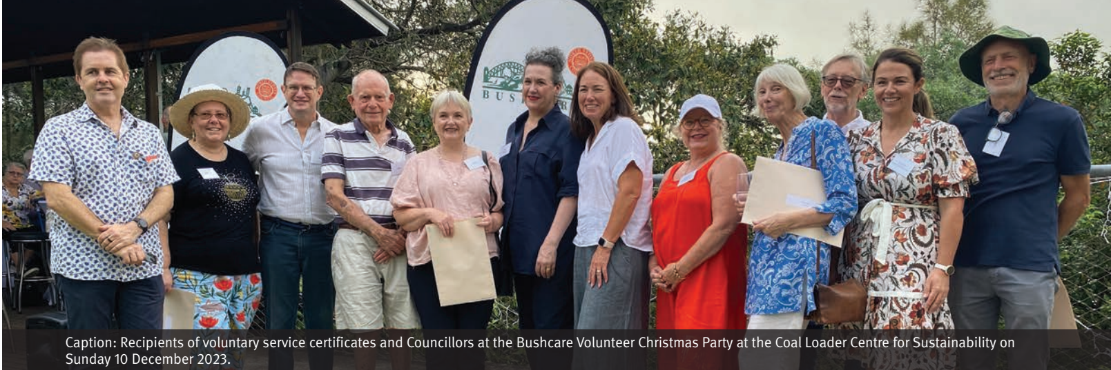
Caption: Recipients of voluntary service certificates and Councillors at the Bushcare Volunteer Christmas Party at the Coal Loader Centre for Sustainability on Sunday 10 December 2023.