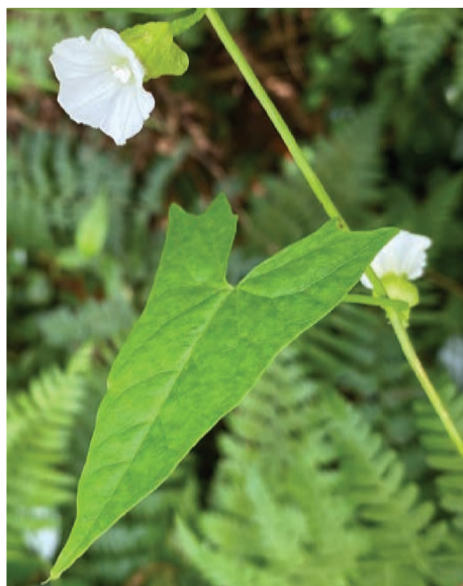
Caption: Photo of Native Bindweed ( Calystegia sepium ) at Primrose Park Bushcare site, 19 February 2023.

Name: Blue Morning Glory ( Ipomoea Indica )