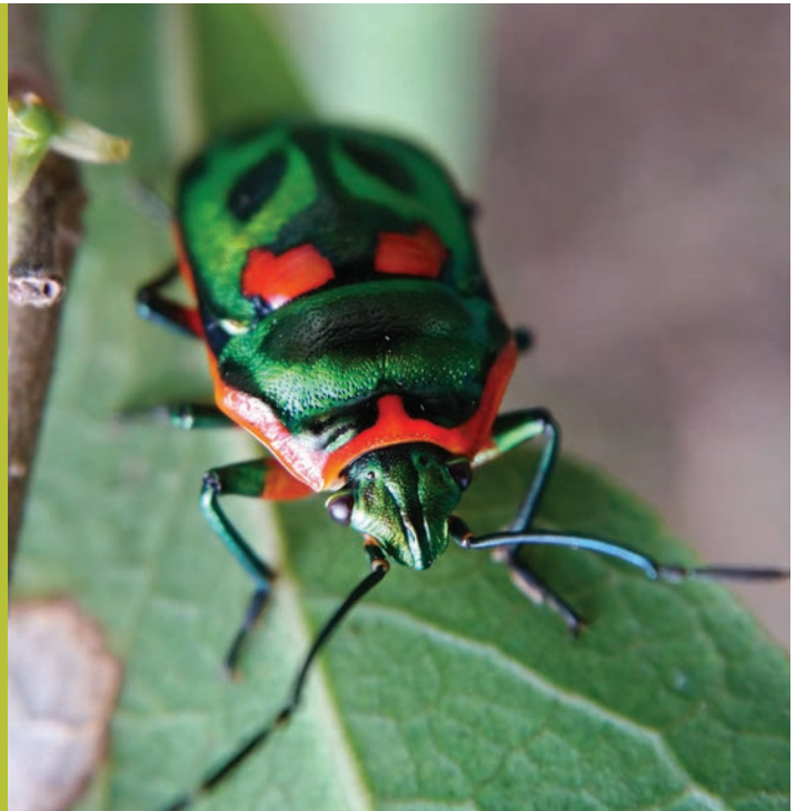
Caption: Metallic Shield Bug ( Scutiphora pedicellata ) by Anne Pickles, 10 December 2023.

Your sightings help to build up a picture of what wildlife is in the area and how they are living. Why not go exploring and see what you can find and add to next season's sightings! We are starting a Wildlife Watch walking group soon – let us know if you are interested (details below) and keep your eyes peeled on Council's event page.