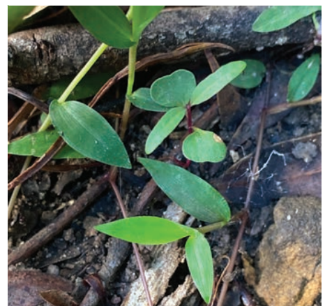
Below - Photo of Blackbutt ( Eucalyptus pilularis ) seedling geminating postburn and encroaching Basket Grass ( Oplismenus imbecillis ) both from Brightmore Reserve, 1 January 2024 by Tom Windon.