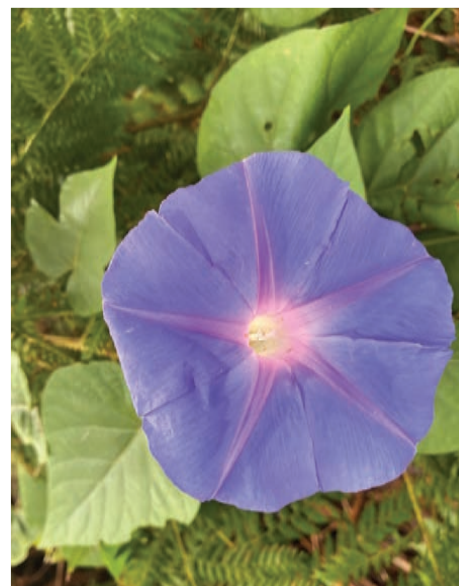
Caption: Morning Glory ( Ipomoea indica ) at Folly Point by Andrew Scott, 7 February 2024.

Native to South America but now found throughout tropical and subtropical coastal regions of the world.