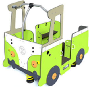
balancing / rocking Age group: 2+

Civilscape Pty Ltd , North Sydney Council's contractor, will soon commence the upgrade works of Merrett Playground at Woolcott St, Waverton. This project will involve refurbishing the existing slide play structure and adding a new slide and interactive play panels. The upgrade also includes the demolition of selected existing equipment, the installation of new play equipment, improved access with new footpaths, edging, sandstone boulders, and other natural elements, as well as organic and rubber safety under-surfacing and new park furniture.