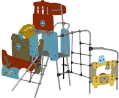
Handling, visual stimulation, tactile stimulation, role play, climbing / Age group: 2+