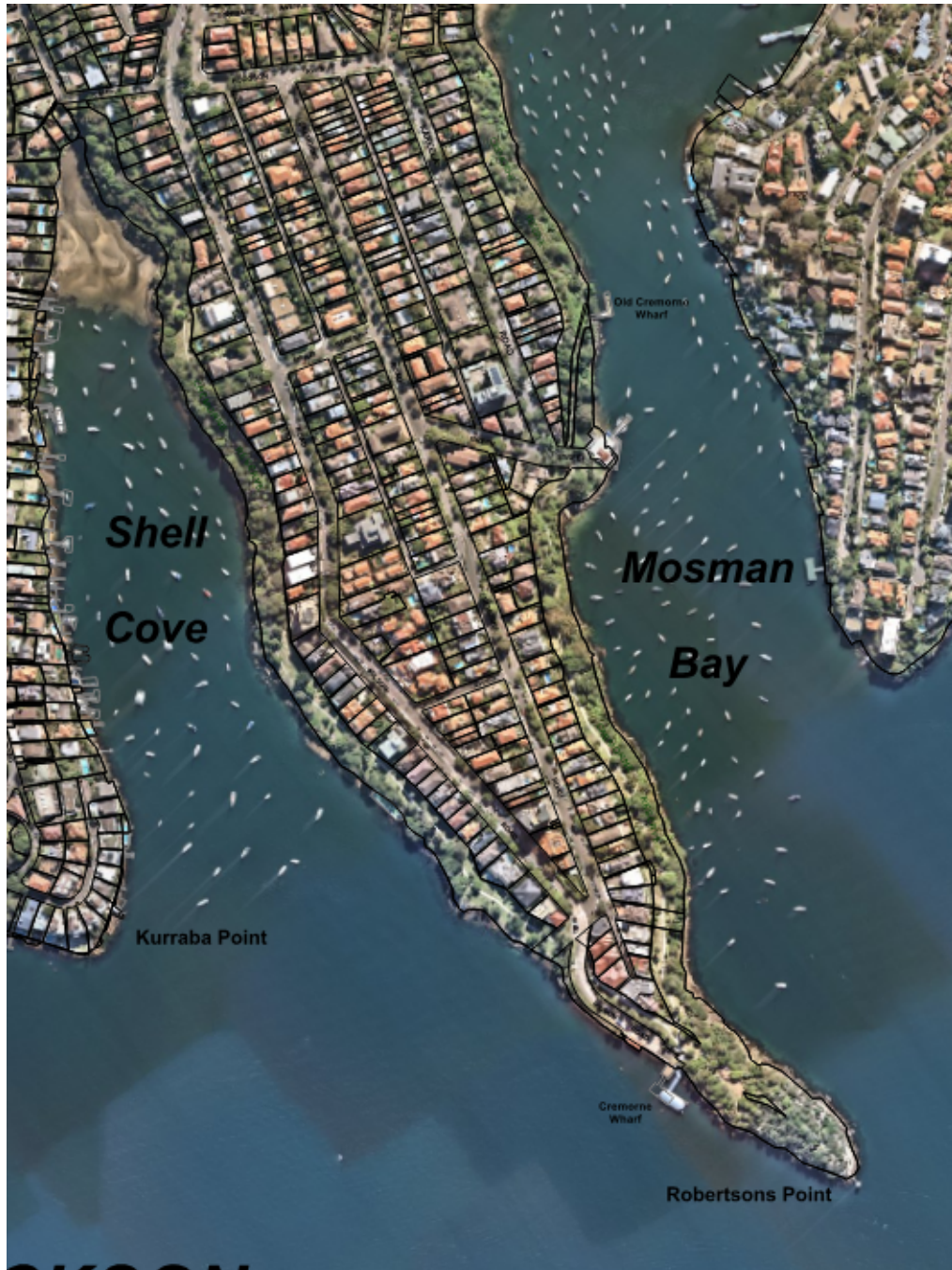
Map 1 – Aerial Photograph of Cremorne Reserve 2020