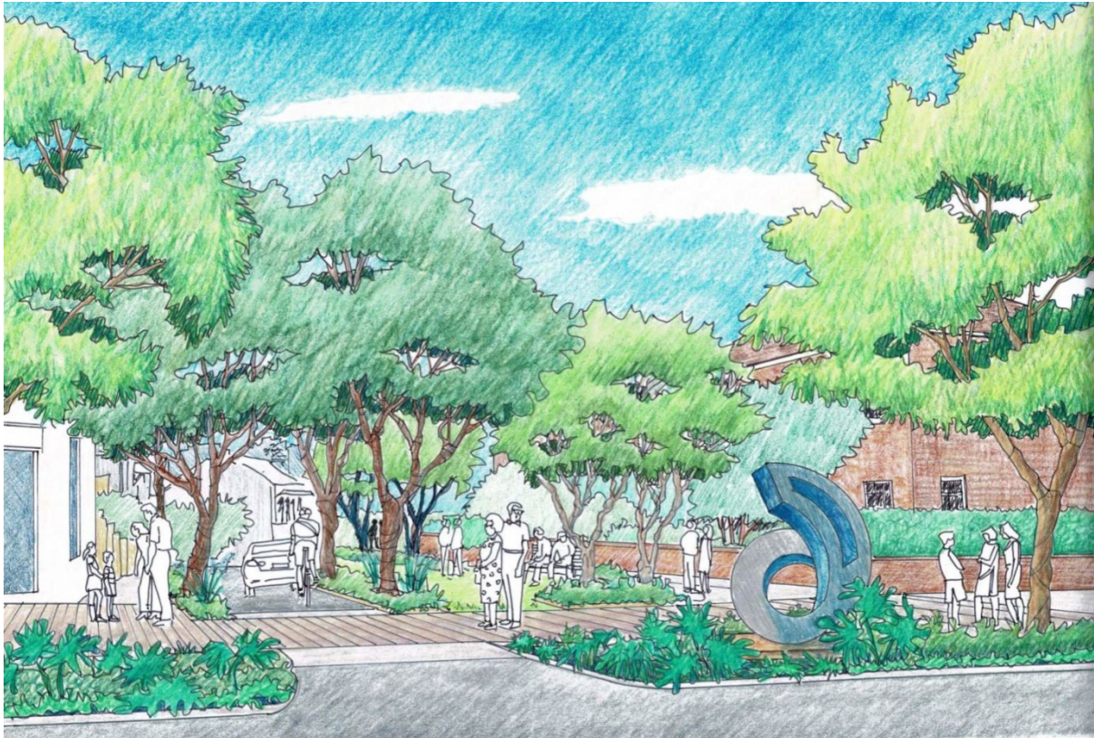
Artists Impression of the “East Crescent Street Pocket Park – taken from the Masterplan for McMahons Point - Blues Point Road Village Centre. Adopted by Council in April 2021.