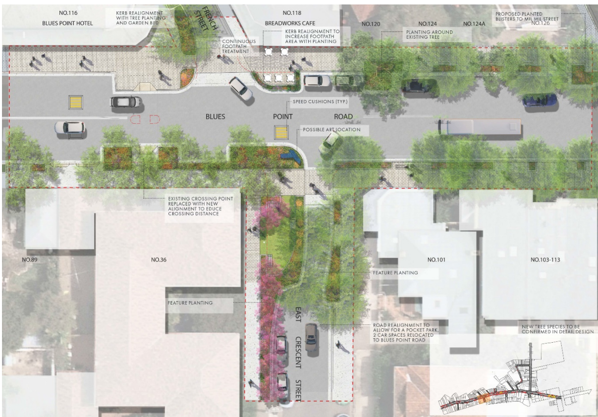
Plan of the “East Crescent Street Pocket Park – taken from the Masterplan for McMahons Point - Blues Point Road Village Centre. Adopted by Council in April 2021.