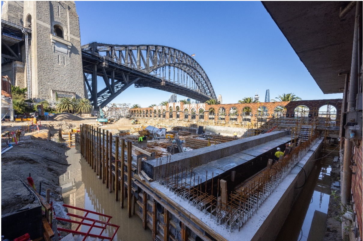
50m pool 08/07/2022