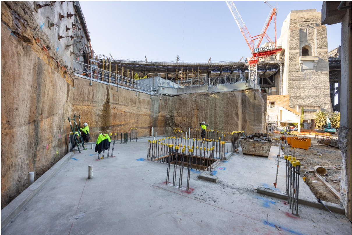
Level 1 Plant room 09/06/2022