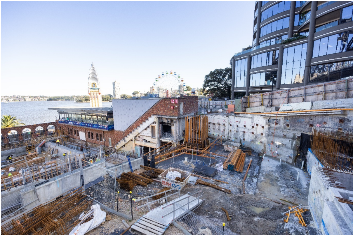
Level 2 Plant Room formed 08/07/2022