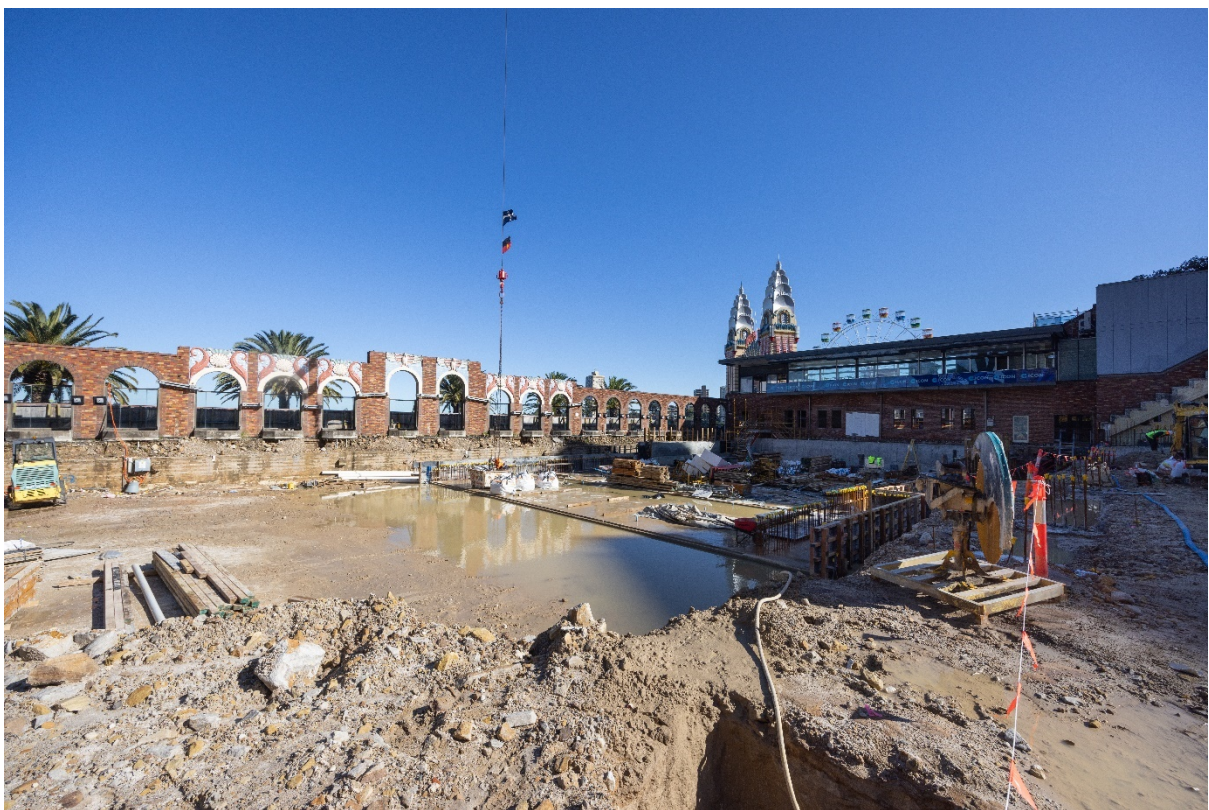
50m pool 08/07/2022