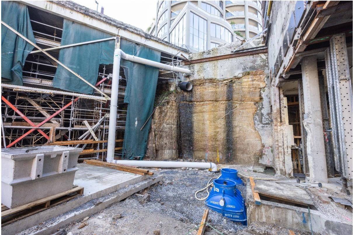
Western Stairs 08/07/2022