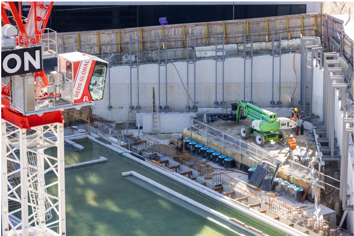
The old Hopkins Park 08/07/2022