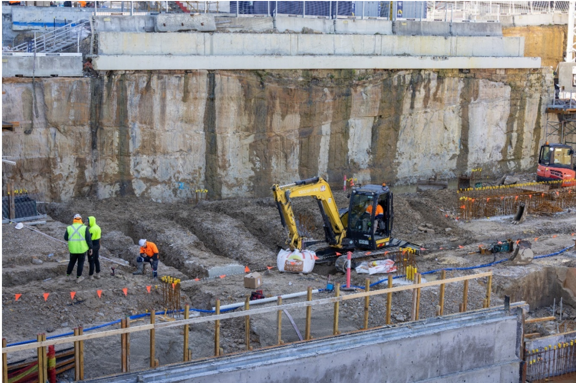
Grandstand inground services underway 08/07/2022