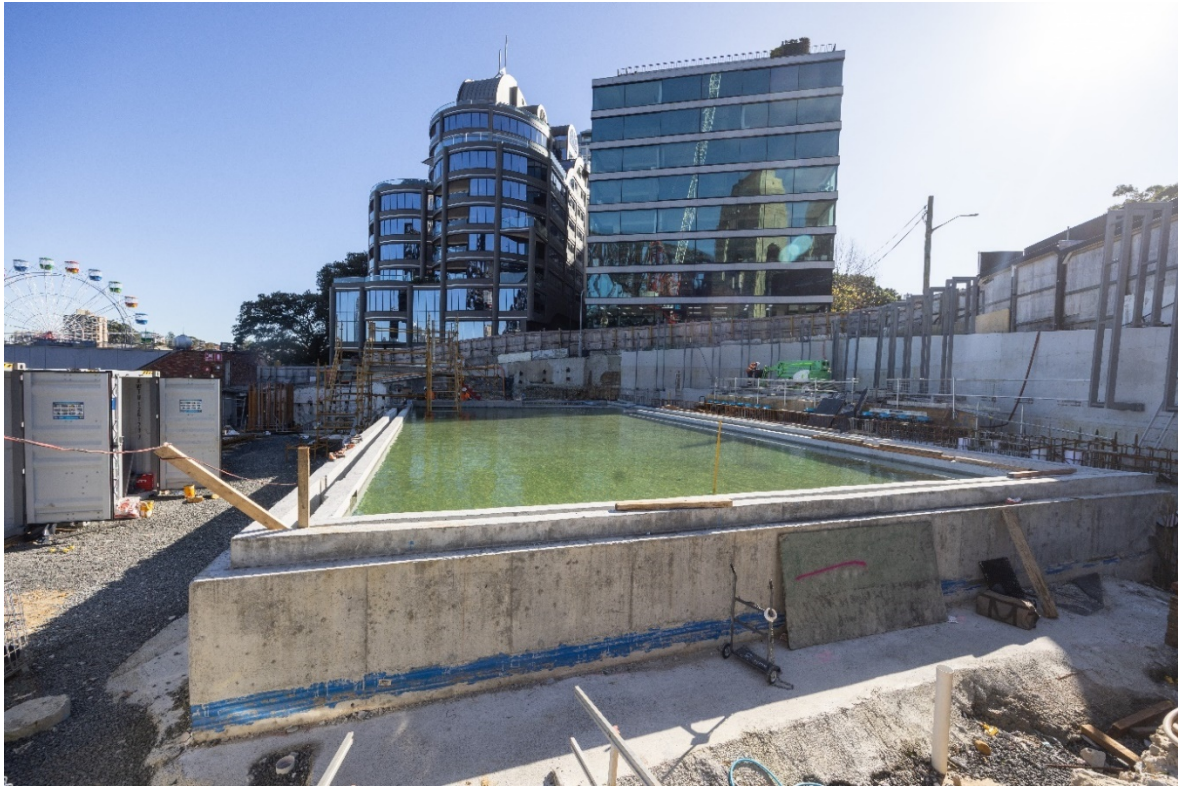
Program pool leak testing under way 08/07/2022