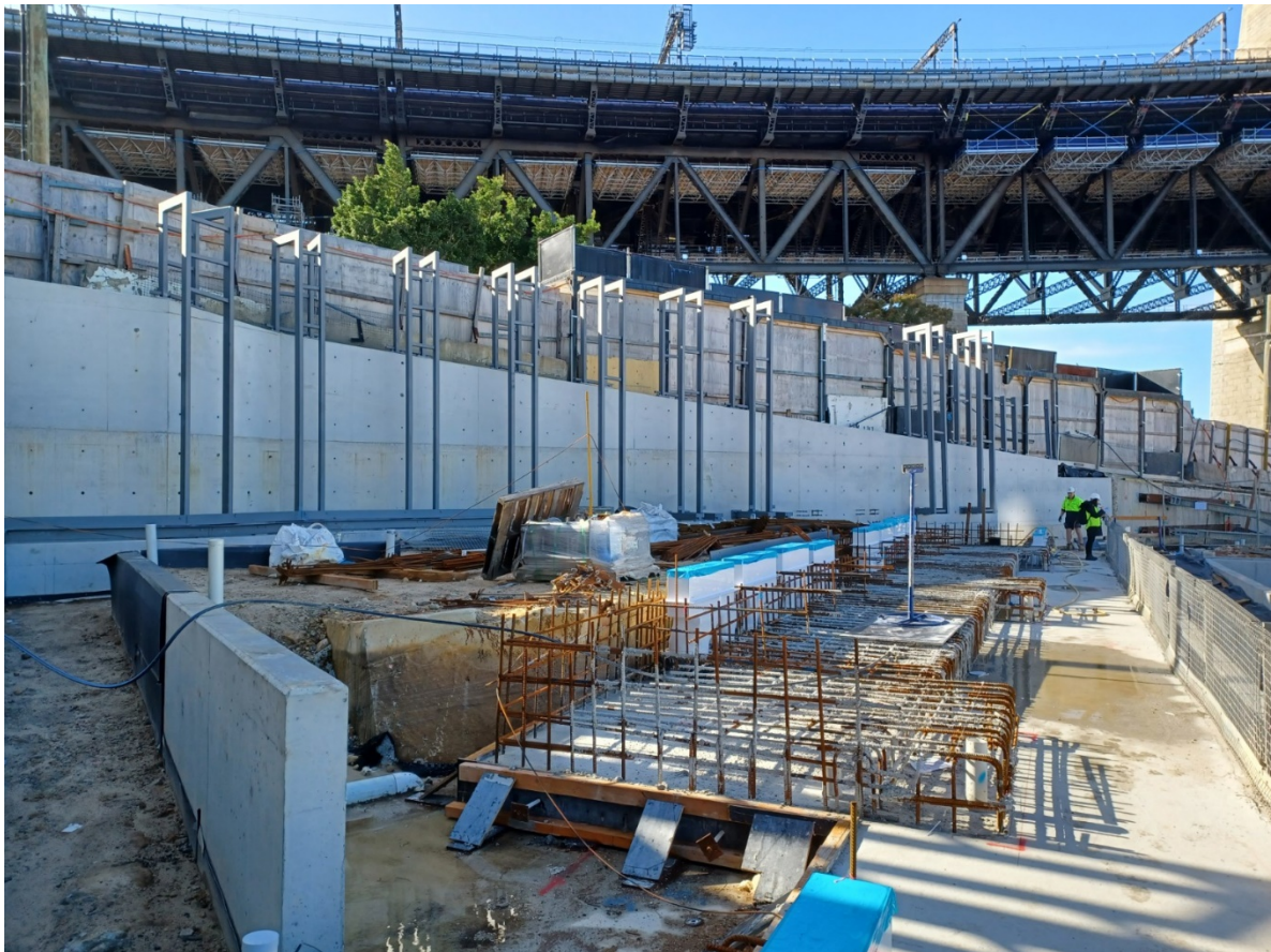
The old Hopkins Park 24/08/2022