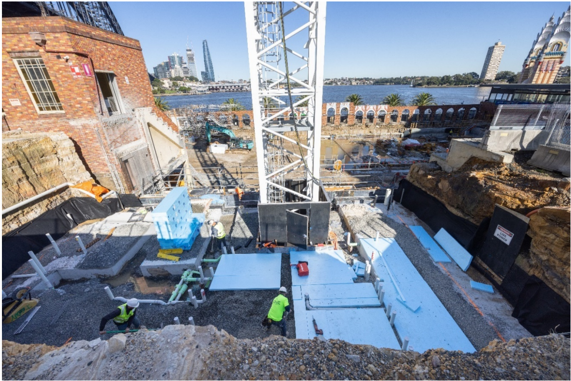
Level 2 Amenities 08/07/2022