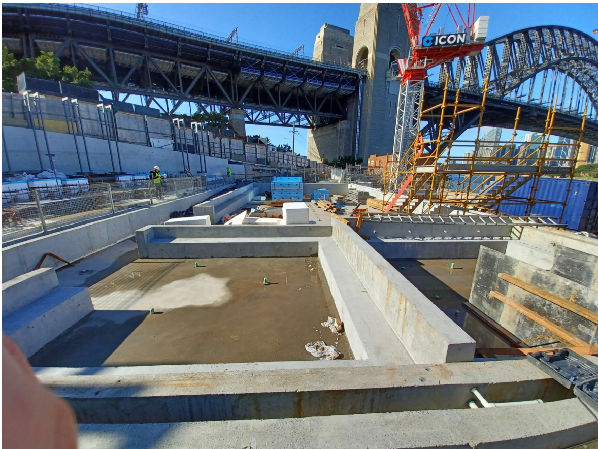
Program pool with Spa 24/08/2022