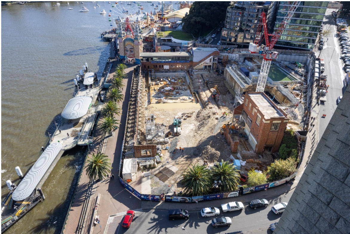
View from the Sydney Harbour Bridge 8/7/2022