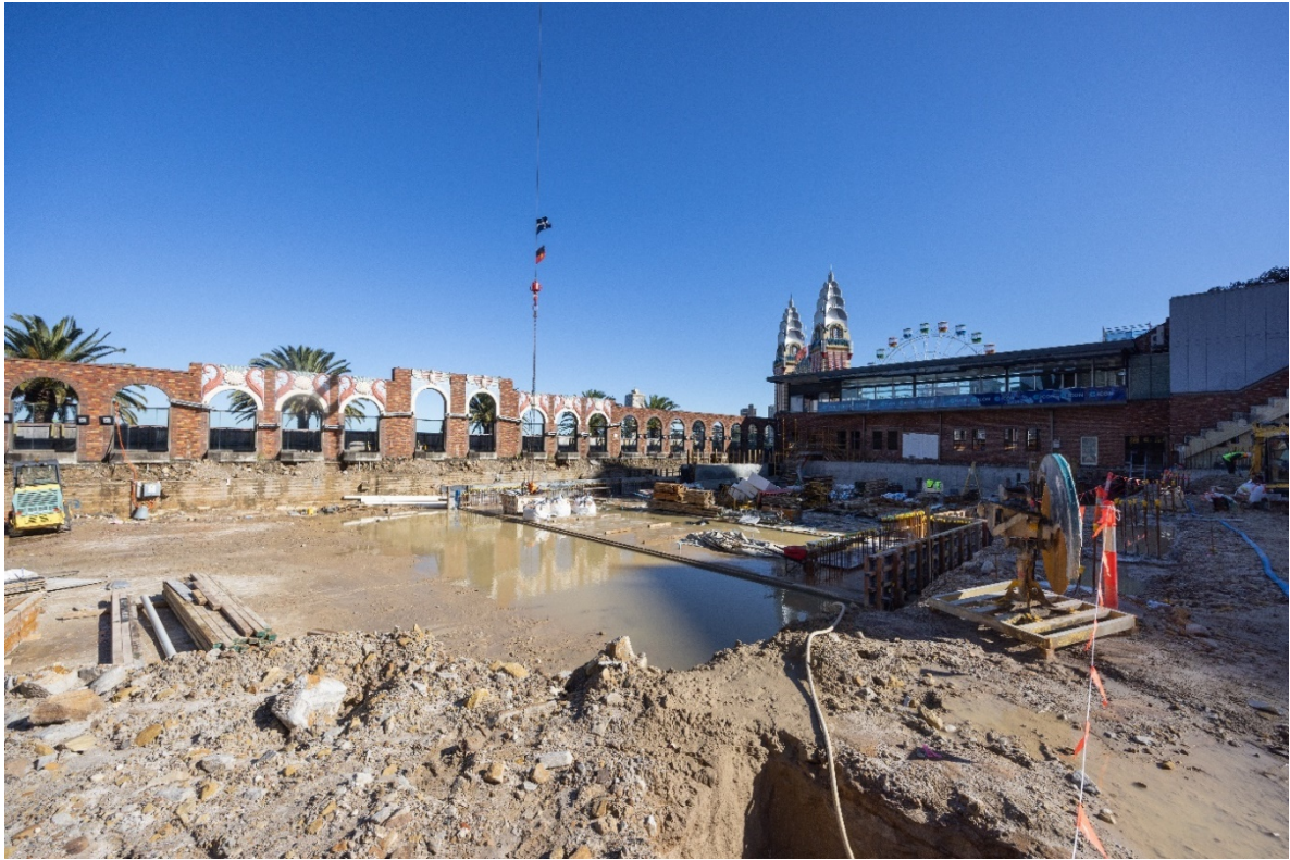
50m pool 08/07/2022