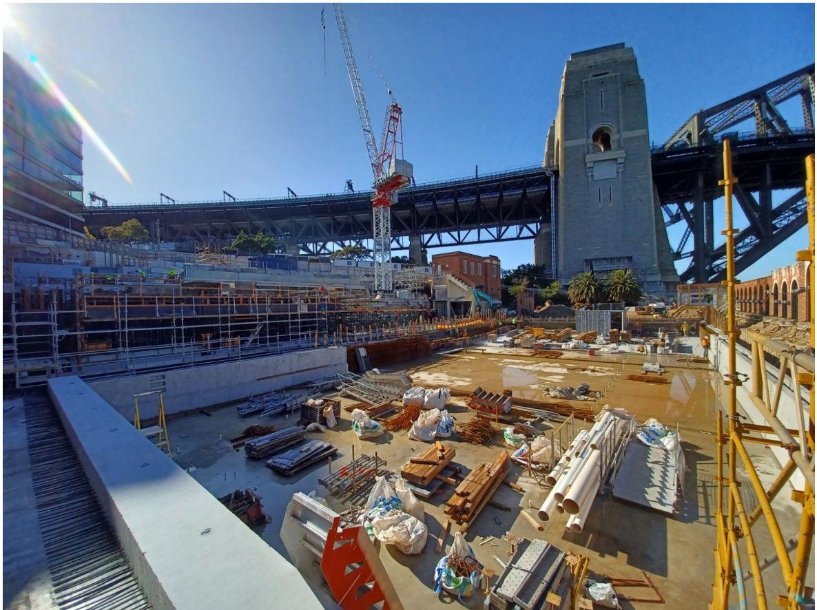
50m pool 24/08/2022