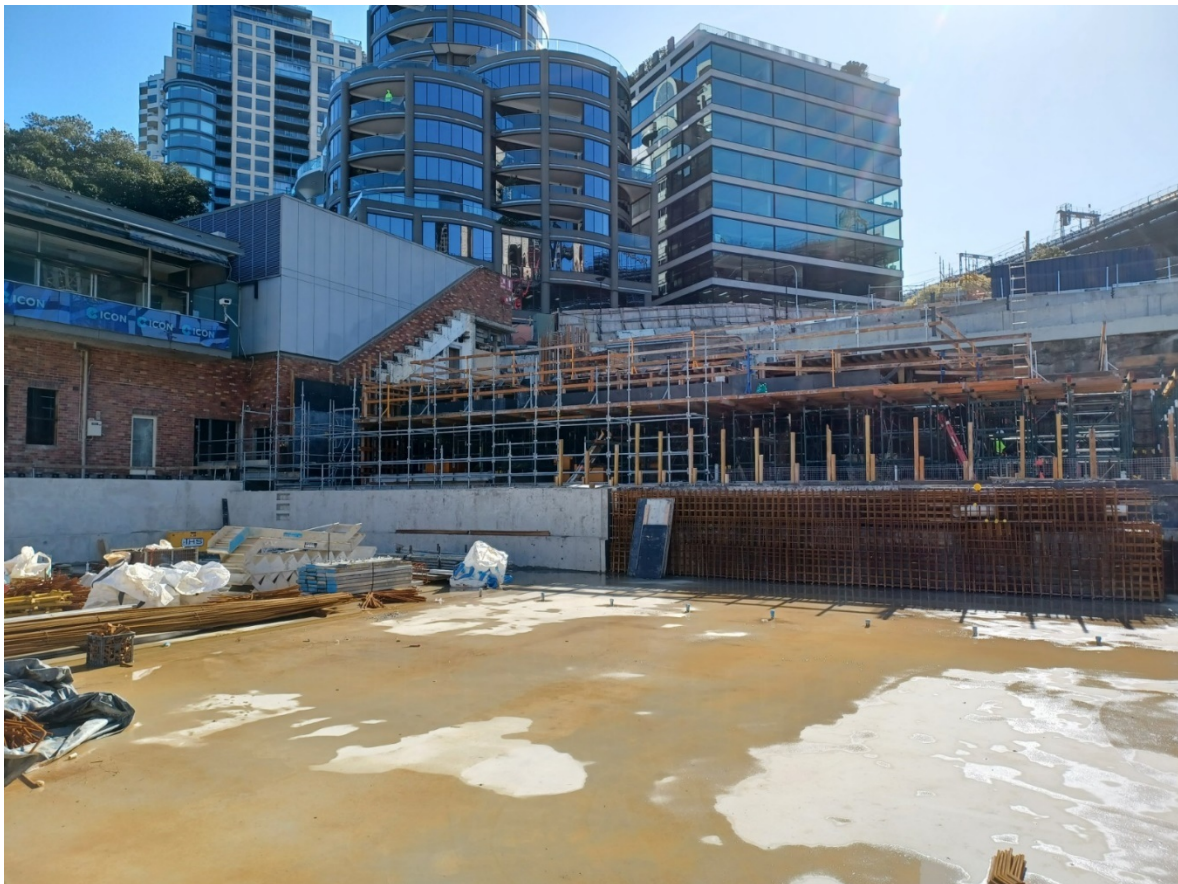
Grandstand level 2 formwork 24/08/2022