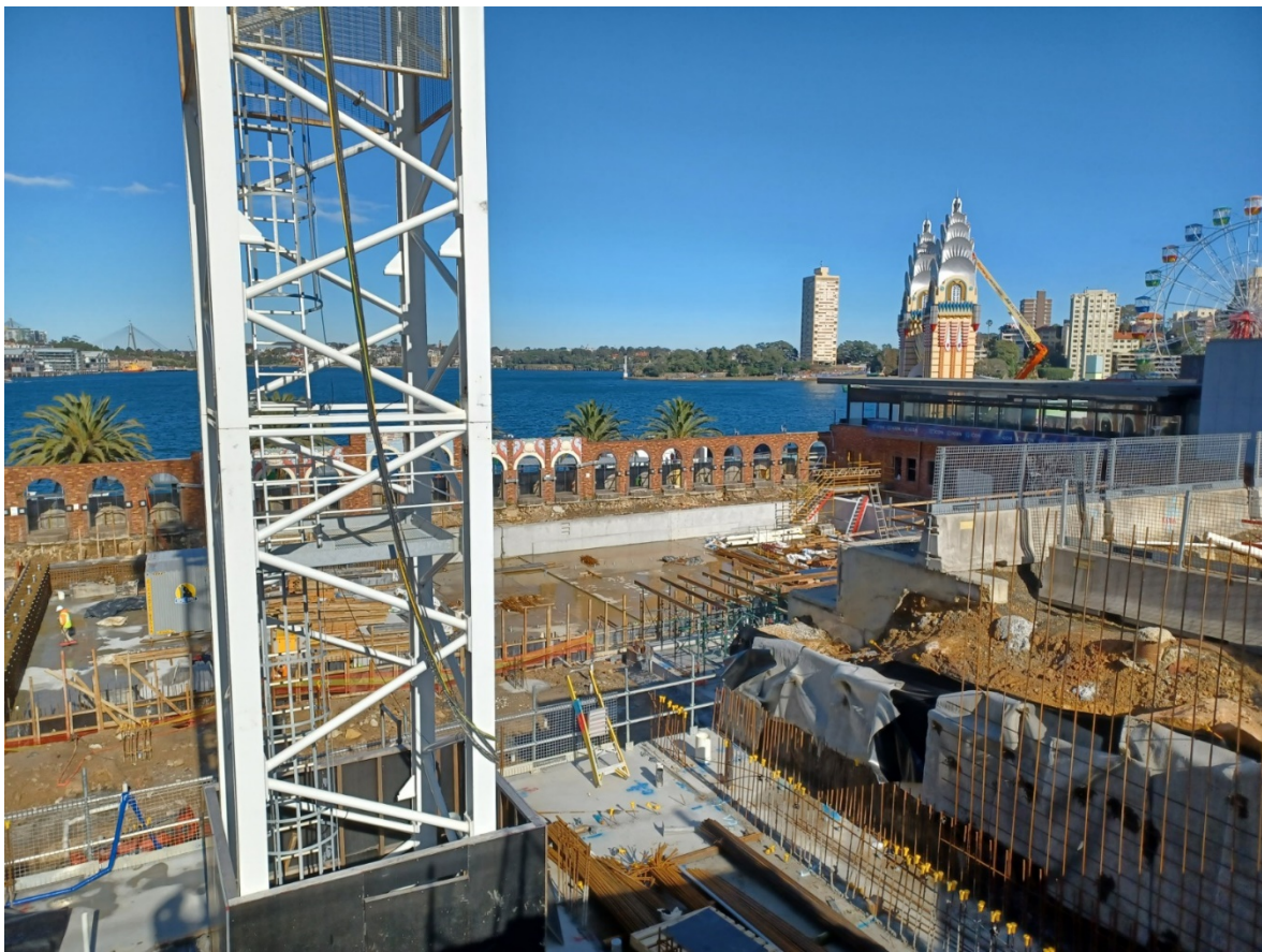
Level 2 Amenities 24/08/2022