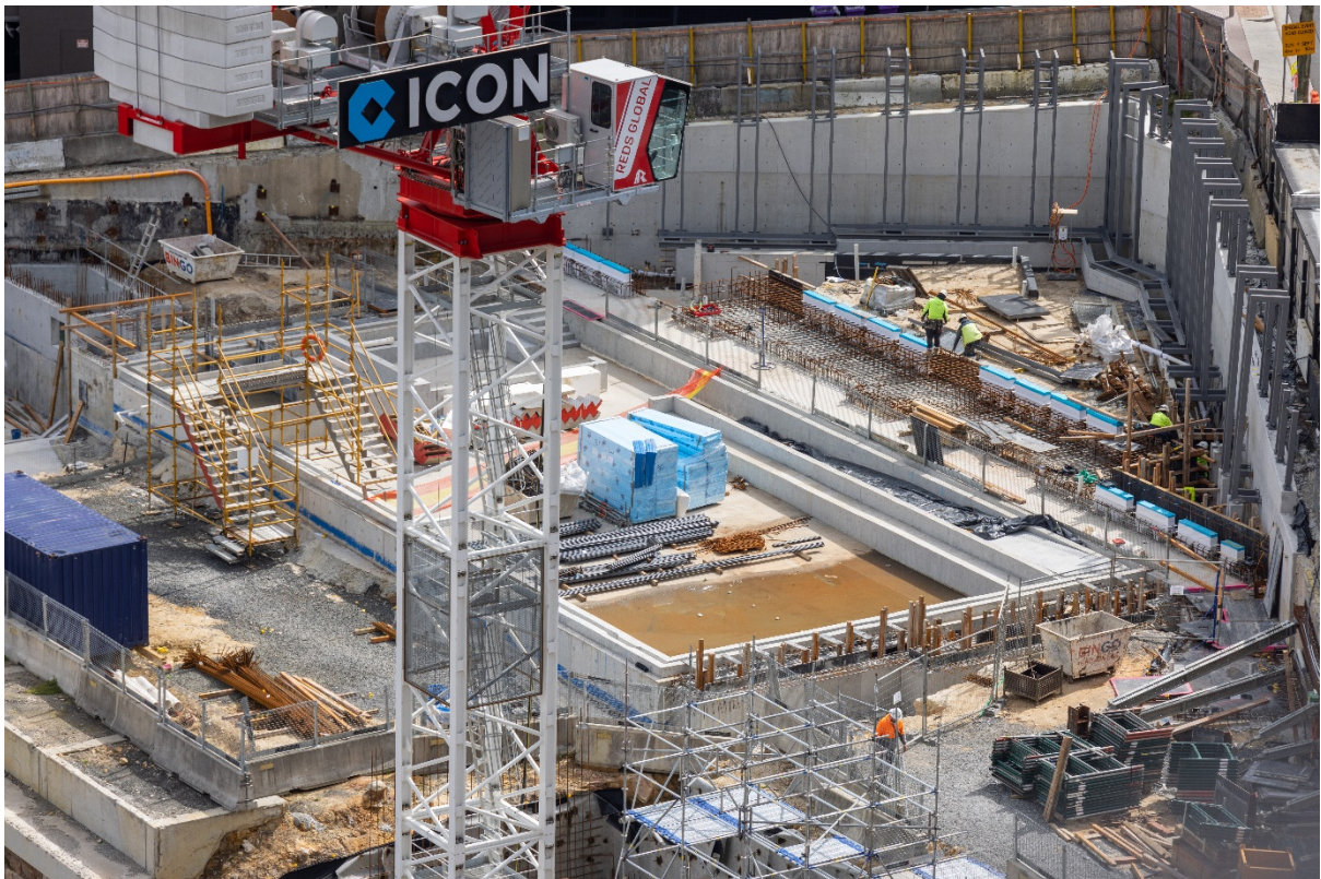
Hopkins Park corner - View from the Sydney Harbour Bridge 15/09/2022