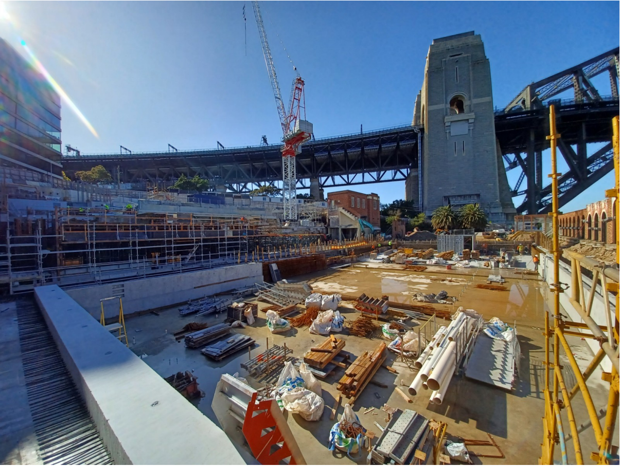
50m pool 24/08/2022