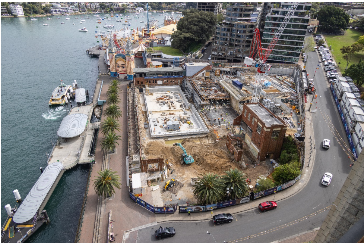
Entire Site - View from the Sydney Harbour Bridge 15/09/2022