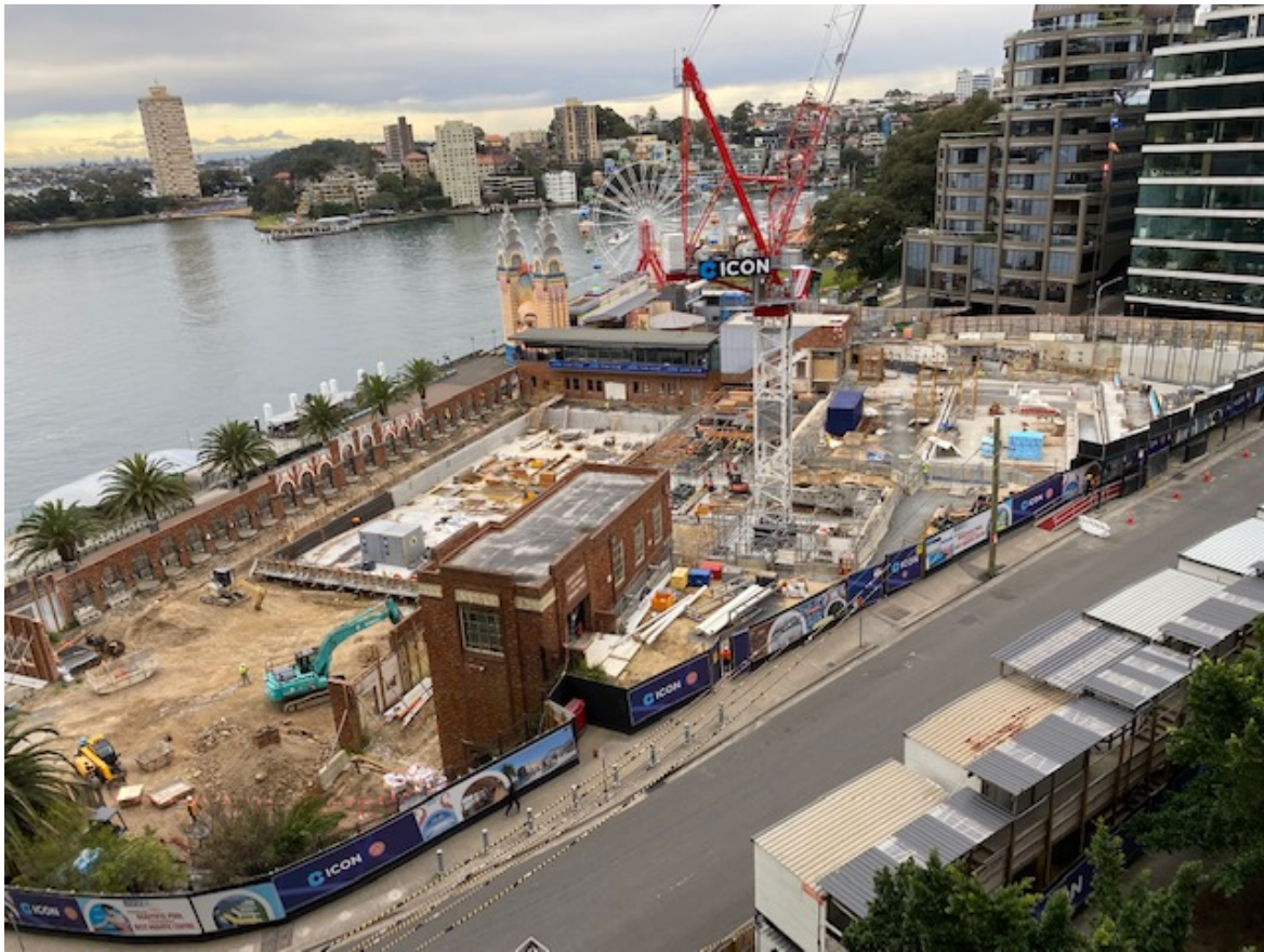
View from the Sydney Harbour Bridge 19/8/2022