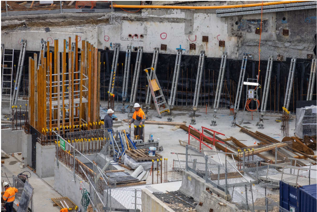
Level 2 plant room - View from the Sydney Harbour Bridge 15/09/2022