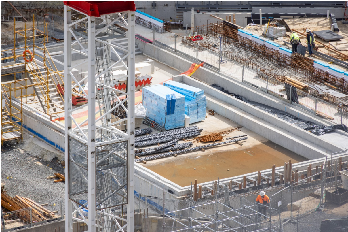
Program pool - View from the Sydney Harbour Bridge 15/09/2022