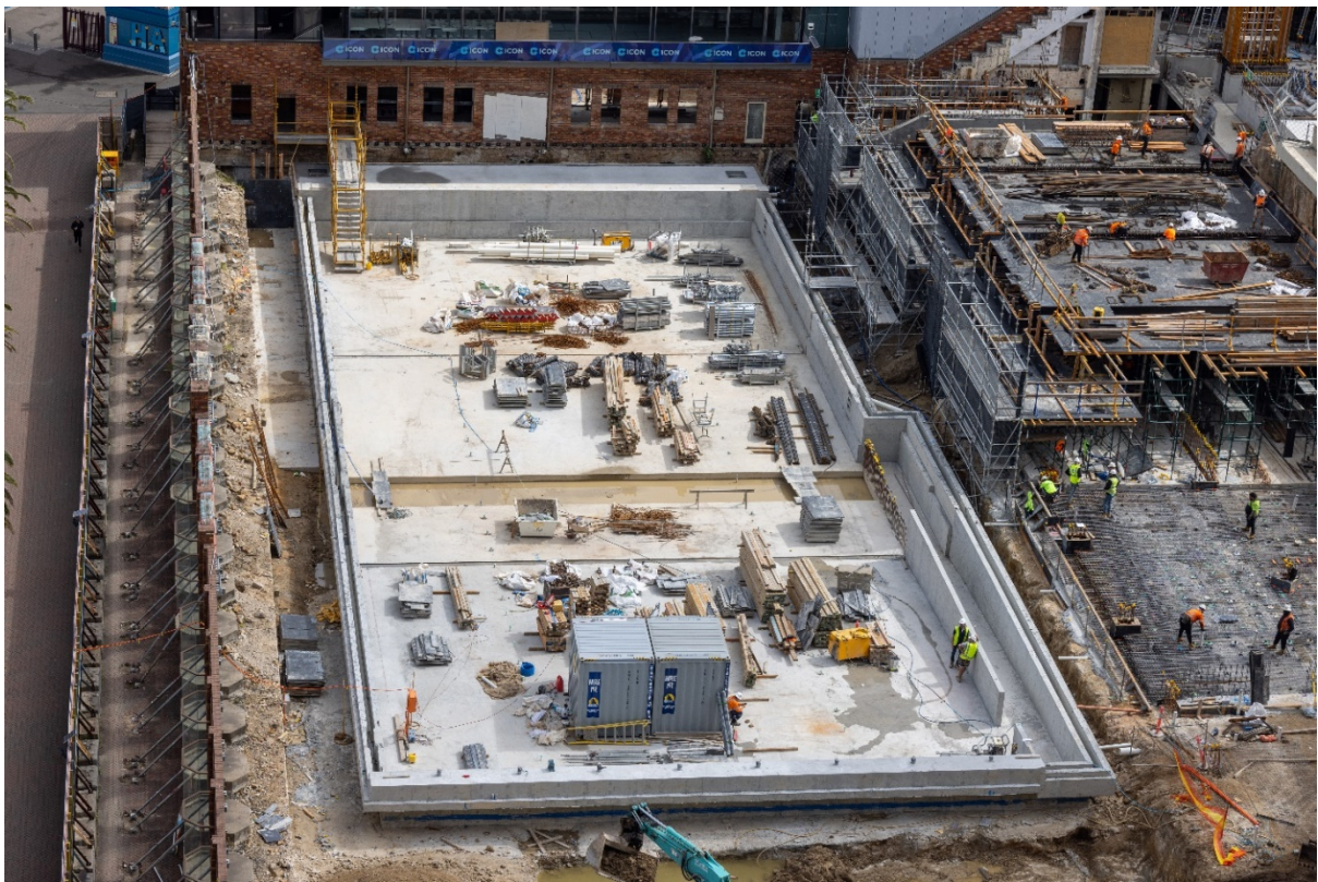
50m pool - View from the Sydney Harbour Bridge 15/09/2022