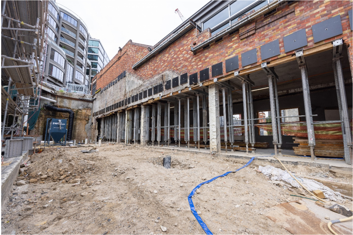
Western Stairs 15/09/2022