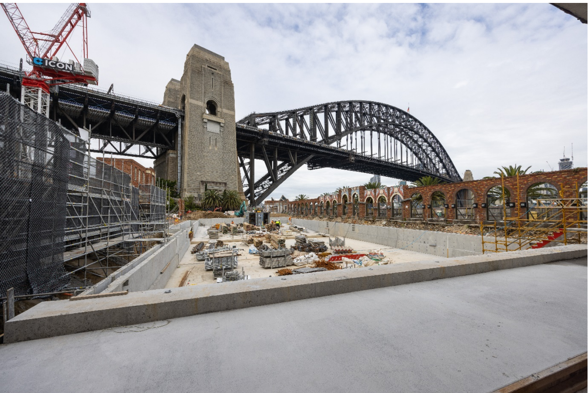
50m pool 15/09/2022