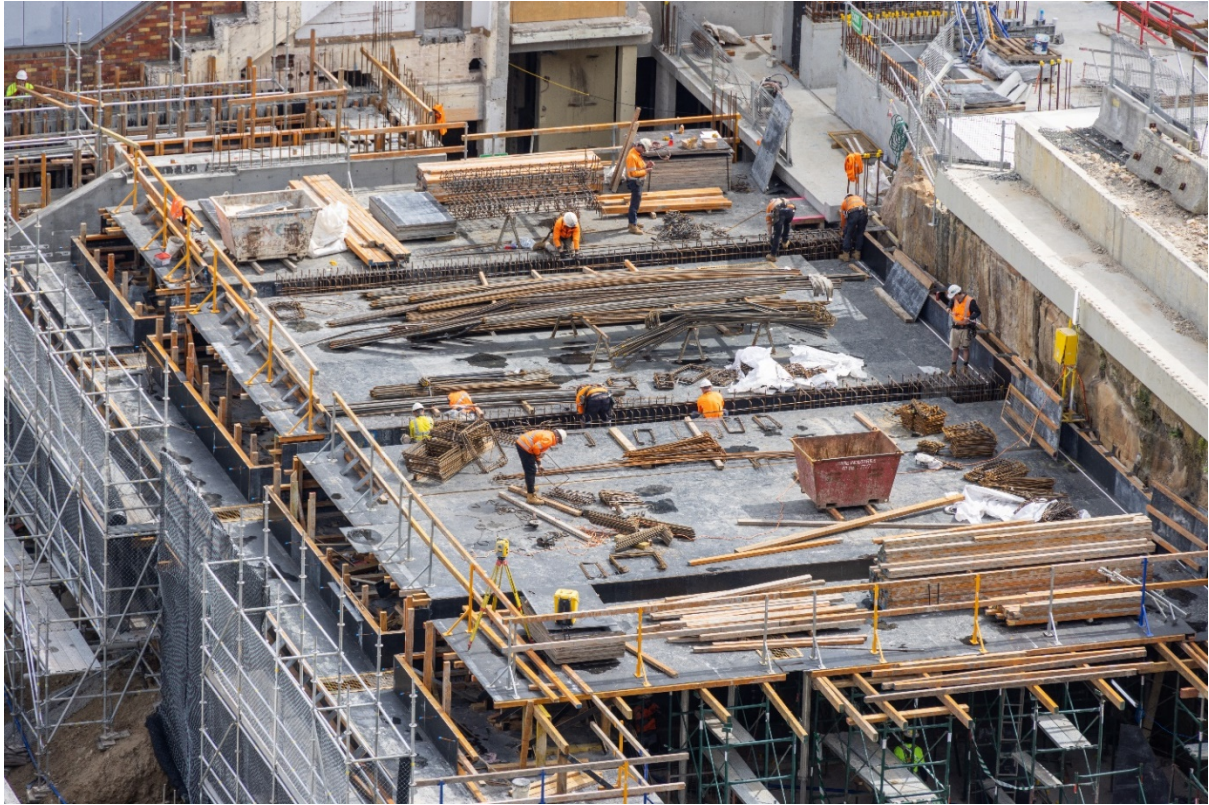
Formwork Level 2 Gym - View from the Sydney Harbour Bridge 15/09/2022