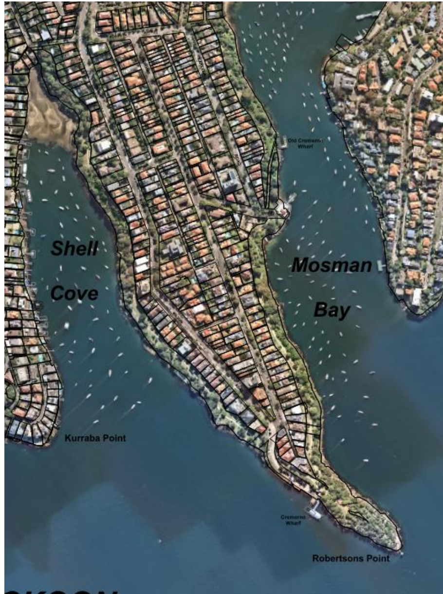
Map 1 – Aerial Photograph of Cremorne Reserve 2020