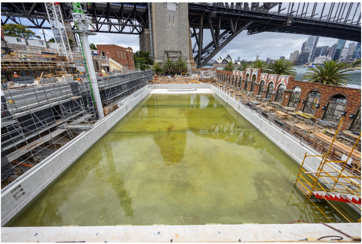
50m Pool has passed the leak test 20 December 2022