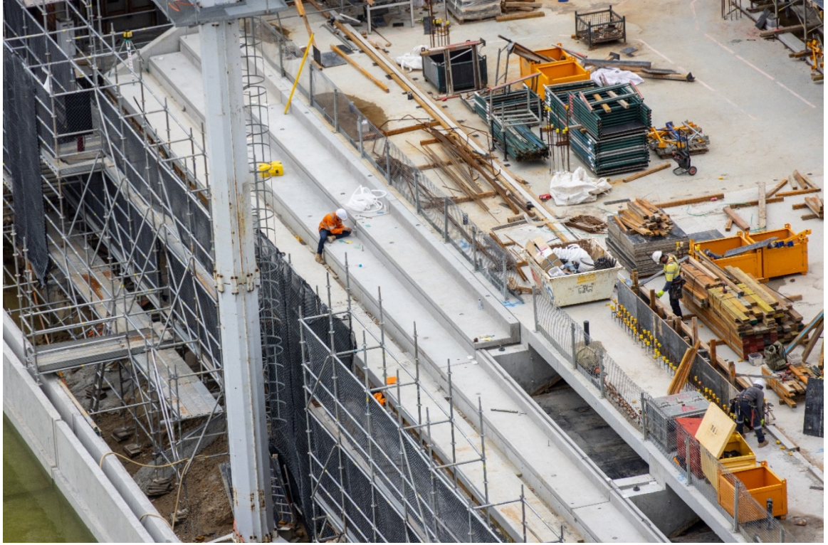
Lower Grandstand installation underway 20 December 2022