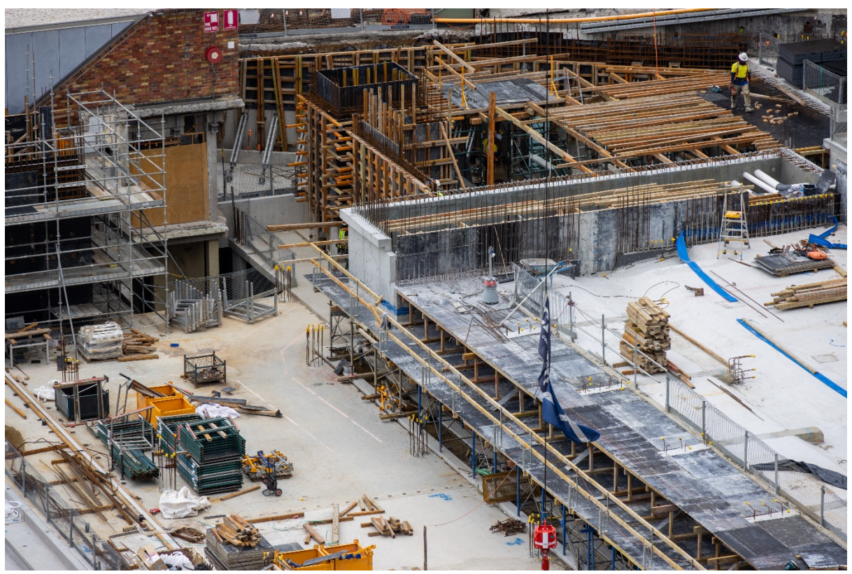
Plant room area under construction 20 December 2022