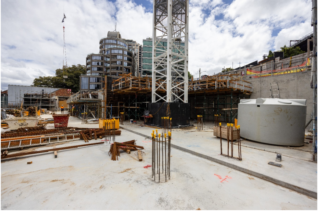
Level 2 20 December 2022