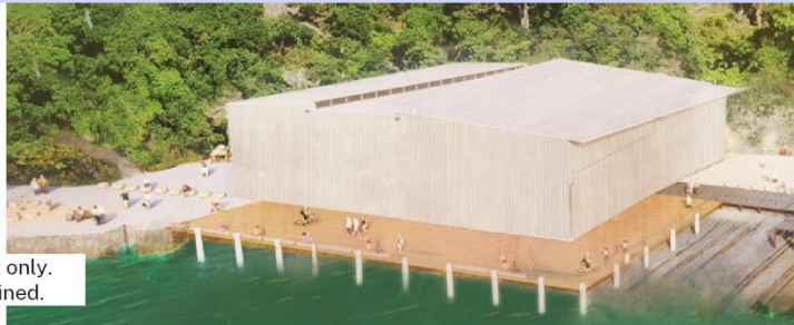
High level concept only. Designed to be refined.