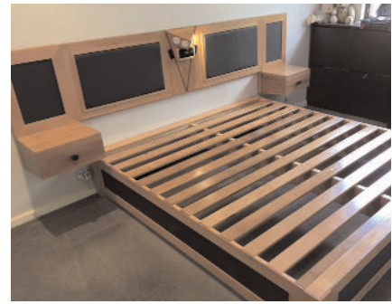
King size bed - Allen Dodd