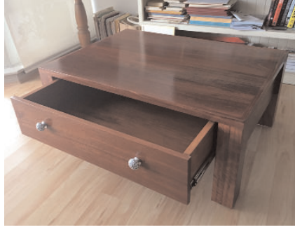
Coffee Table - Bill Howard