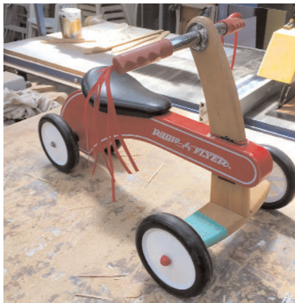
Tricycle good as new

We think we will develop a long-standing relationship with Ned!