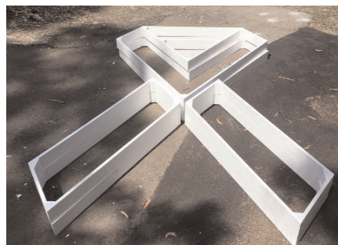
..... become White Ribbon garden bed frames

The Shed at Council's request purchased sufficient wood and paint to manufacture two White Ribbon garden bed frames to be installed along the entrance to Council chambers for White Ribbon Day in October. 30 metres of timber and 36 brackets made up the finished product which was painted white.