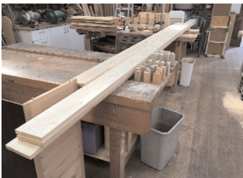
A few planks and brackets .....