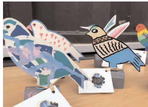
..... and after decoration

The Shed manufactured 200 birds with wooden bases, finished in white primer, which were then supplied to Council for painting and distribution.