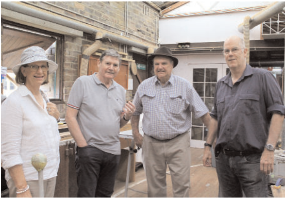
Members and Guests at Open Day 2019

In summary, we have had a busy but rewarding and entertaining year. We took part in a presentation for the Senior's Week Expo launch and held an Open Day at the Shed which was very well attended and received.