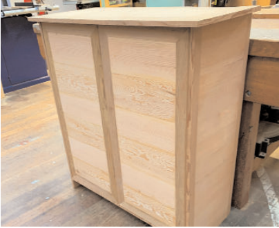
Cupboard - Geoff Symonds