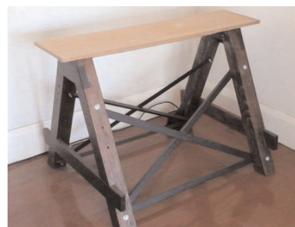
Workbench - Alf Zawadski

Shed members largely pursue their own interests and projects, some of the more interesting ones being: