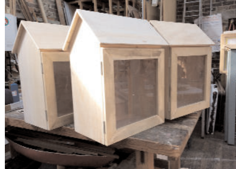
Community libraries awaiting stands

The Shed manufactured four libraries as illustrated and supplied them mounted on pointed posts for installing in a garden style environment.