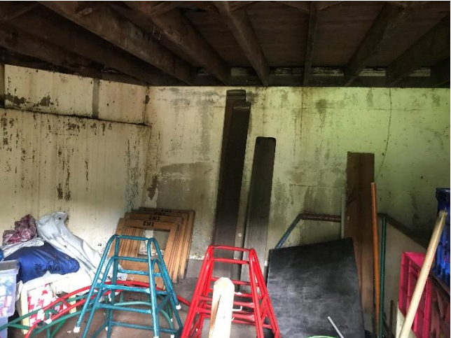
Interior views of the outdoor storage shed