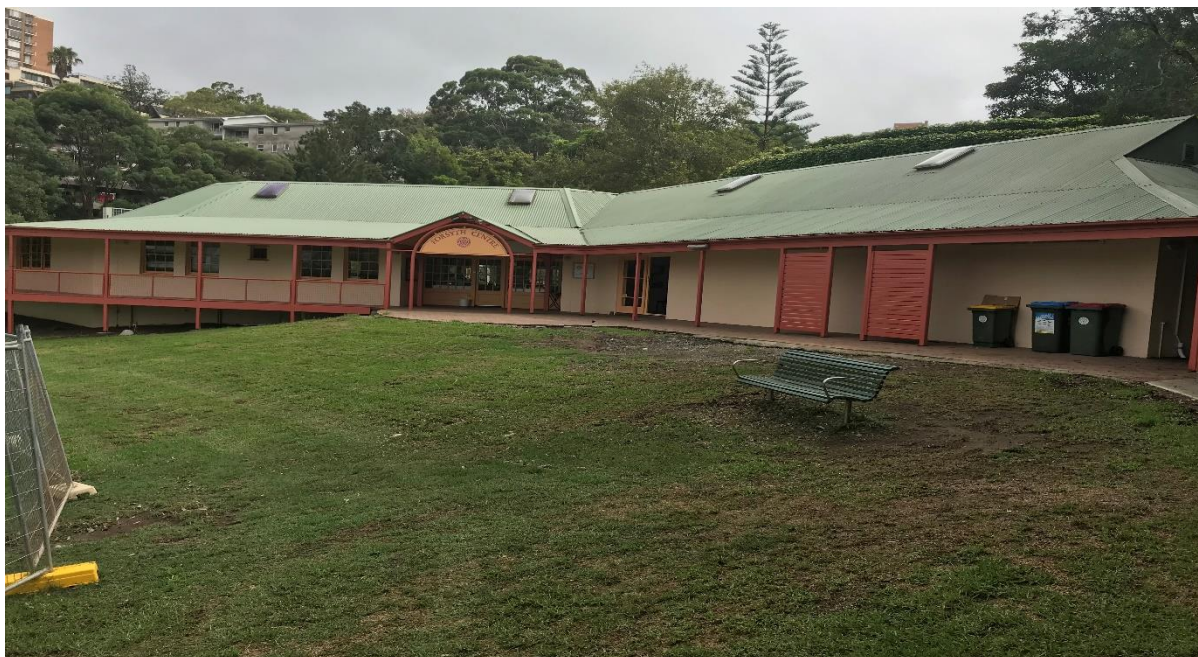
Forsyth Park Community Centre