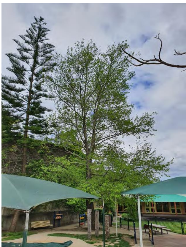
The playground at the rear