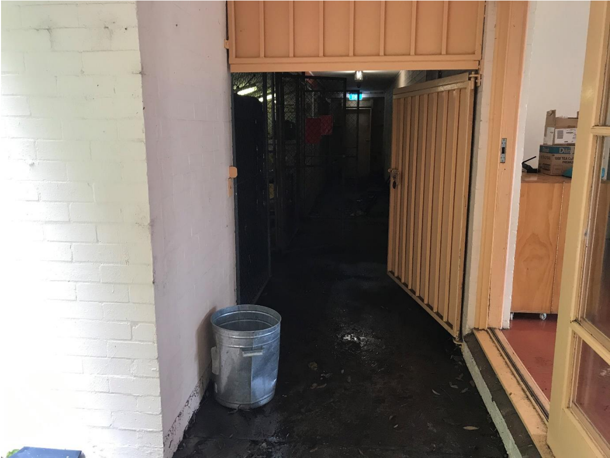
Former Groundsman’s shed