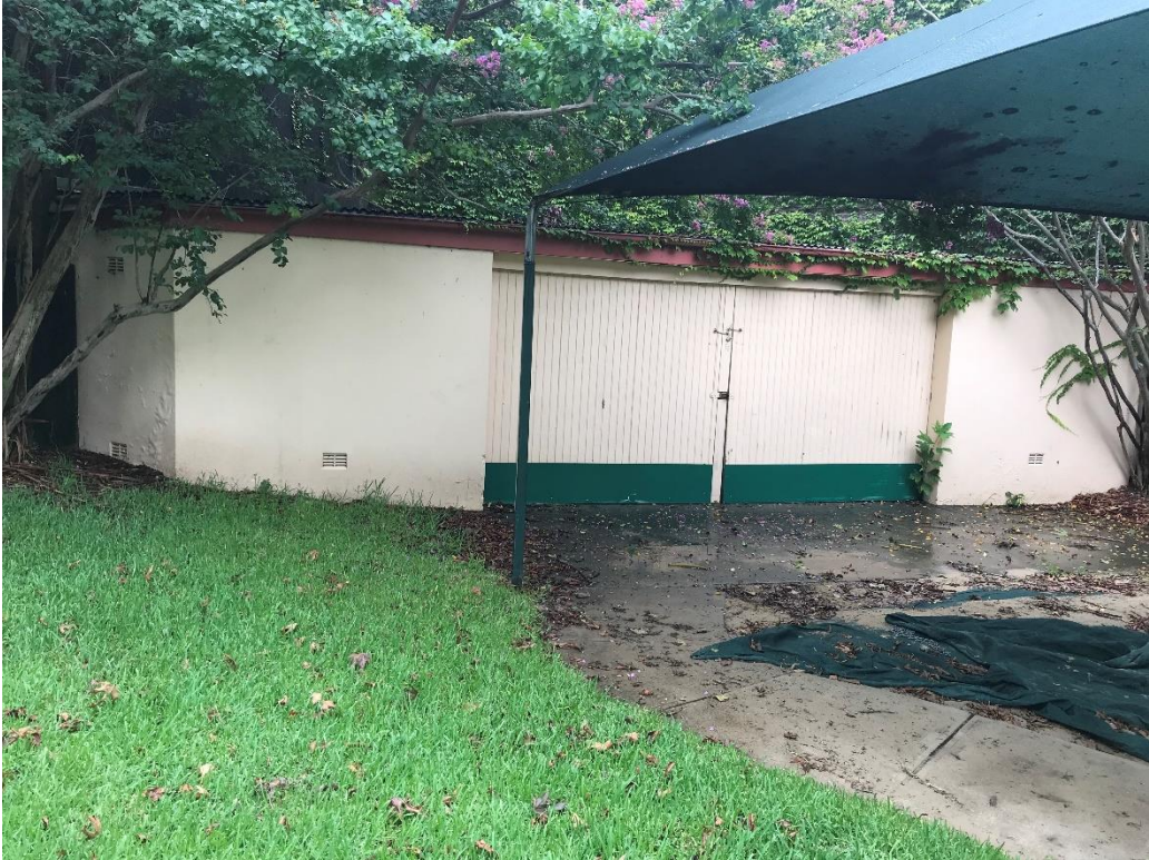
Outdoor play equipment storage