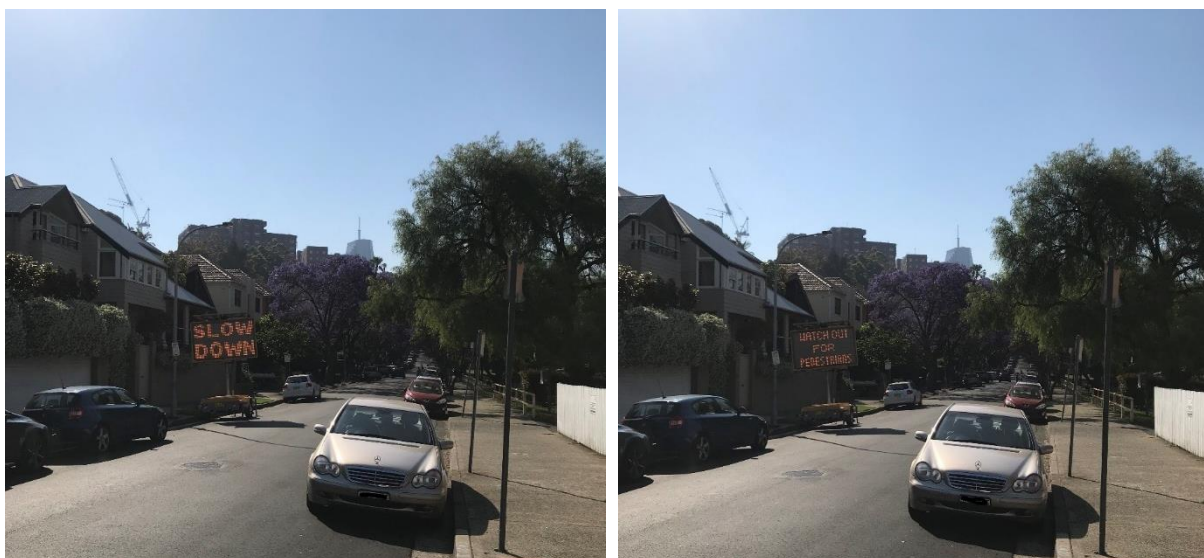
Figure 4 McDougall Street Council-owned VMS sign installed November 2019