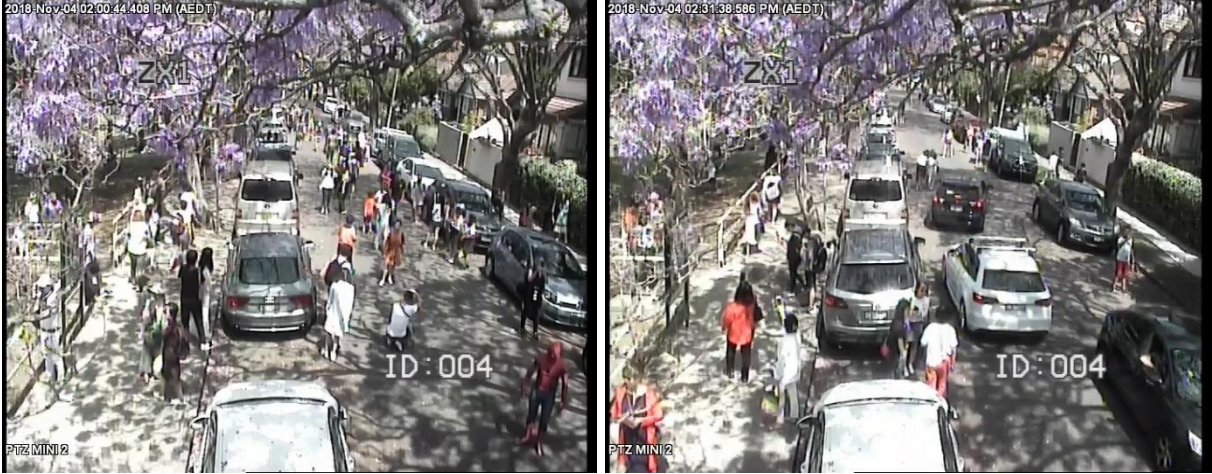
Figure 3 typical observations from CCTV footage during jacaranda blooming (November 2018)

majority of pedestrians and motorists were considerate of each other, some motorists used car horns to move pedestrians on, which has been the cause of frustrations for local residents.