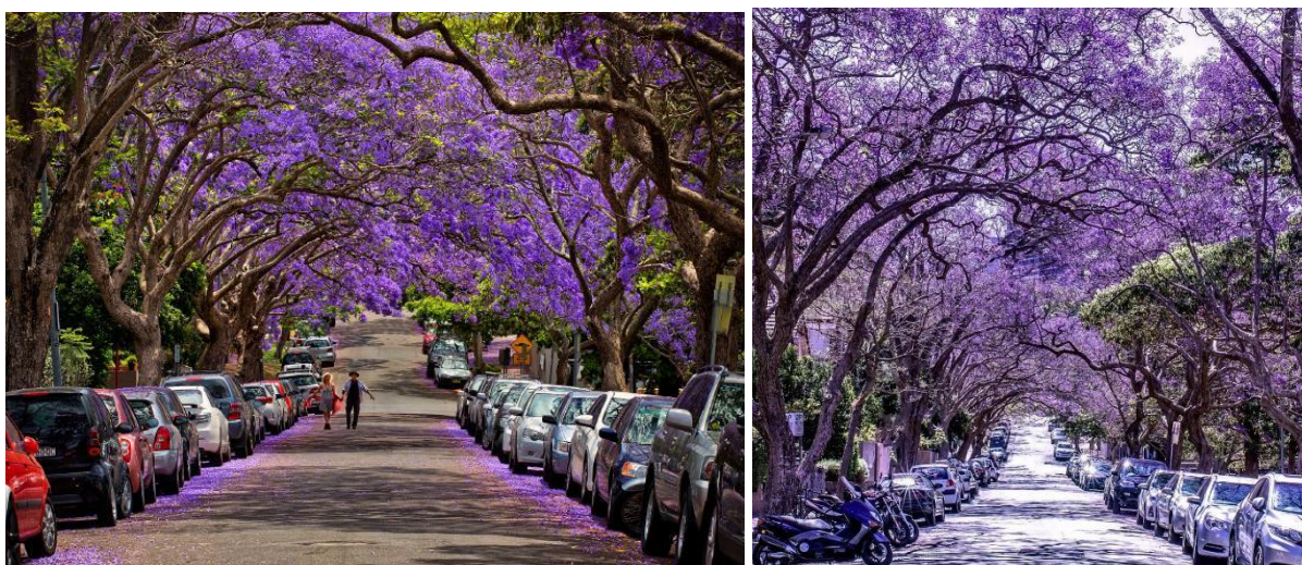
Figure 1 - Flowering Jacarandas McDougall Street in Kirribilli – October – November

Each year between September and November the Jacarandas that line both sides of McDougall Street in Kirribilli come into flower for a period of approximately 6 weeks. This seasonal occurrence which generally peaks around mid-November has become a growing attraction for local North Sydney residents and tourists in recent years who wish to photograph themselves amongst the jacarandas which form a spectacular flowering avenue for the length of McDougall Street adjacent to Milson Park.