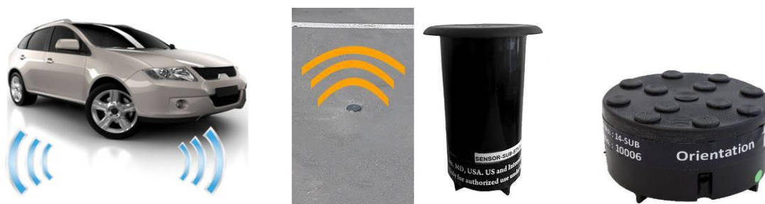
Images of Council's vehicle sensors

The revenue that Council's collected across the network for under 15-minute stays during the same 12-month period was $211,305.