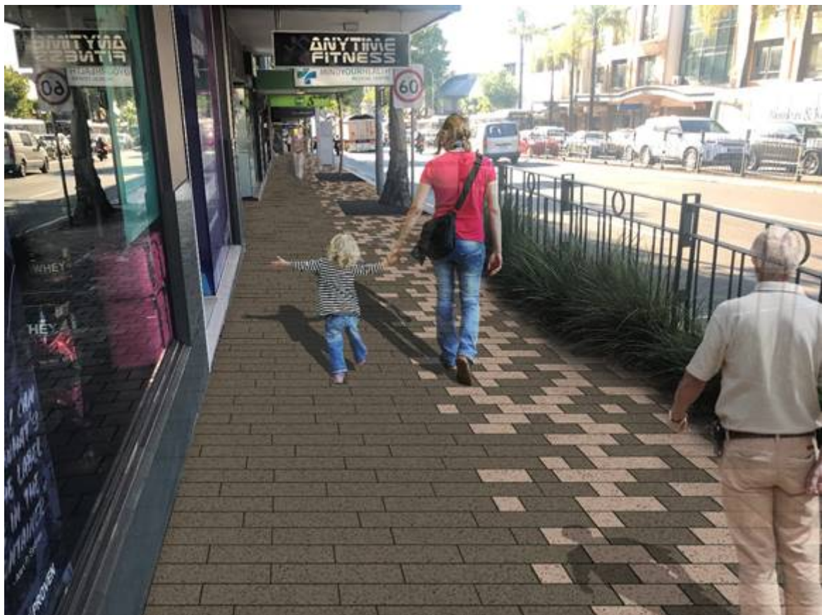
Figure 2 – Photo Montage Separable Portion C (Zone 15) – Looking East