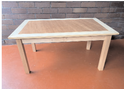
Coffee Table - Geoff Symonds