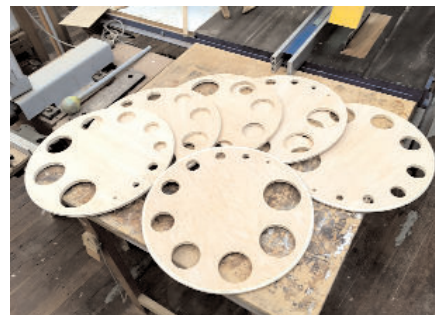
6 x Dilation Gauges (10mm to 100mm)