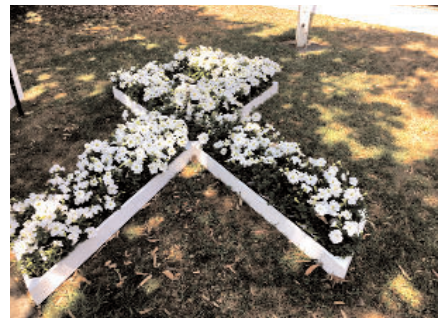
One of the White Ribbon Garden beds

The Shed manufactured two ribbon-shaped frames for council which were then populated with white flowers and placed outside Council Chambers in Miller St.