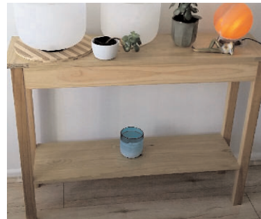
Pine Sidetable - Geoff Symonds