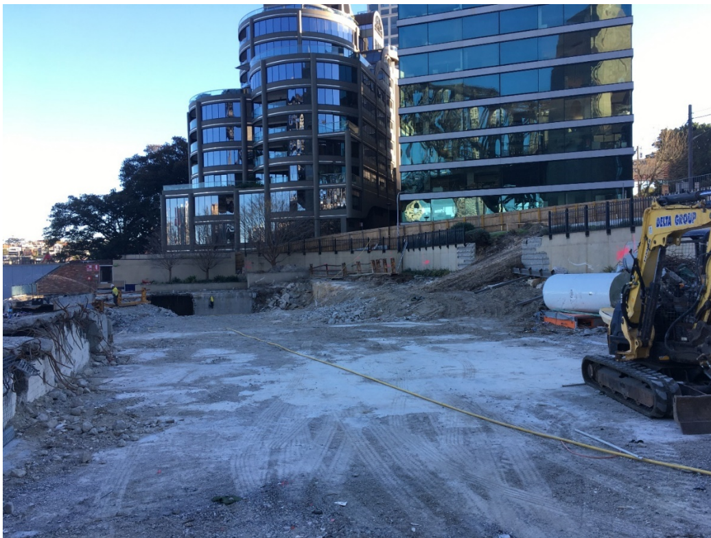
25m pool area 06 August 2021