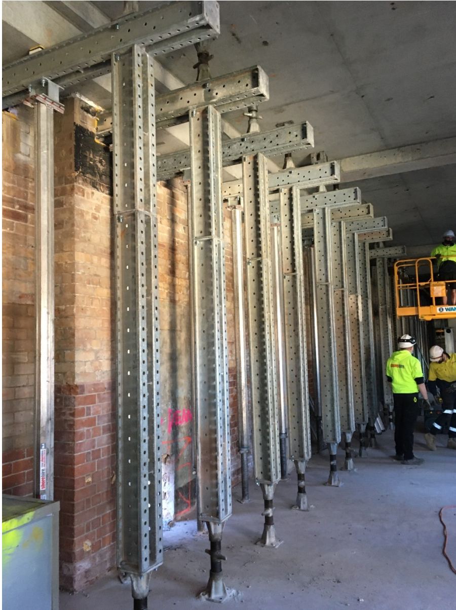
Western wall stabilisation 06 August 2021