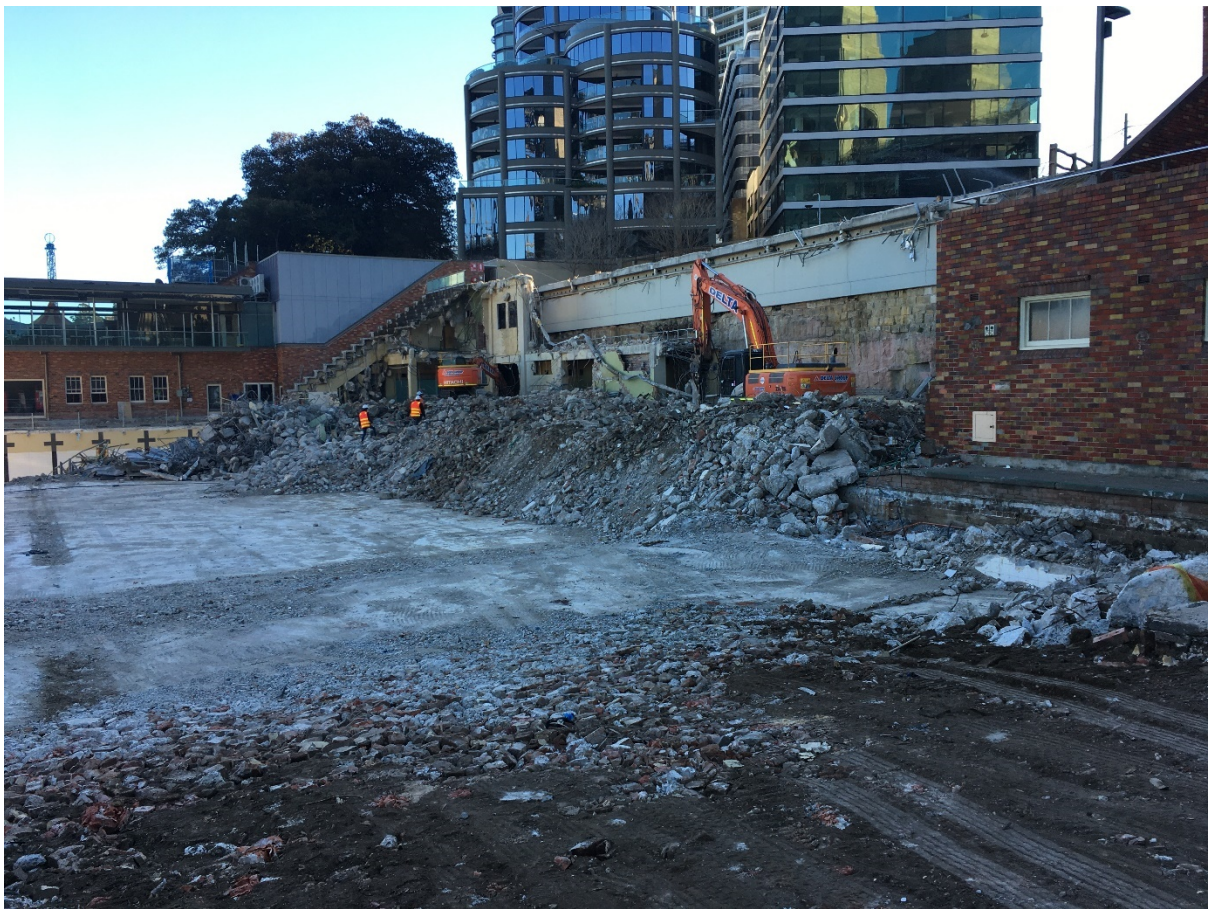
Grandstand removed 06 August 2021