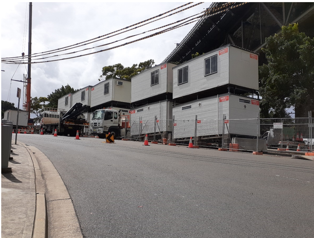
Site Amenities on Alfred St