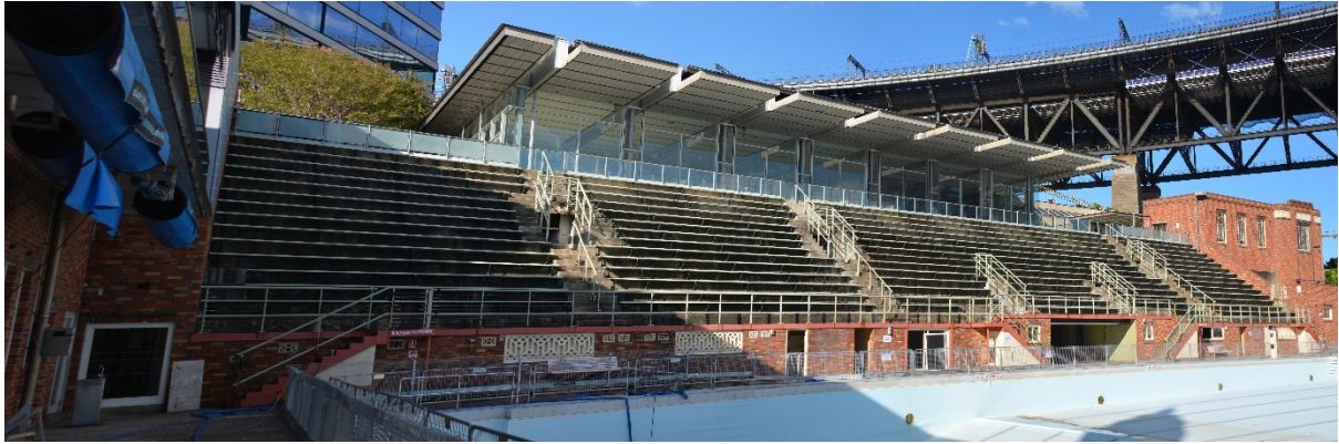
Grandstand March 2021