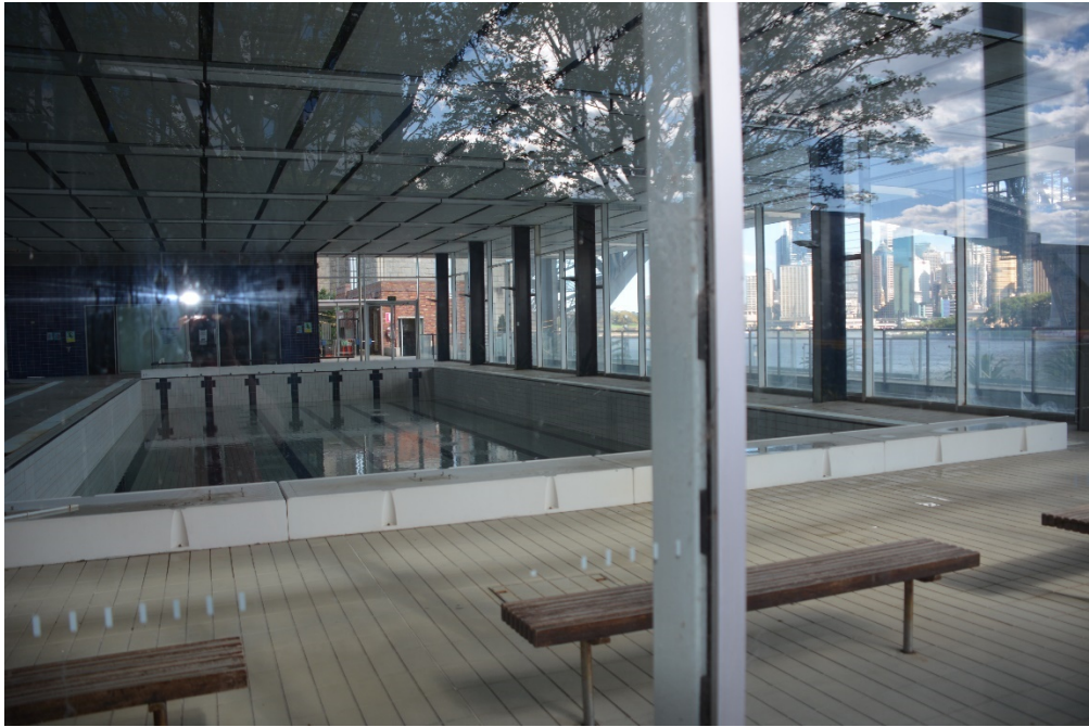
25m pool hall March 2021