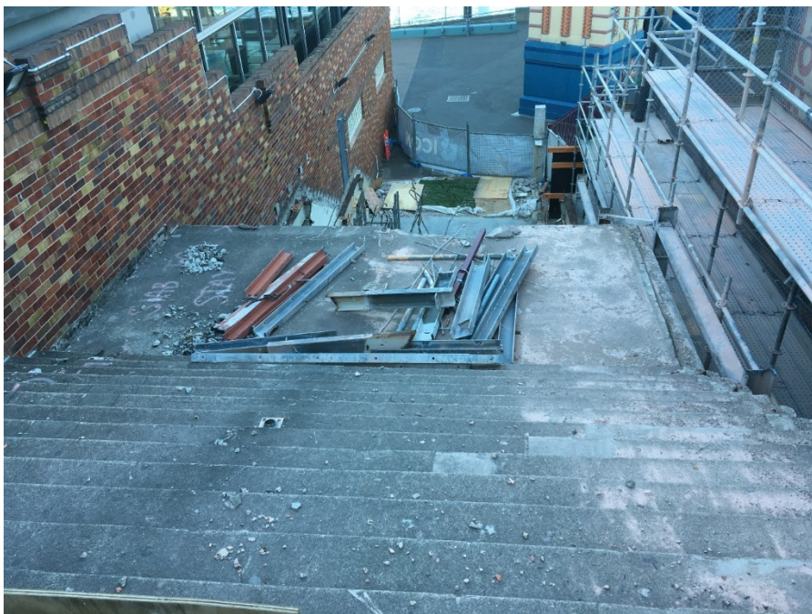
Western Stairs 06 August 2021