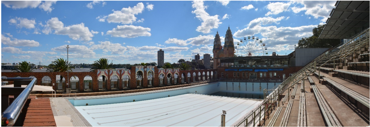
50m pool March 2021