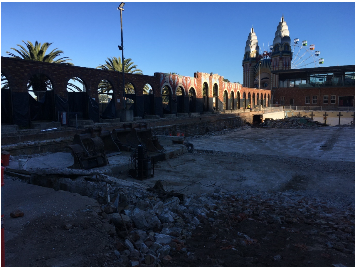
50m pool 06 August 2020