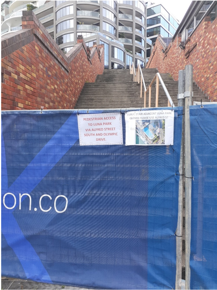
Western Stairs March 2021