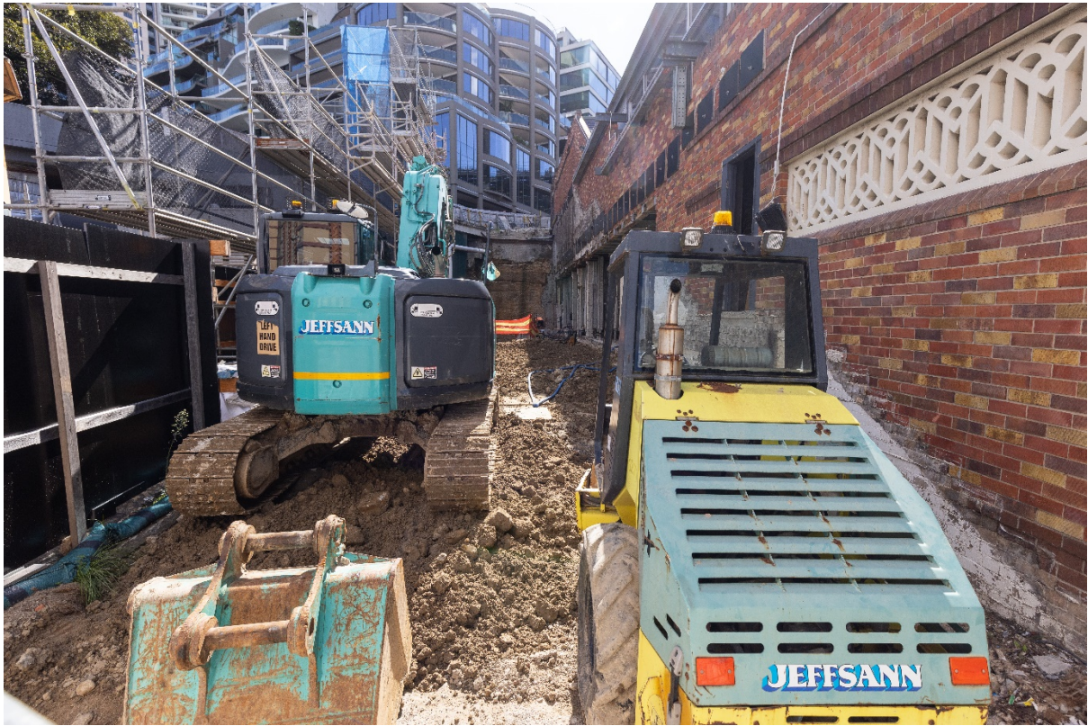
Paul St Stairs 14/3/2022