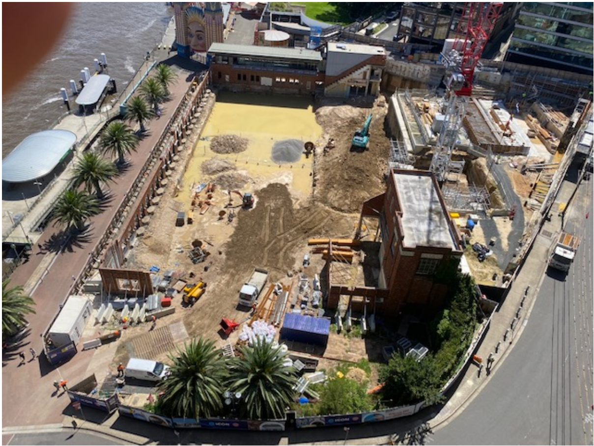
View from the Harbour Bridge 10/3/2022