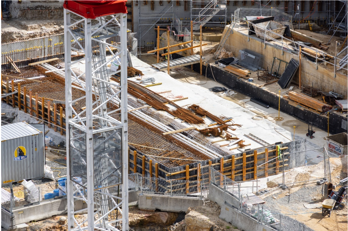
Program pool under construction 14/3/2022