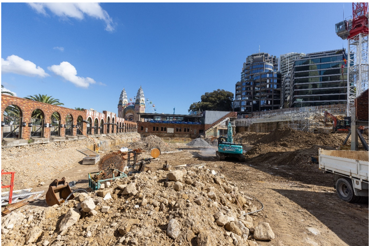
50m pool 14/3/2022