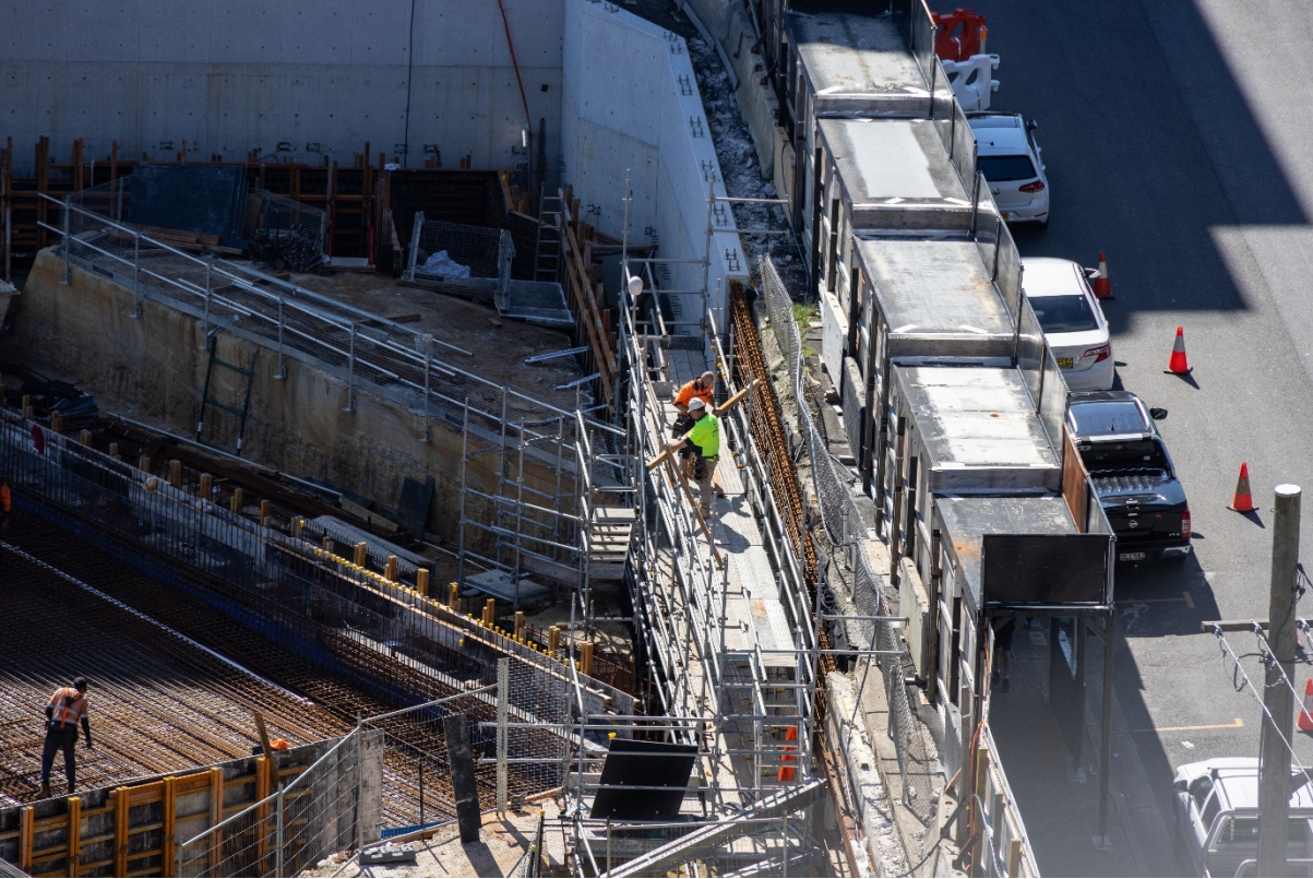
The old Hopkins Park 11/4/2022