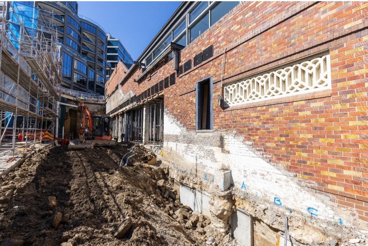
Western Stairs 11/4/2022