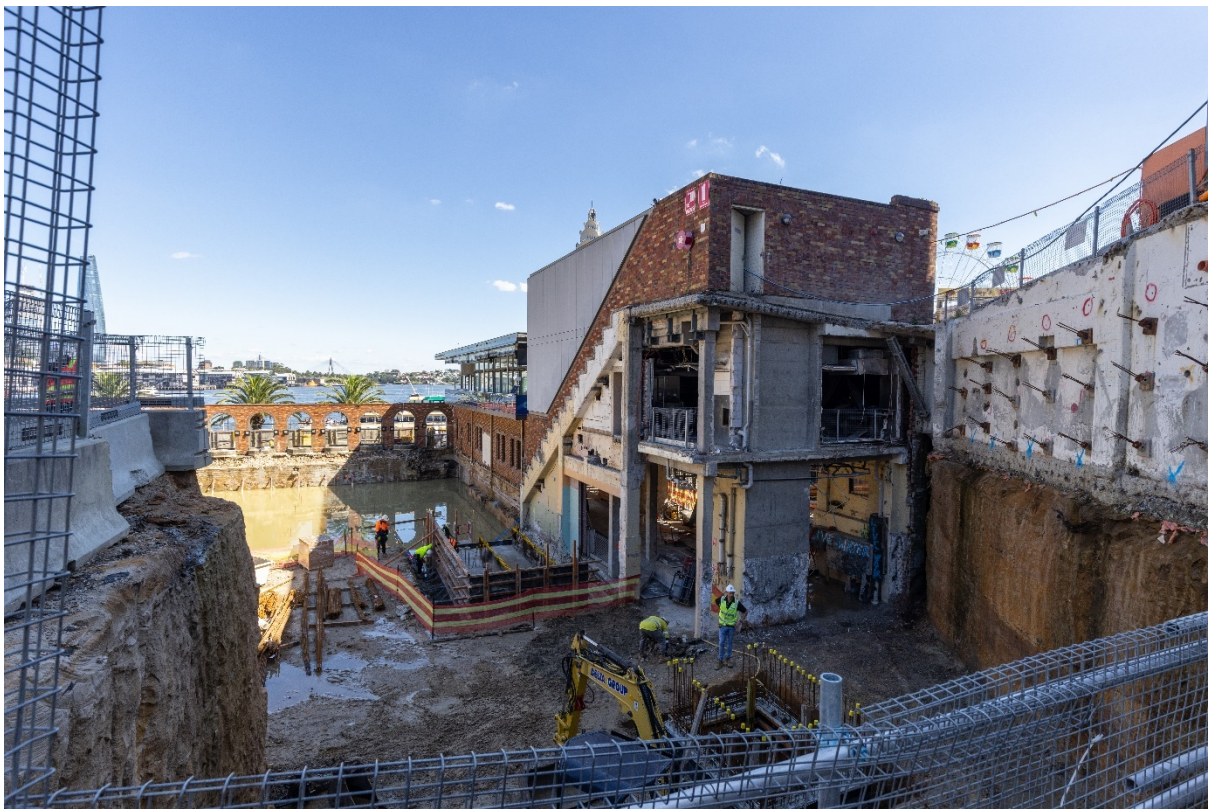
Lift pit and stairwell under construction 11/4/2022