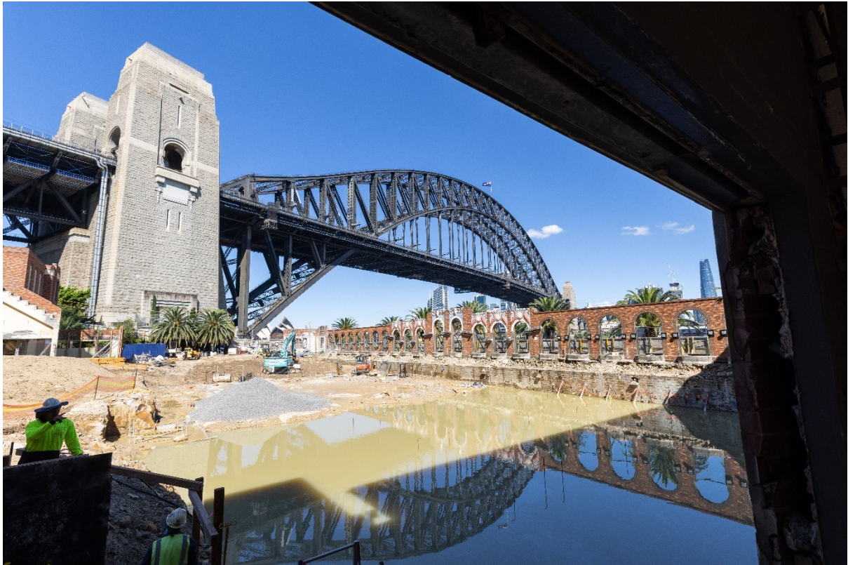
50m pool 11/4/2022