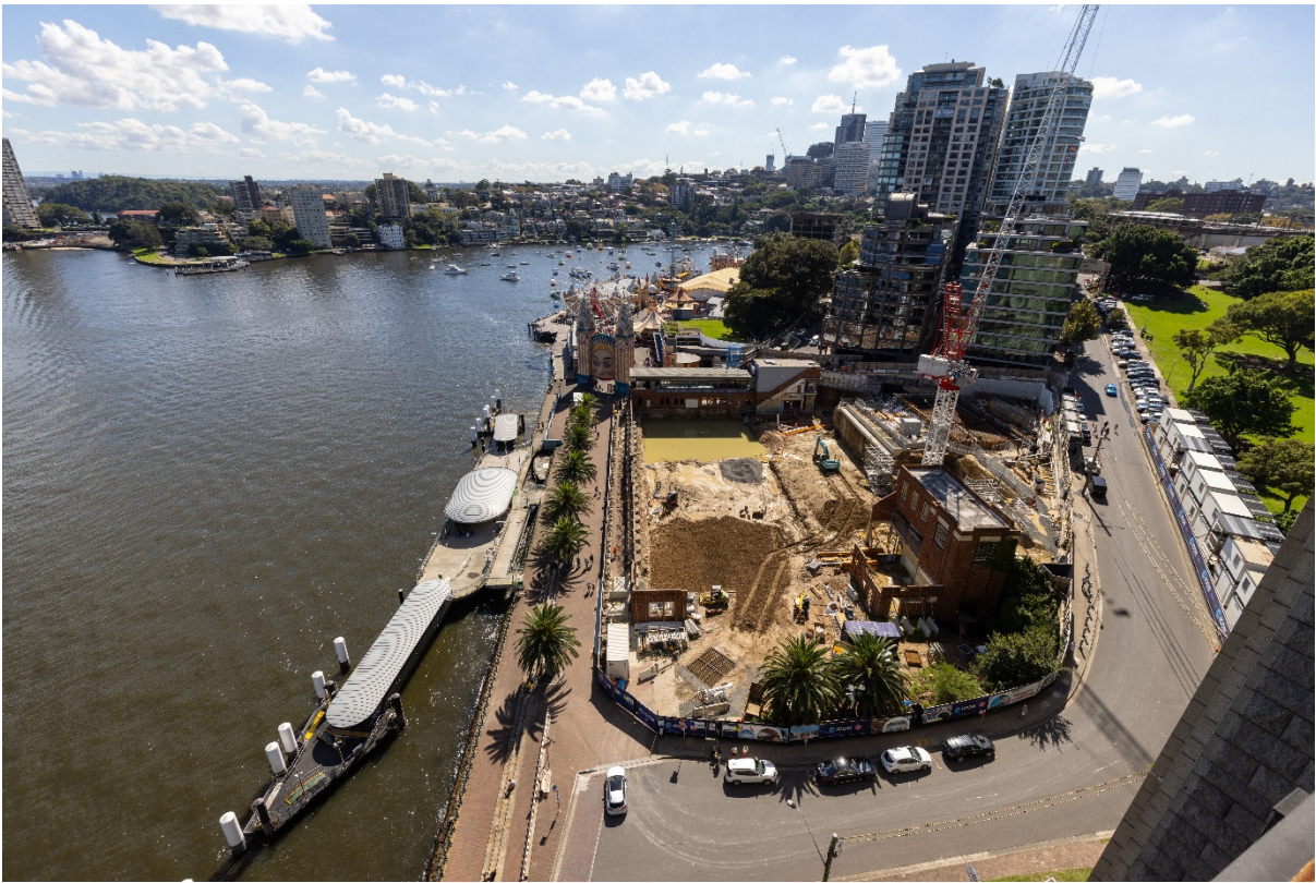
View from the Harbour Bridge 11/4/2022