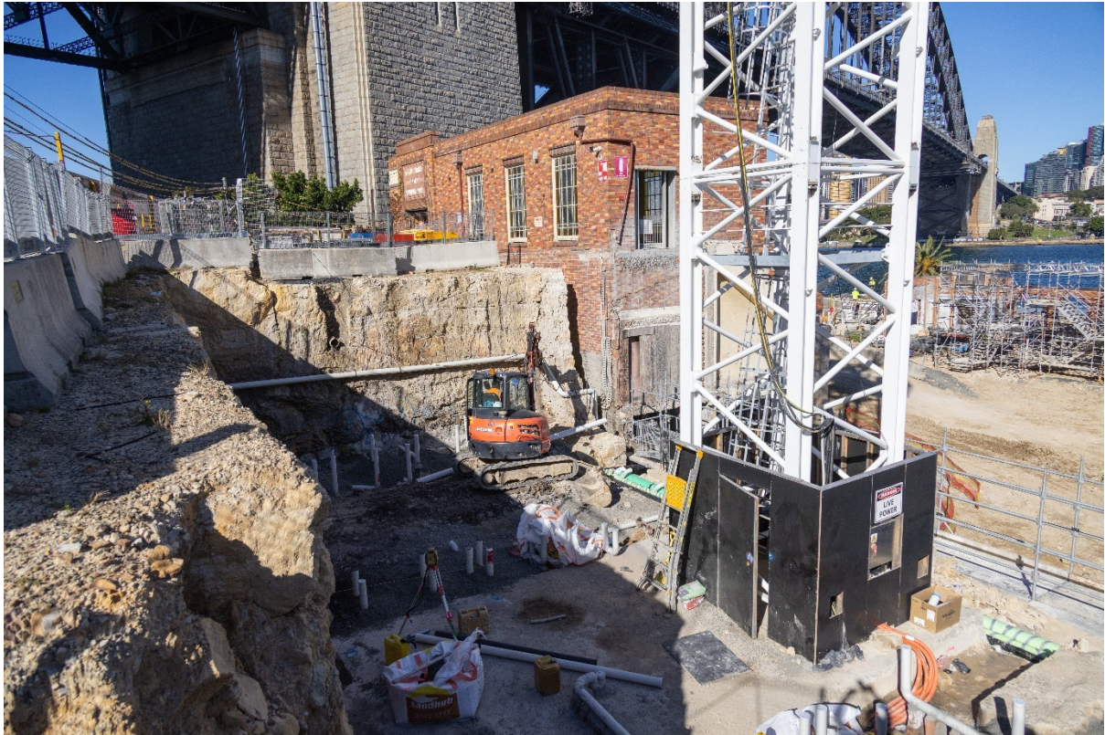
Level 2 Amenities 09/06/2022