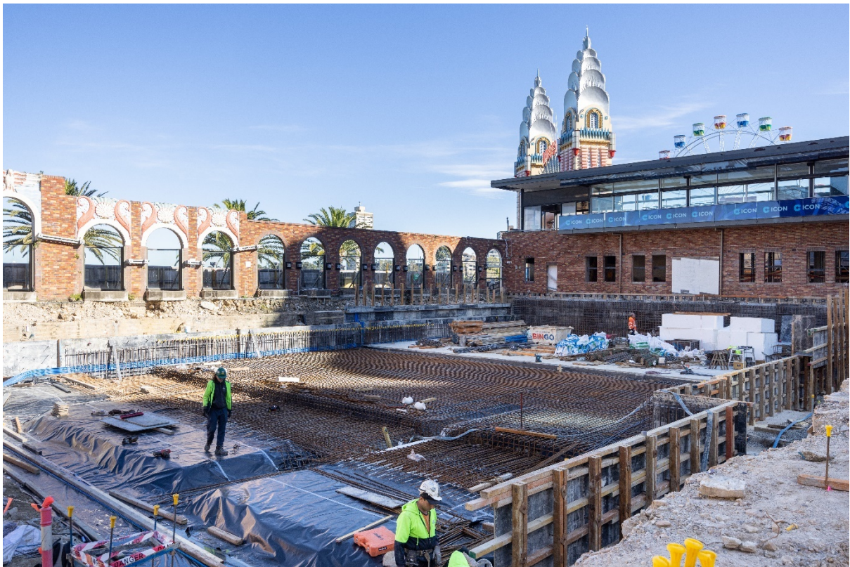
50m pool 09/06/2022