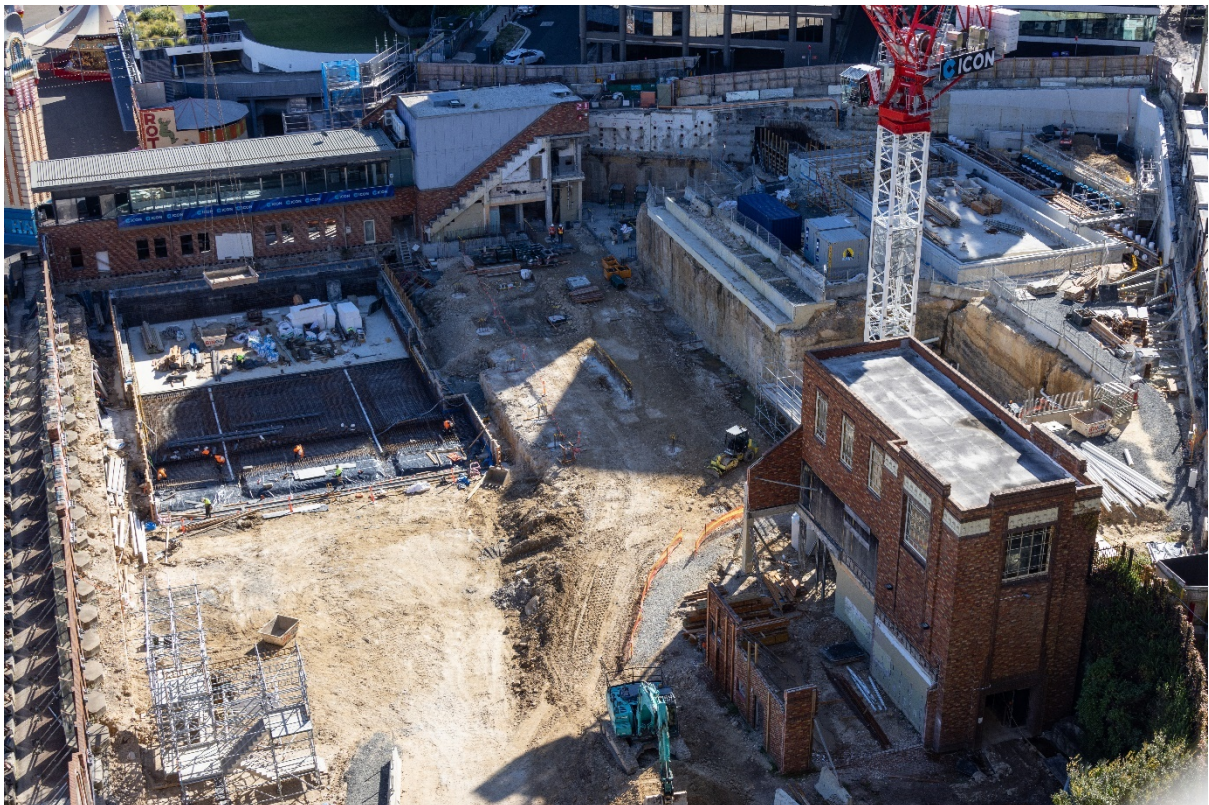
View from the Sydney Harbour Bridge 9/6/2022