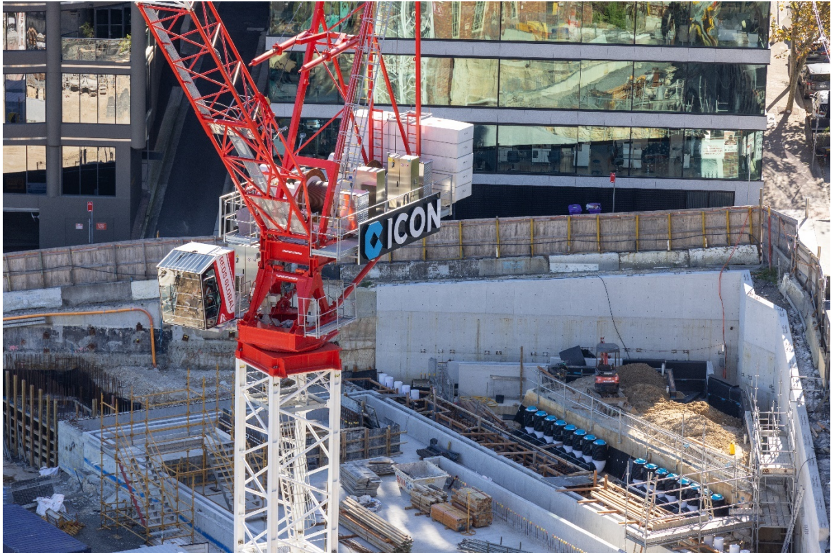
The old Hopkins Park 09/06/2022