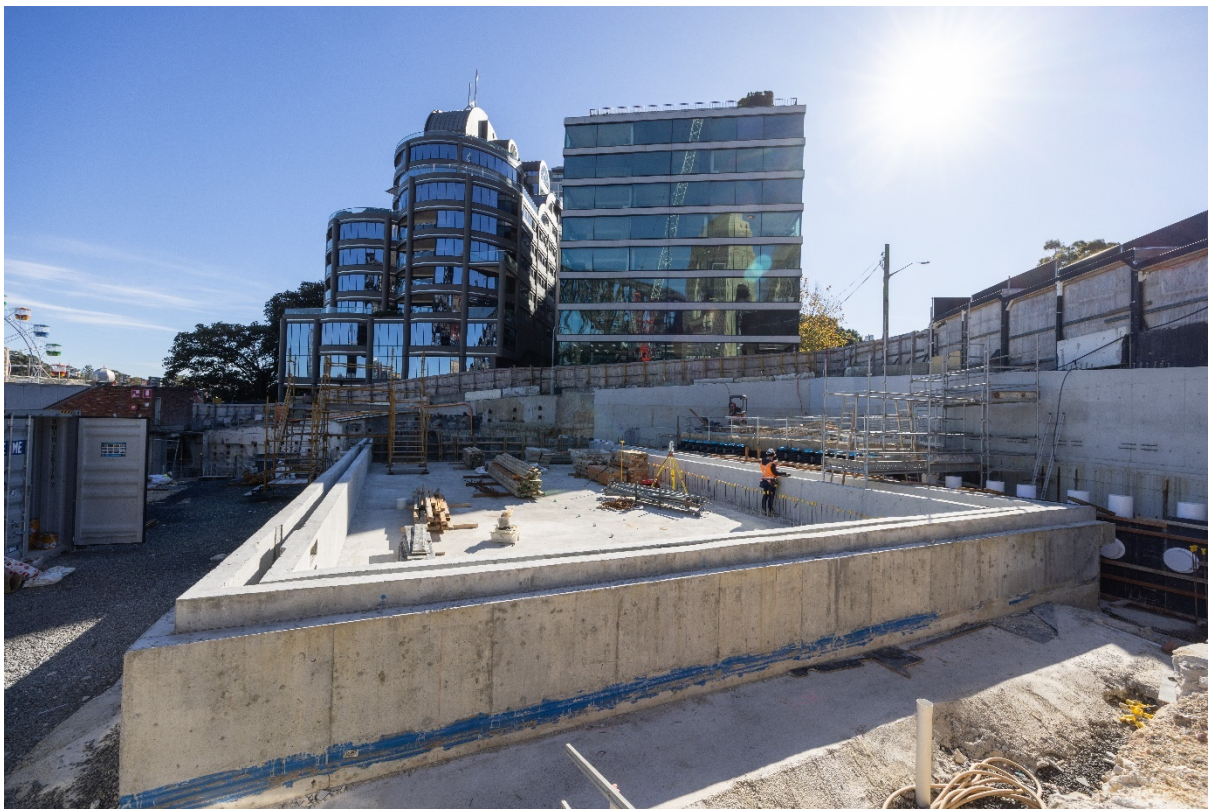
Program pool under construction 09/06/2022