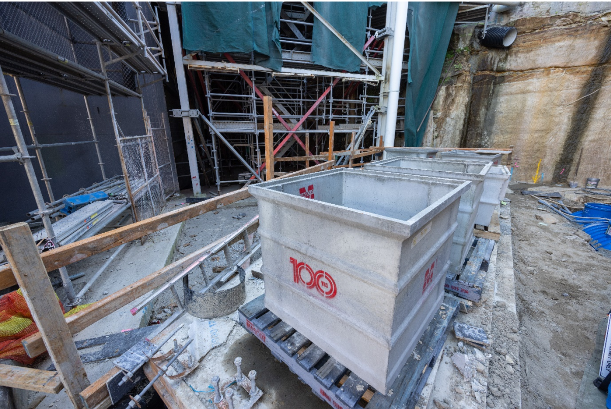
Western Stairs 09/06/2022